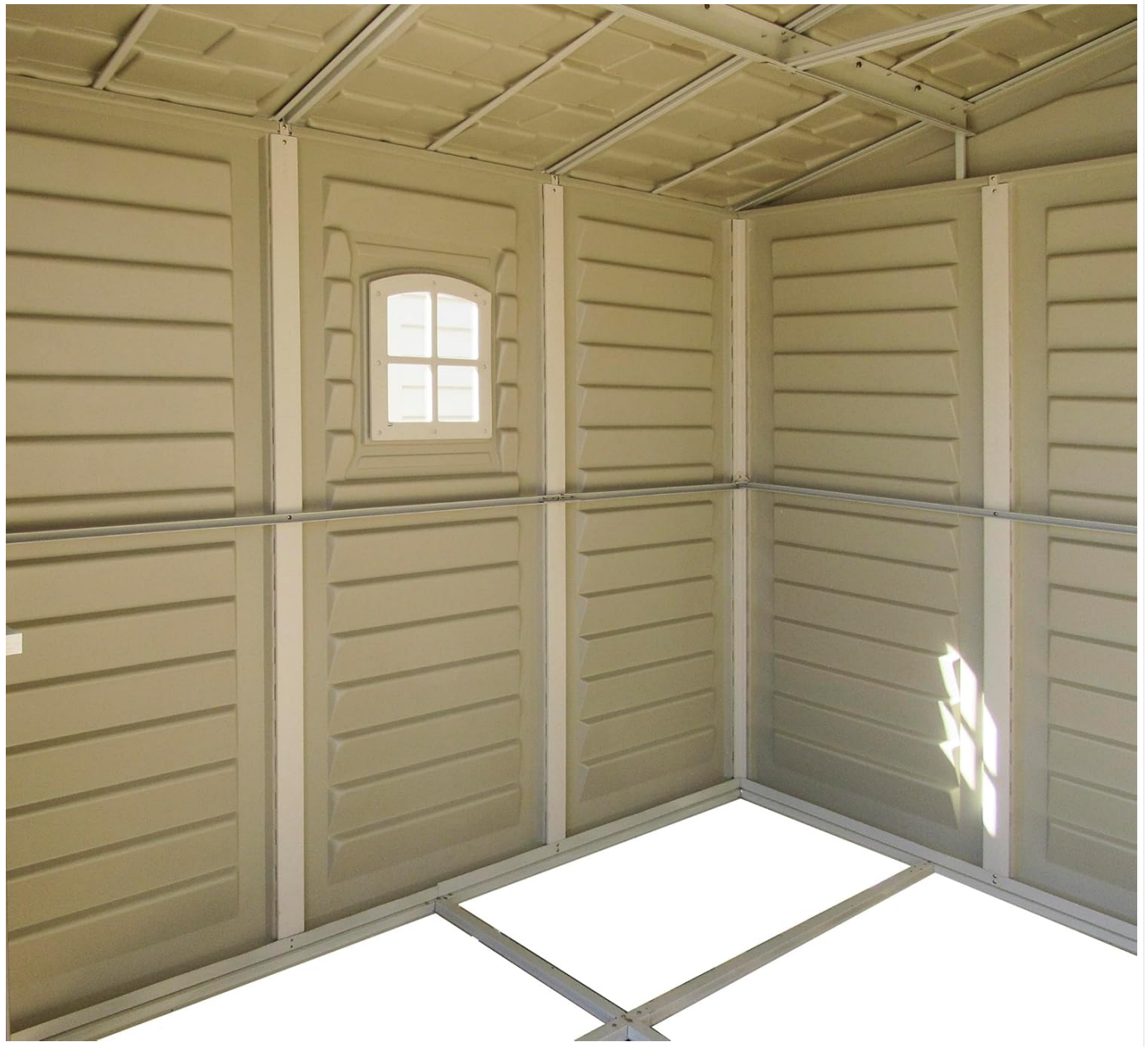
Figure 2: Fixed waterproof window detail