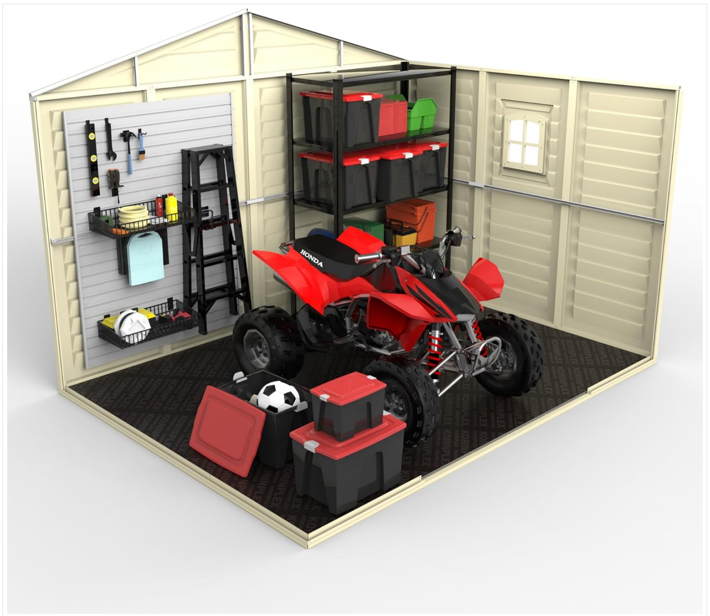
Figure 8: Shed accommodating large items like an ATV