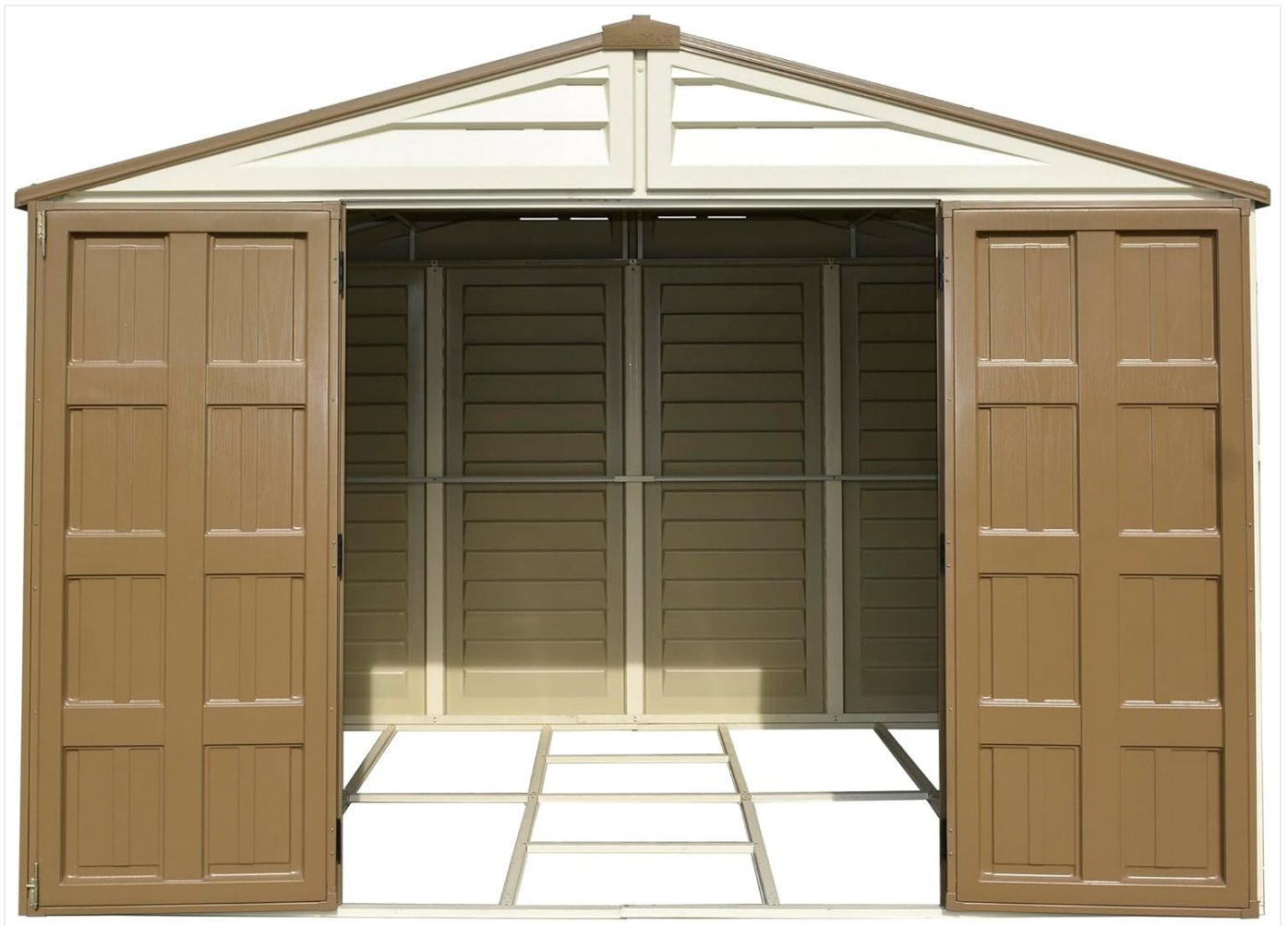
Figure 4: Metal foundation kit in place

For detailed, step-by-step assembly instructions, please refer to the separate assembly manual included with your product packaging. Online versions may also be available on the manufacturer's website.