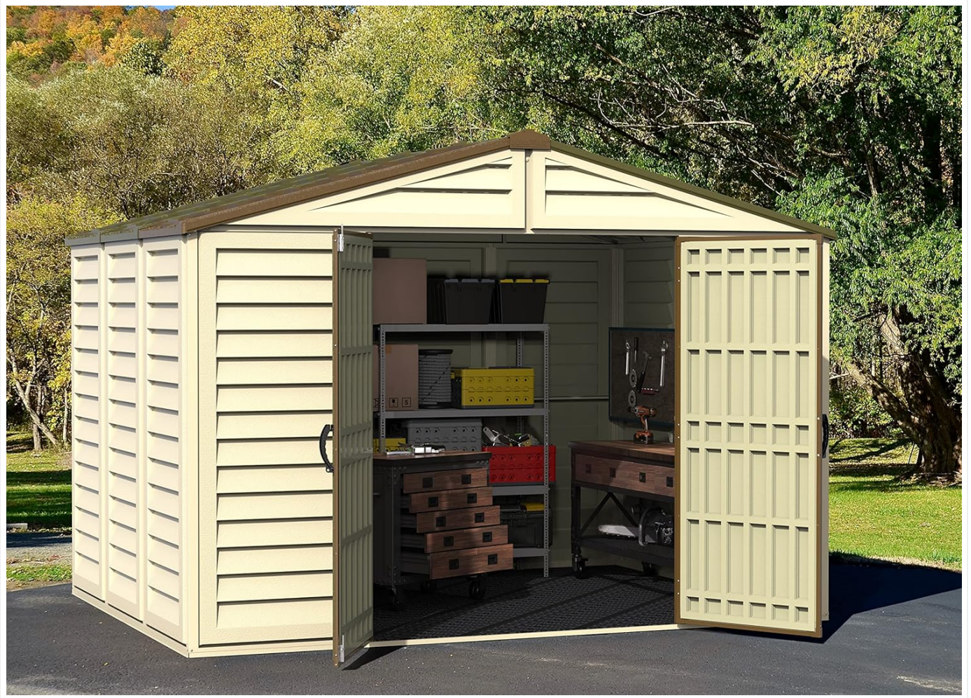
Figure 7: Organized shed interior demonstrating storage potential