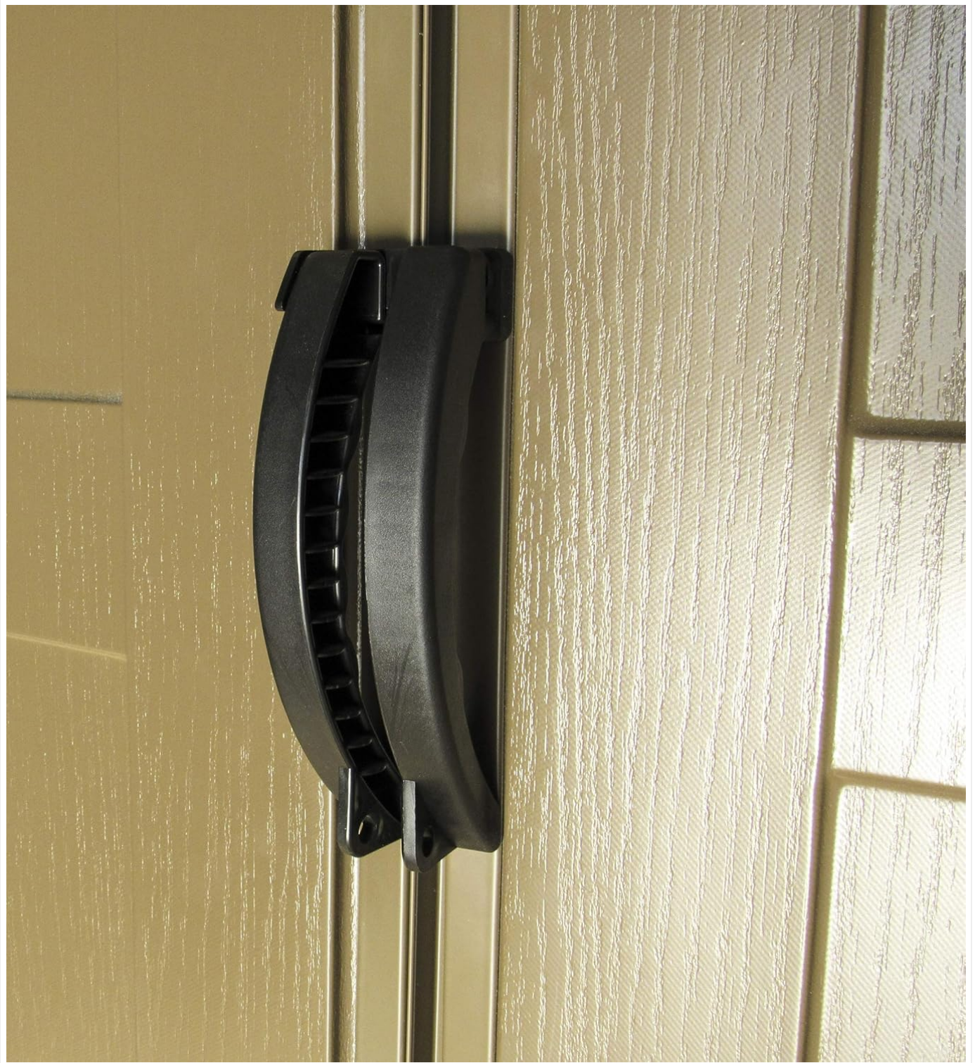
Figure 3: Lockable door handle