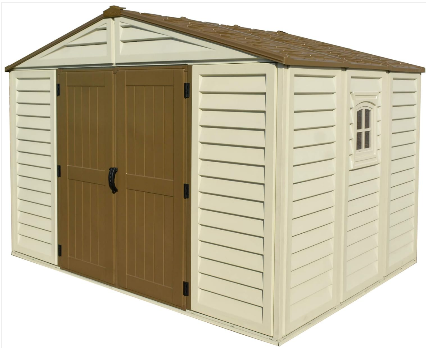
Figure 1: Duramax Woodbridge Plus 10.5 x 8 Plastic Garden Shed