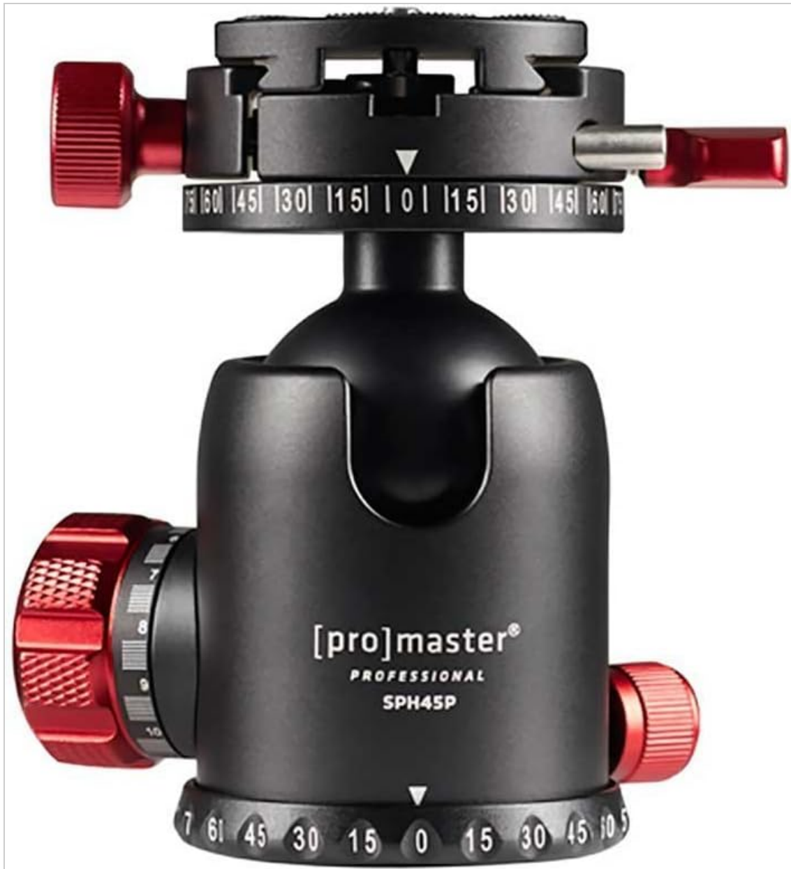
Figure 1: Close-up of the professional-grade ball head, showing adjustment knobs and quick release plate mechanism.