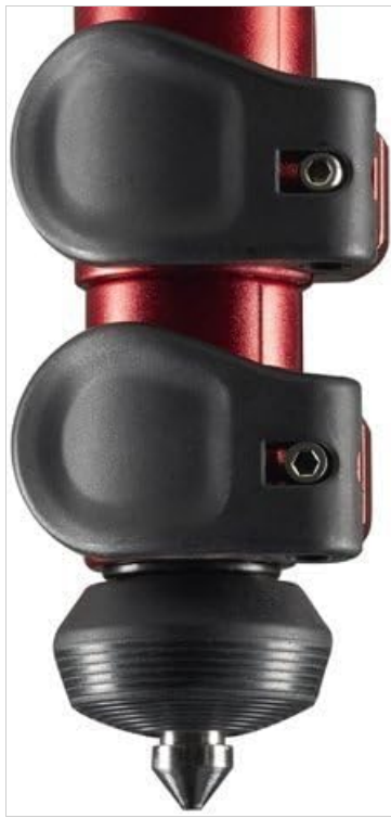
Figure 2: Detail of the tripod leg locks and feet, illustrating the robust construction for stability.