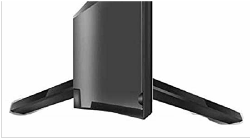
Image: Side view of the TV, illustrating the location of HDMI and USB ports for easy access.