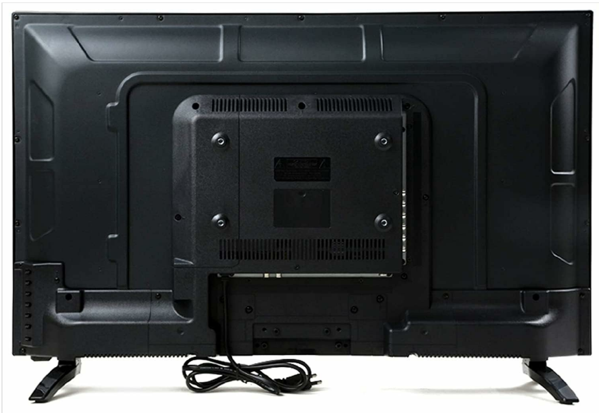
Image: Rear view of the TV, illustrating the wall mount screw holes and various input/output ports.