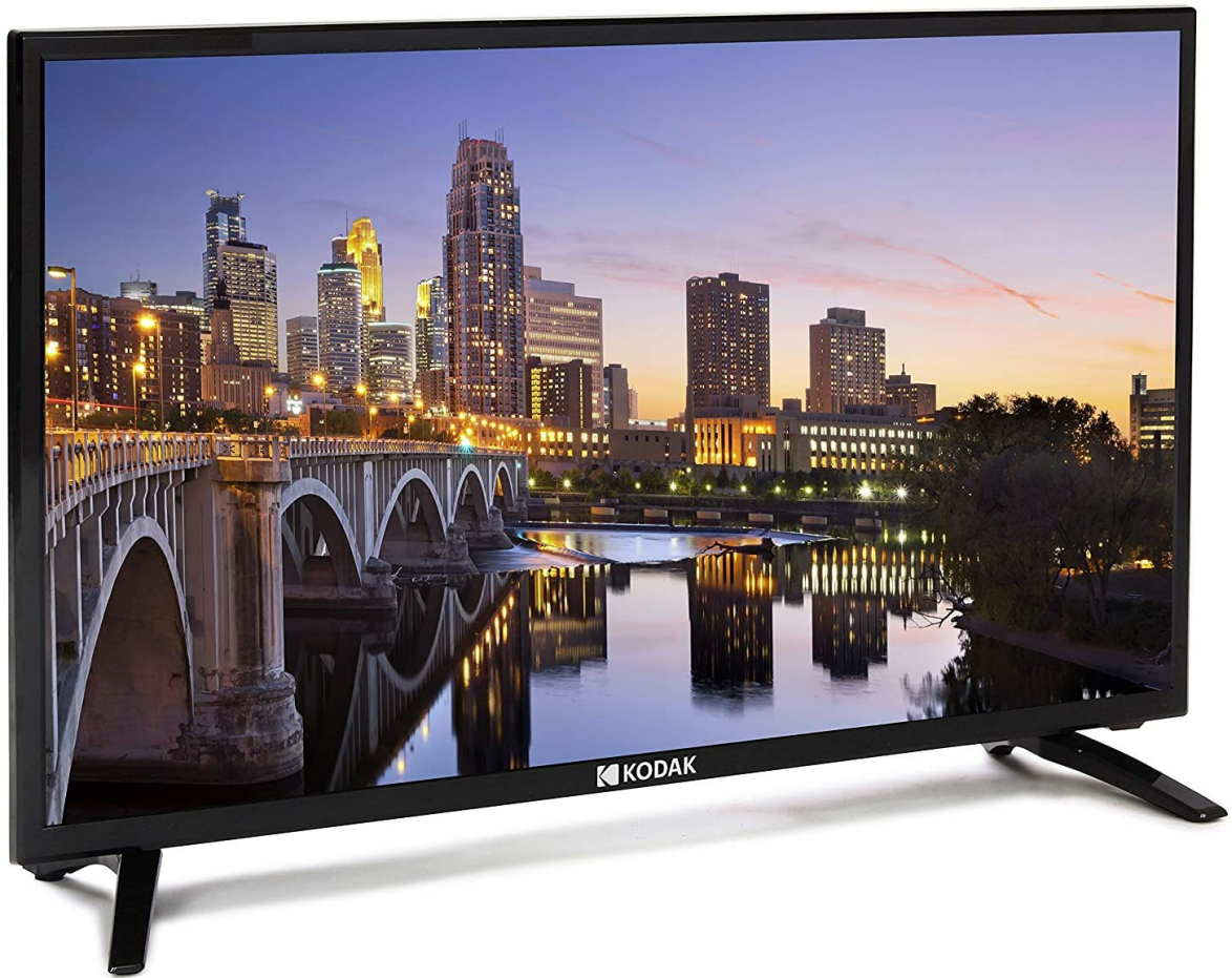
Image: Front view of the Kodak 32HDX900S TV with its included stands.