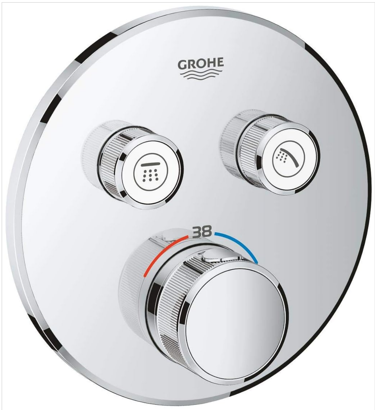
Figure 1: Front view of the GROHE Grohtherm SmartControl Thermostat, showcasing its round, chrome design with two push-button controls and a central temperature dial.