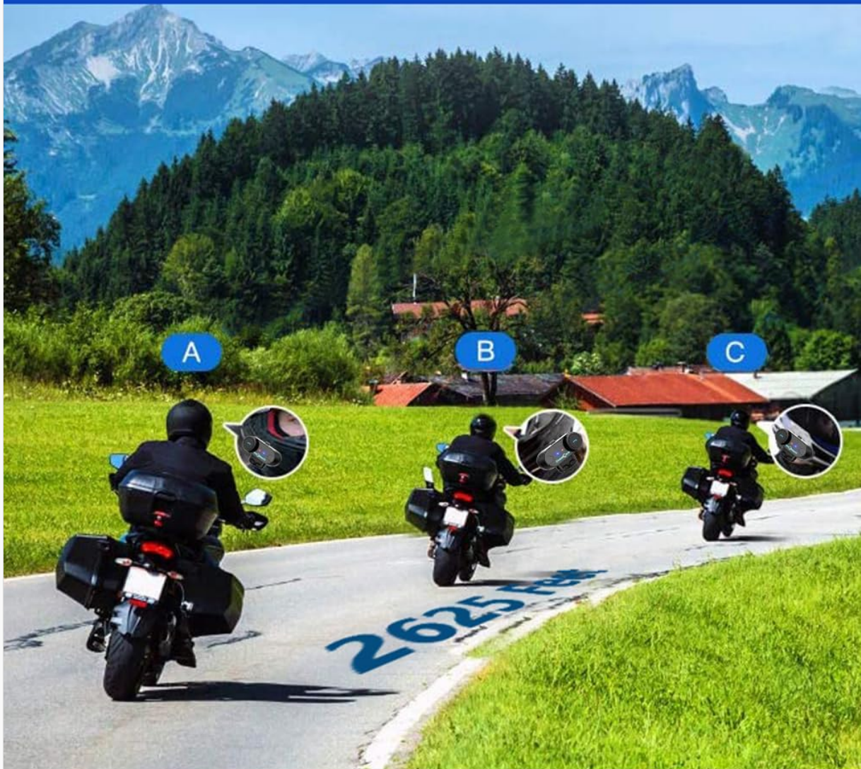
Image: 3 riders pairing, 2 riders intercom at the same time.