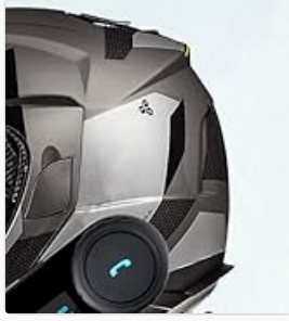
Image: Contents of the FreedConn TCOM VB package.