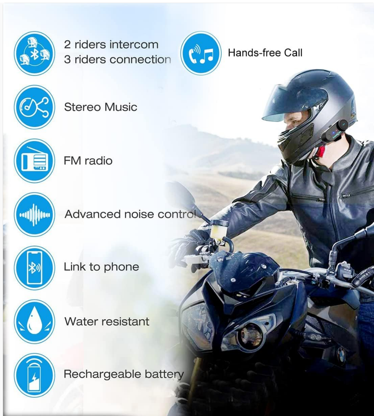
Image: Overview of FreedConn TCOM VB Intercom key features.