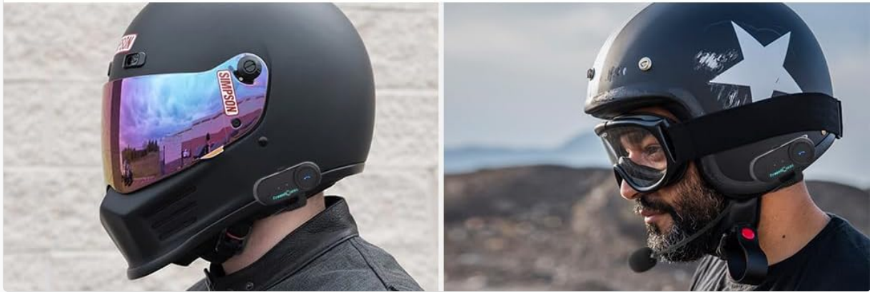
Image: Hard and soft cable microphone options for helmet installation.