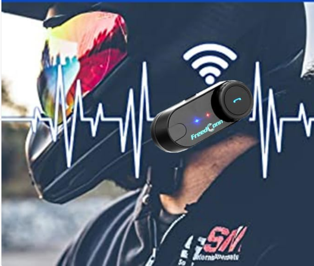
Image: Built-in FM Radio feature.