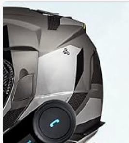
Image: Step-by-step installation guide for the intercom unit.