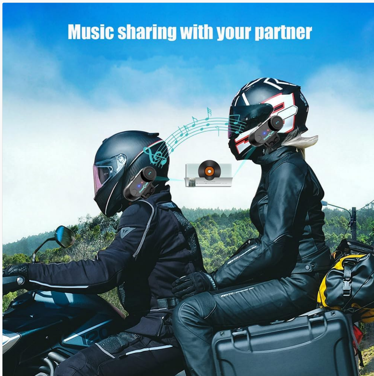
Image: Music sharing with a partner.

combination in the full manual) to share audio with a paired intercom unit.