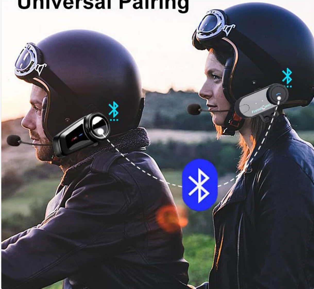
Image: Universal pairing feature.

Your browser does not support the video tag.