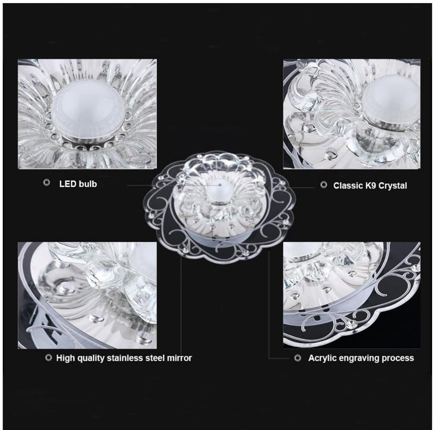
Figure 4.1: Key components of the lamp, including the LED bulb, K9 Crystal, high-quality stainless steel mirror, and acrylic engraving process.