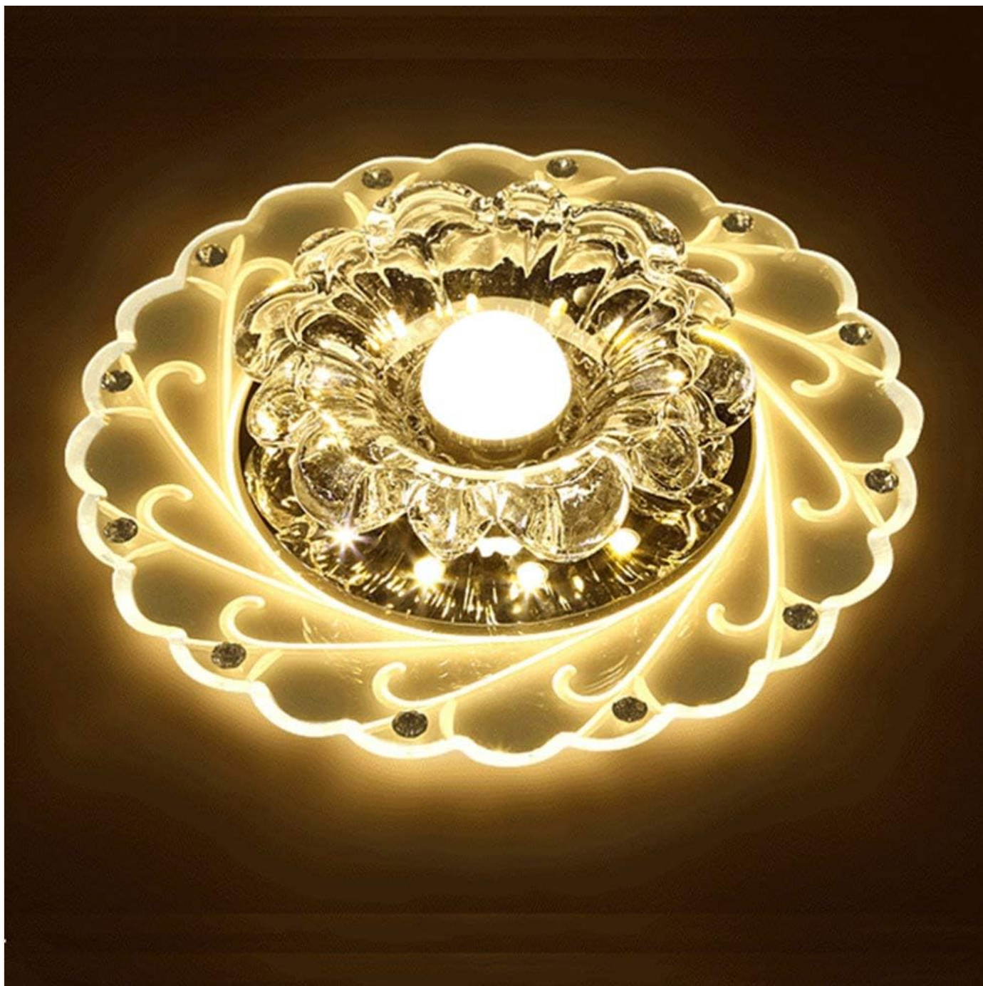
Figure 3.1: The SENYANG Crystal Ceiling Lamp, showcasing its warm illumination and intricate design.