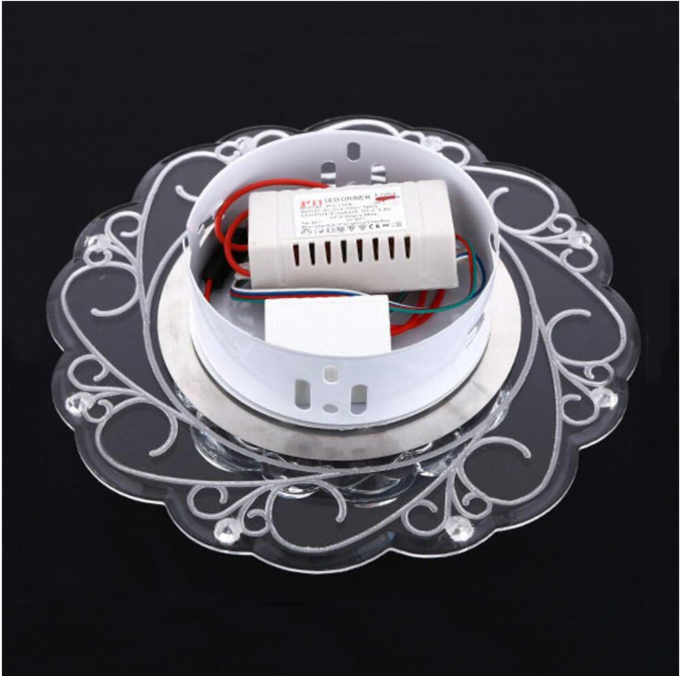
Figure 5.1: View of the internal wiring and LED driver, illustrating the simple two-wire connection.