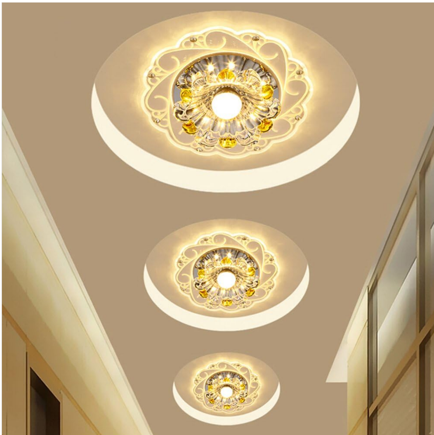
Figure 6.1: Example of multiple SENYANG Crystal Ceiling Lamps installed in a hallway, demonstrating their aesthetic appeal when illuminated.