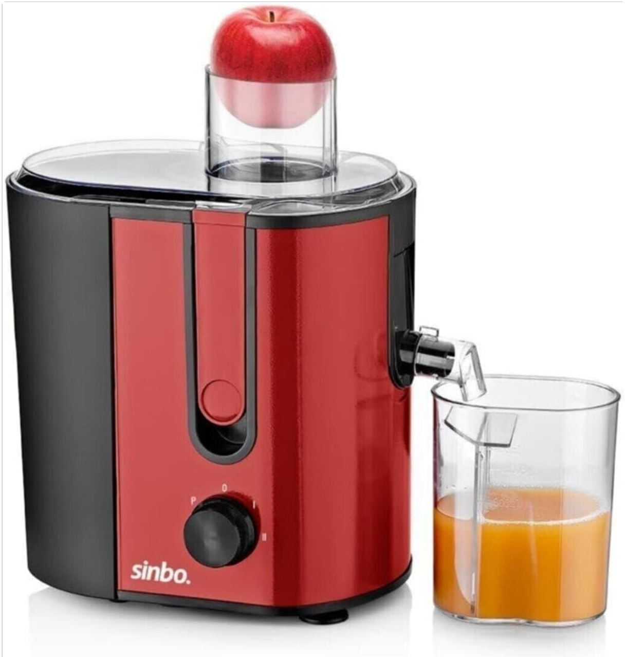
Figure 1: Sinbo Centrifugal Juice Extractor SJ-3143. This image displays the assembled juicer in red and black, with a whole red apple positioned in the transparent feed chute. A clear juice cup is placed under the spout, containing freshly extracted orange juice. The control knob is visible on the front of the motor base.