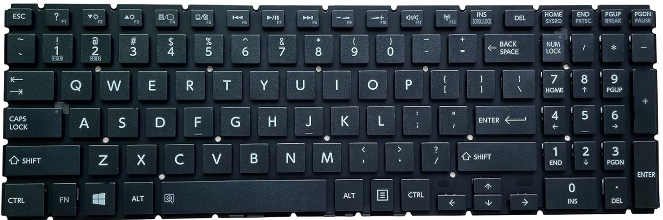
A clear top-down view of the keyboard, highlighting the US English layout and frameless design.

This replacement laptop keyboard is designed for various Toshiba Satellite models, featuring a US English layout, black color, and a frameless design without backlight. It is built for durability and comfortable typing.