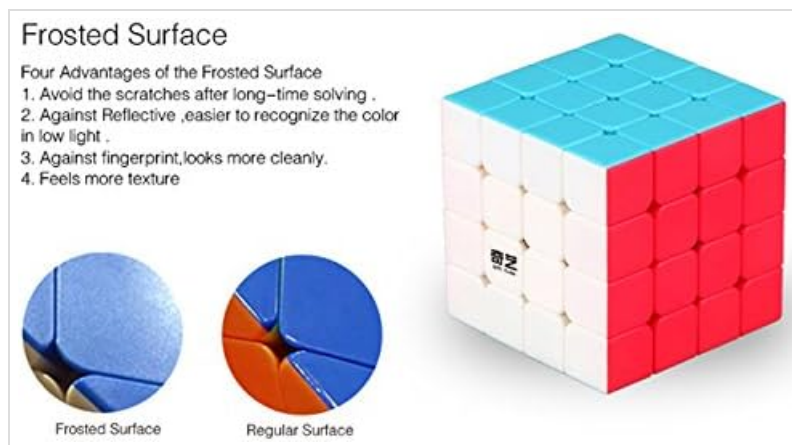
Image 2: A close-up comparison illustrating the tactile difference between the frosted surface of the QiYuan S V3 and a regular glossy surface, highlighting the improved texture and scratch resistance.