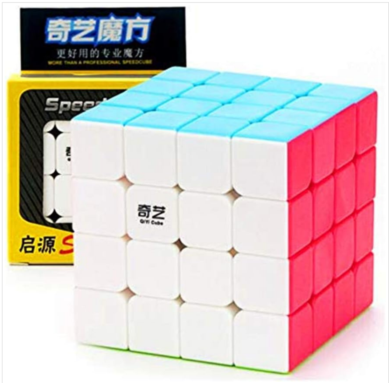
Image 1: The Qiyi QiYuan S V3 4x4 Stickerless Speed Cube, showcasing its vibrant colors and frosted surface.