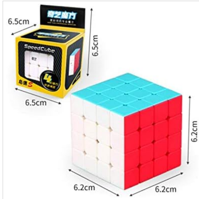
Image 5: Visual representation of the cube's dimensions, indicating its compact and manageable size.