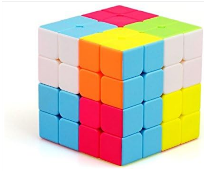
Image 4: A scrambled 4x4 speed cube, illustrating the challenge of restoring each face to a single color.