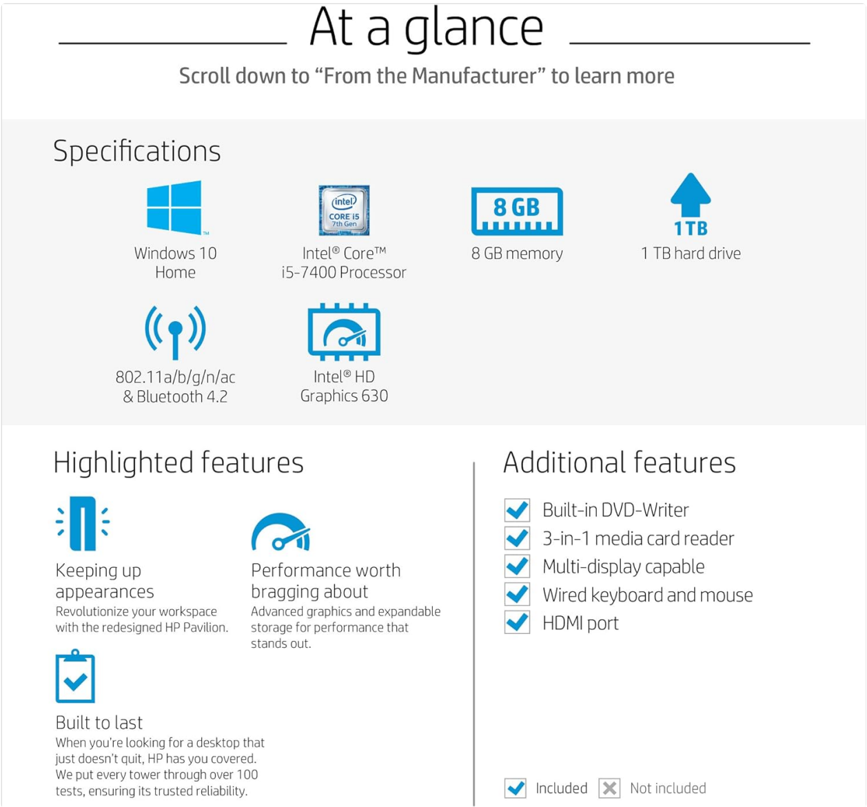
Image: An infographic detailing key specifications and highlighted features of the HP Pavilion Desktop PC 570-p020.

For more complex issues or persistent problems, refer to the HP support website or contact HP technical support.