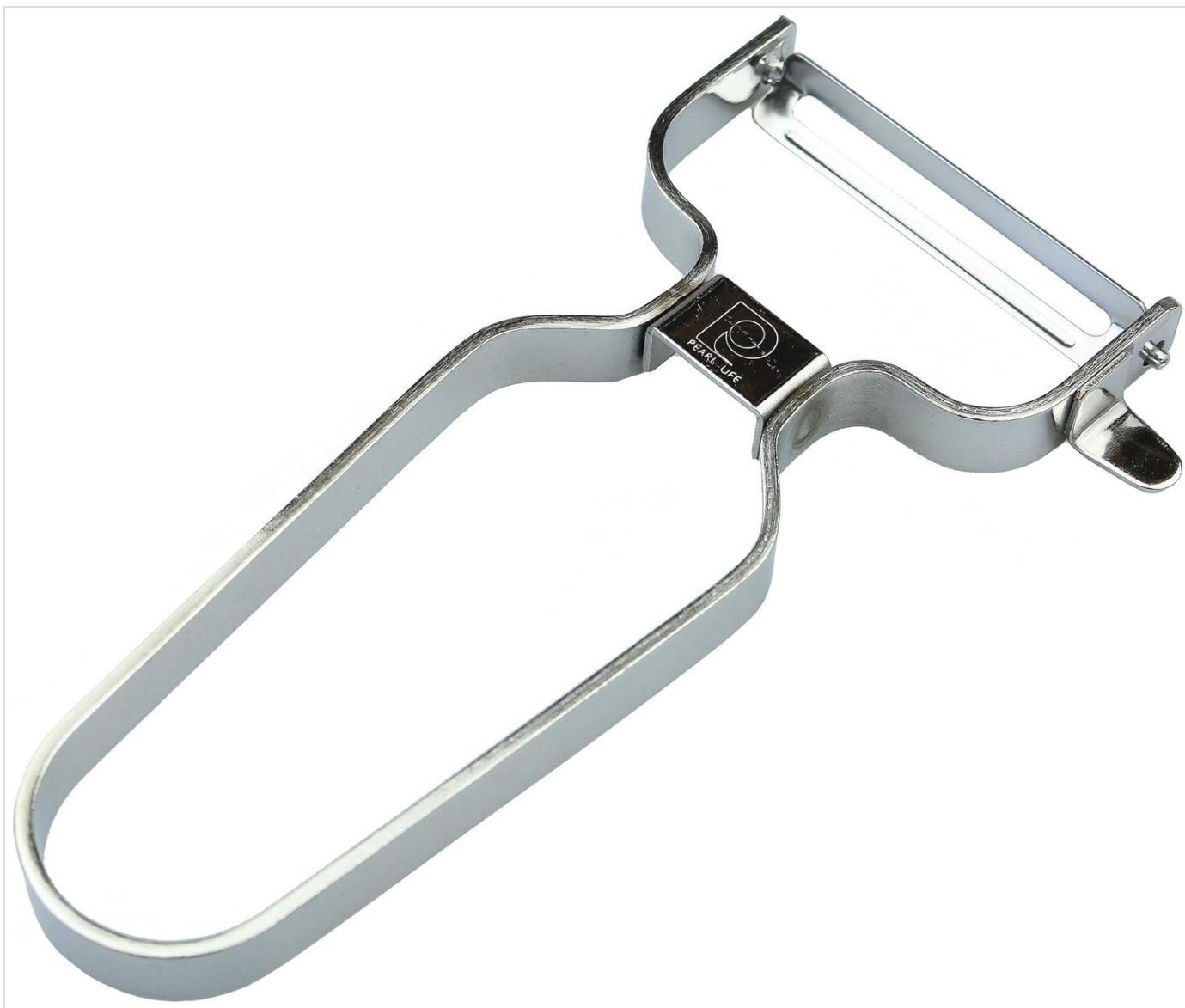
Image: The Pearl Metal CC-1008 Vegetable Live Peeler, a stainless steel Y-shaped peeler with a comfortable handle and a sharp, rotating blade.