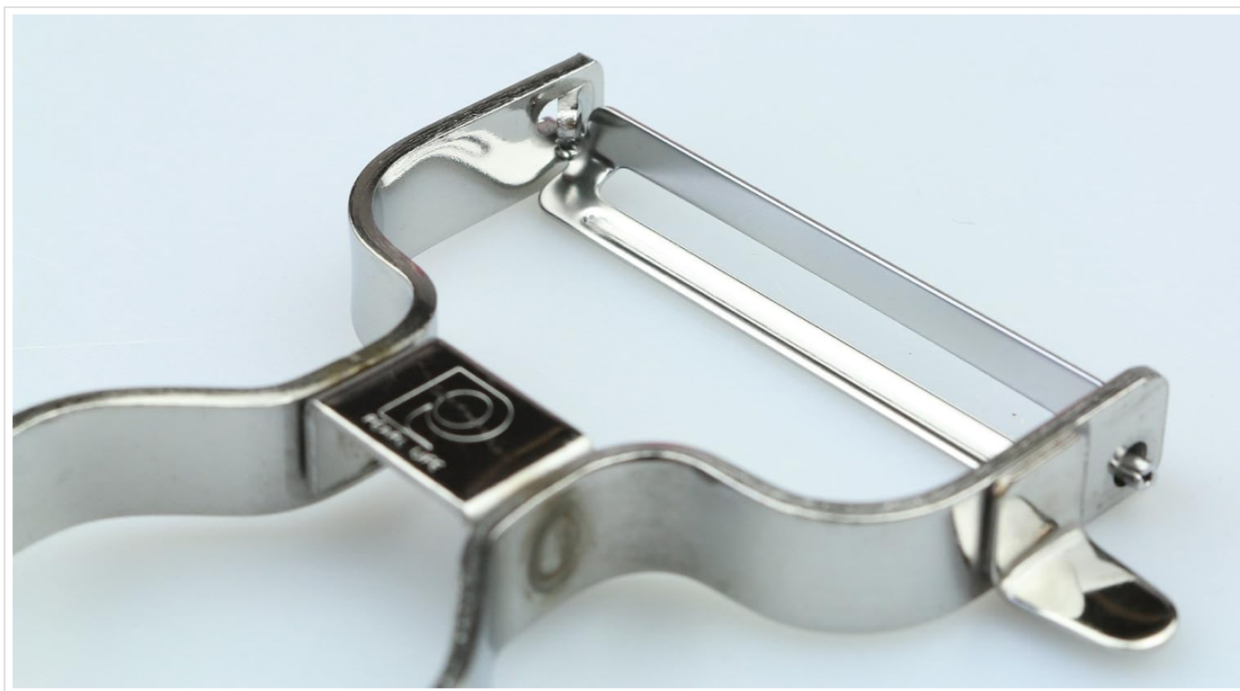
Image: A close-up view of the peeler's stainless steel blade, highlighting its smooth surface for easy cleaning.