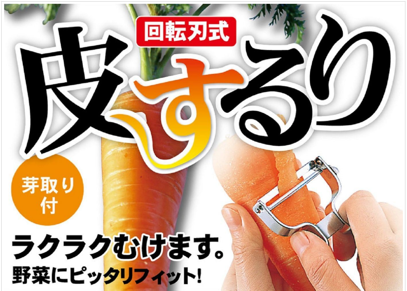
Image: A hand demonstrating the use of the peeler on a carrot, showing the efficient removal of the vegetable skin.