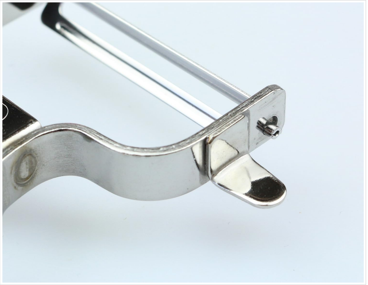
Image: A detailed view of the small, pointed tip on the side of the peeler, used for removing potato eyes and blemishes.