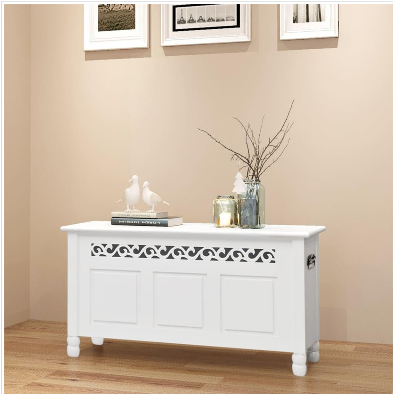
Image: The vidaXL Storage Bench Baroque Style MDF White, featuring its decorative front panel and classic design, positioned in a room.