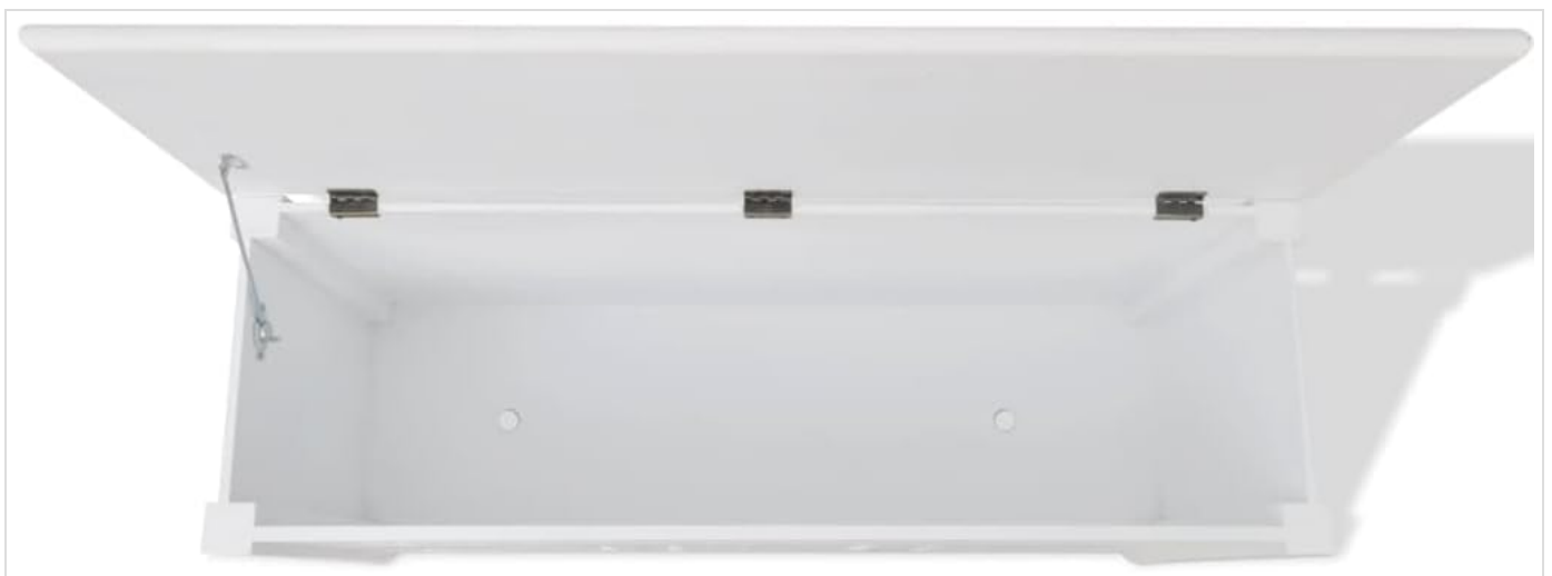
Image: An overhead view looking into the open storage compartment of the bench, highlighting its depth and capacity.