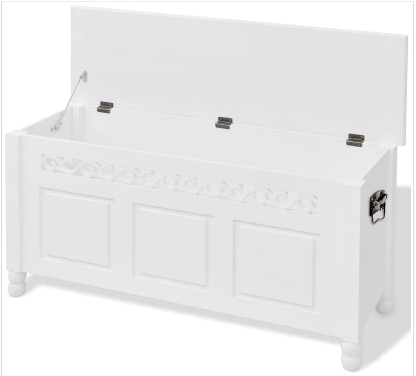
Image: The storage bench with its lid fully open, showcasing the ample interior space available for storage.