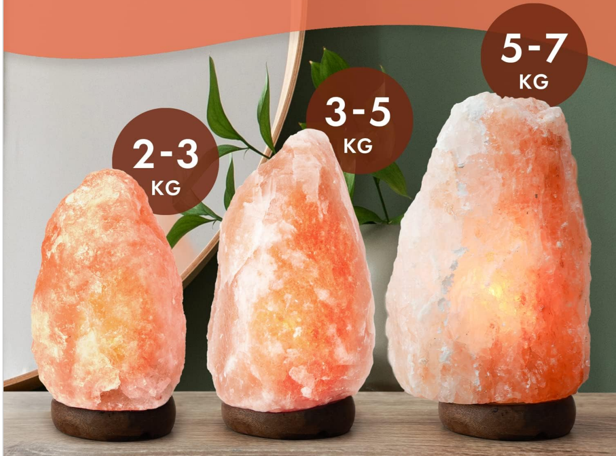
Image 8.1: Illustration of various lamp sizes available in the product line. This manual refers to the 3-5kg model.

Disponible en petit, moyen ou grand format .