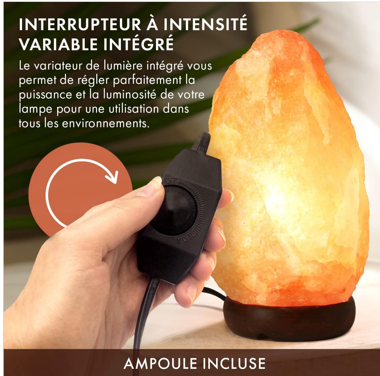
Image 5.1: Close-up of the integrated dimmer switch, demonstrating its function.