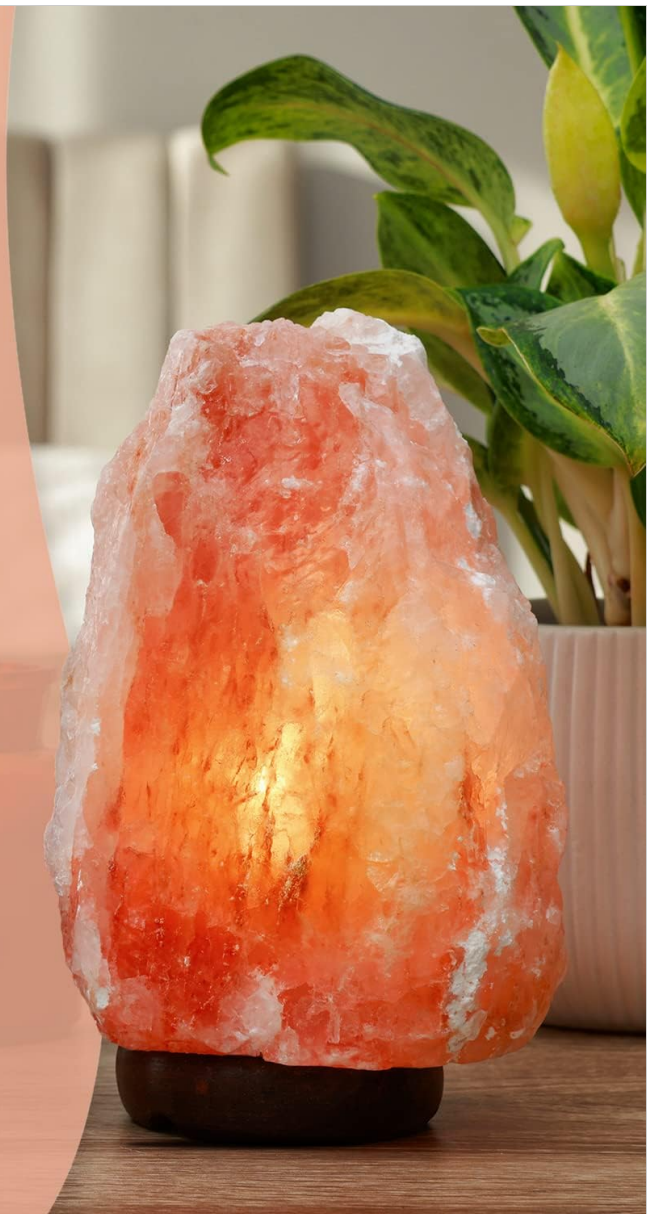
Image 1.1: The Body Source Himalayan Salt Lamp, showcasing its natural form and warm illumination.