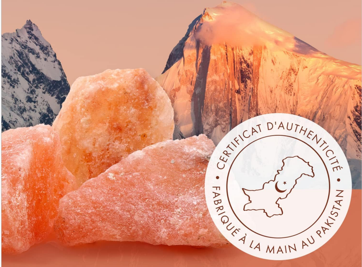
Image 1.2: Raw Himalayan salt crystals and an authenticity certificate, highlighting the lamp's natural origin.

Magnifiquement fabriquée à la main à partir de sel rose 100% pur et naturel provenant des hauteurs de l'Himalaya. Chaque lampe a une forme unique et distinctive.