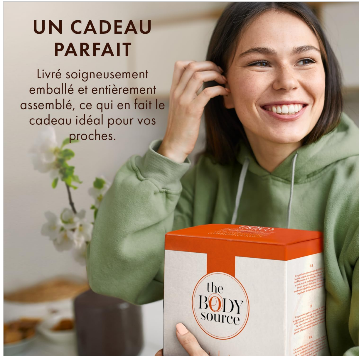
Image 3.1: The Himalayan Salt Lamp as it appears in its premium gift box.