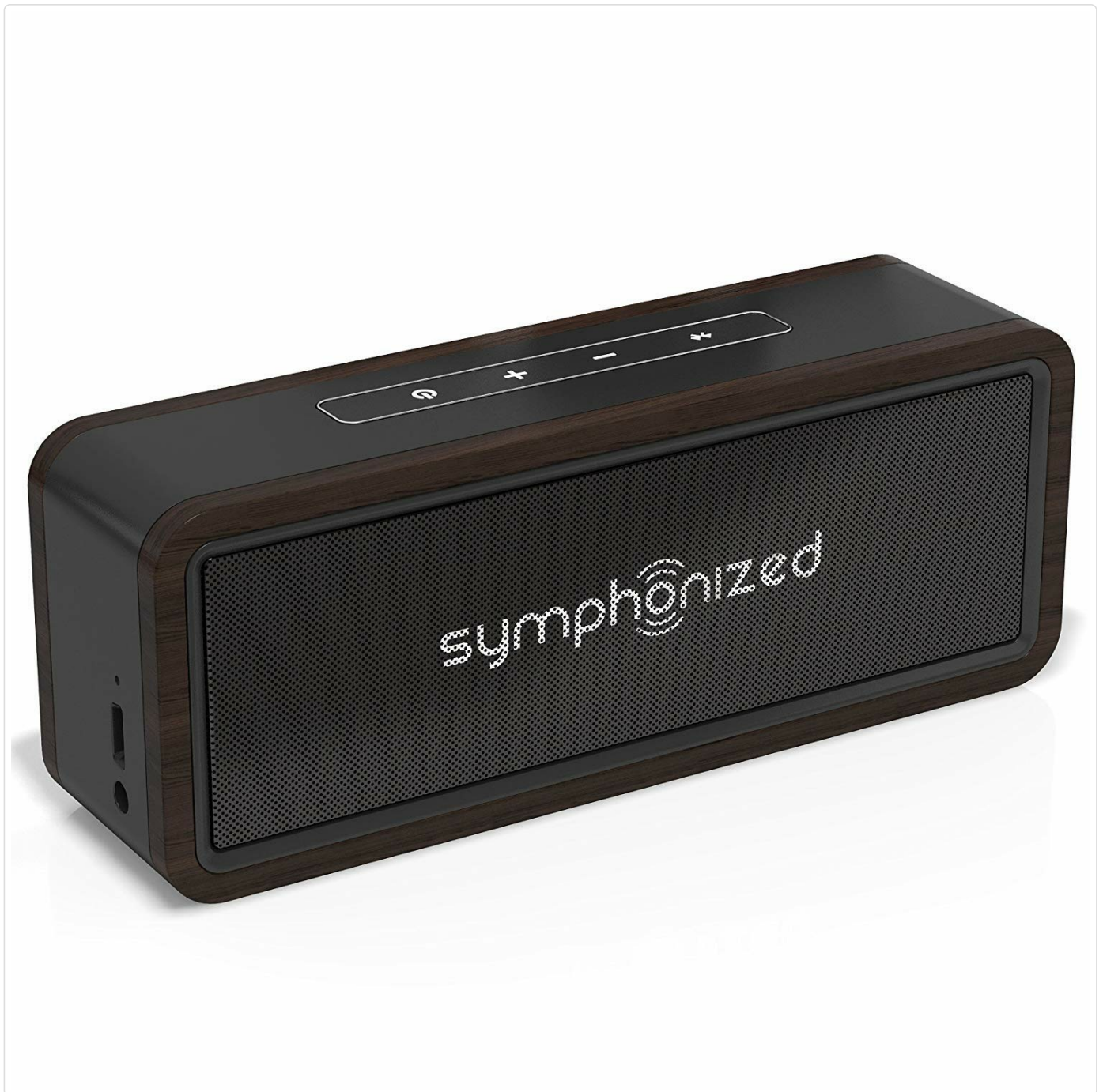
Front view of the Symphonized NXT 2.0 Portable Bluetooth Speaker, showcasing its dual speaker grilles and wood-grain finish.