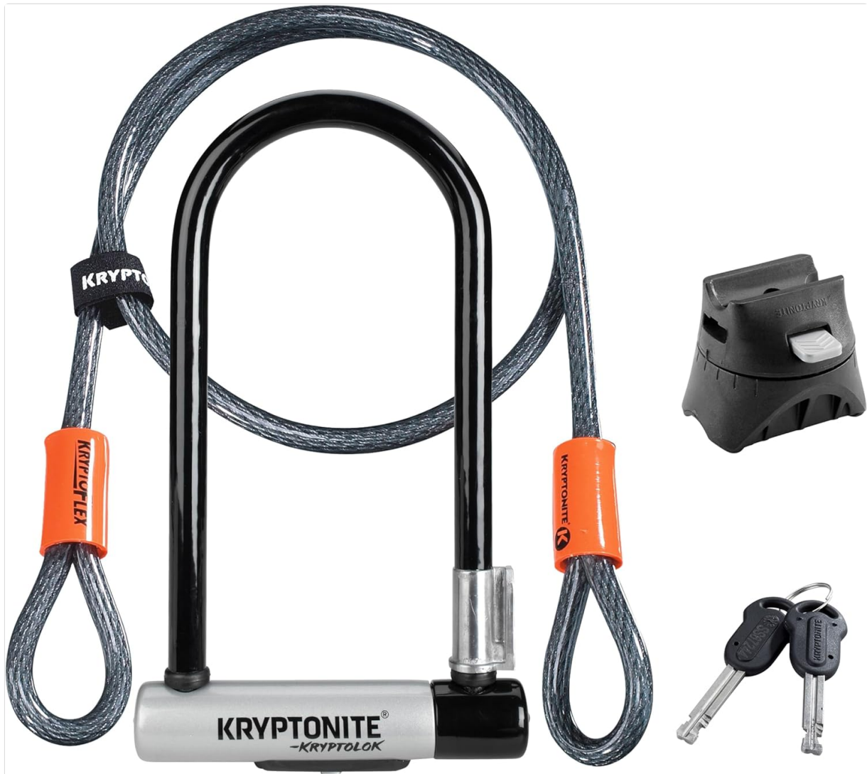
Image: The Kryptonite Kryptolok Standard U-Lock, showing its robust design.