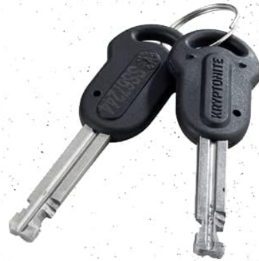
Image: Details of the Kryptonite Key Safe Program, showing replacement keys.

REGISTER YOUR KEYS ONLINE AND WE'LL SHIP 2 KEYS FOR FREE IN THE EVENT YOU LOSE THEM!