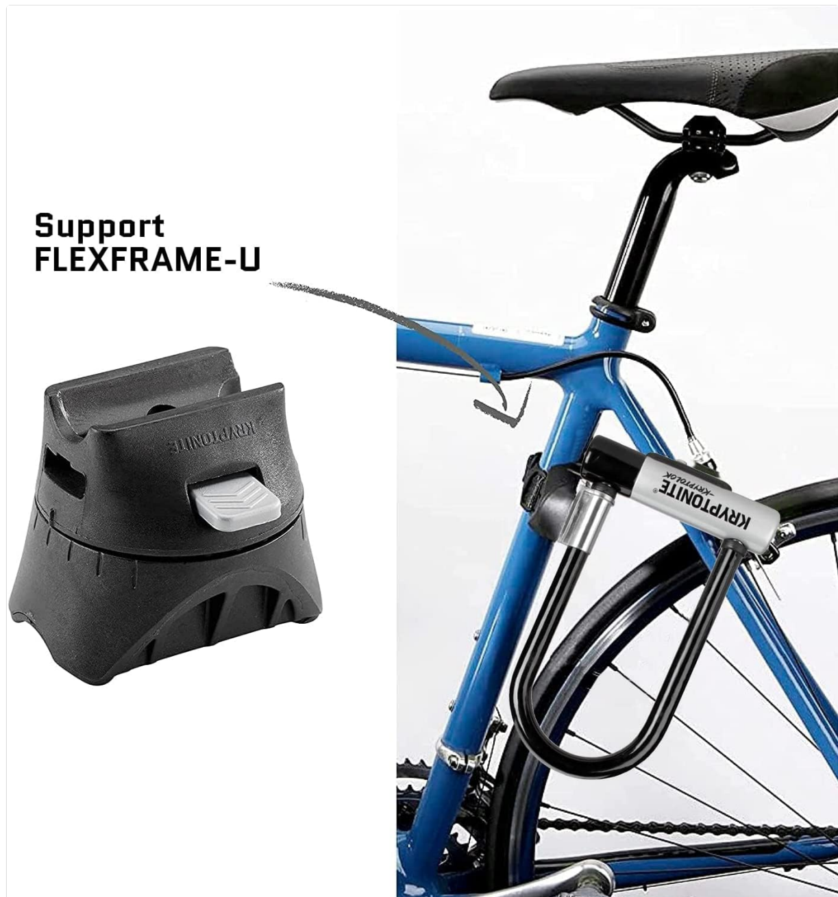
Image: The FlexFrame-U bracket attached to a bicycle frame, holding the U-lock securely.