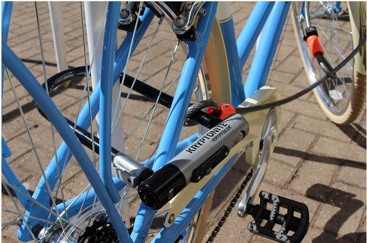
Image: A bicycle secured with both the Kryptonite Kryptolok U-Lock on the frame and rear wheel, and the KryptoFlex cable through the front wheel.

Image: Close-up of the Kryptonite Kryptolok U-Lock's locking mechanism, highlighting its robust construction.