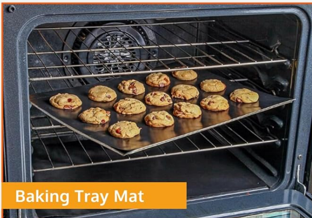
Baking Tray Mat