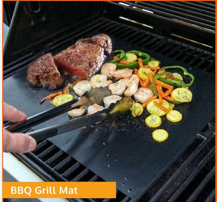
BBQ Grill Mat