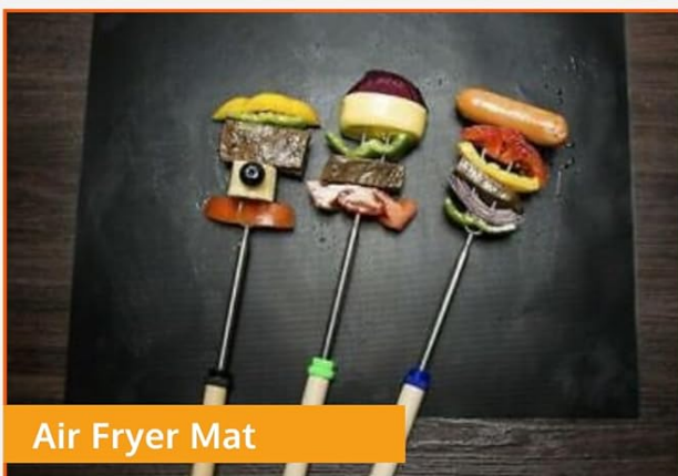
Air Fryer Mat