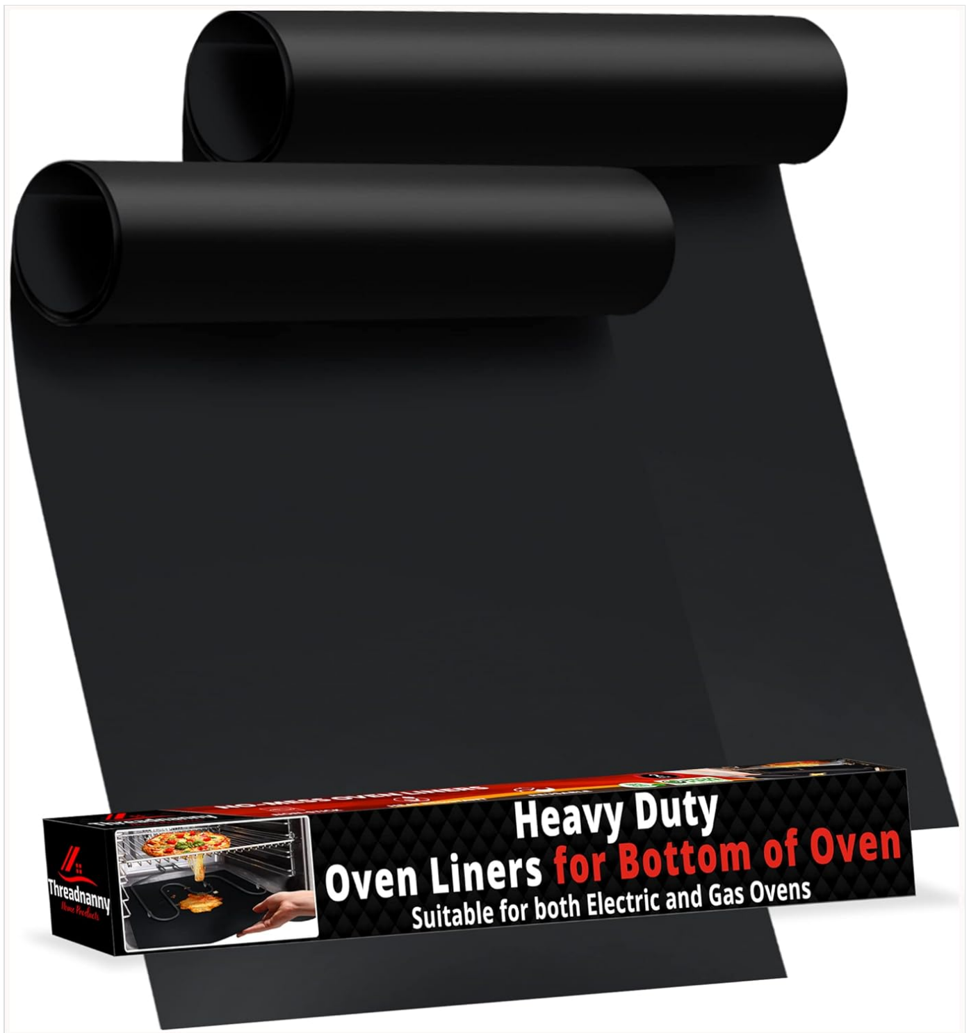
Image: Two ThreadNanny oven liners, rolled and flat, with the product packaging. These liners are designed to protect the bottom of your oven.