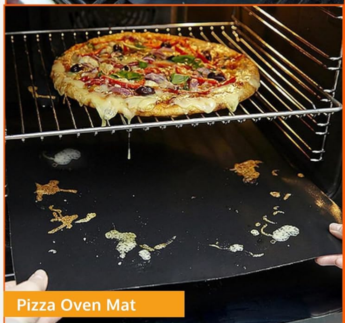
Pizza Oven Mat

Image: A compilation of images demonstrating the versatility of the oven liners, showing their use in a conventional oven, on a BBQ grill, as a baking tray liner, and within an air fryer.