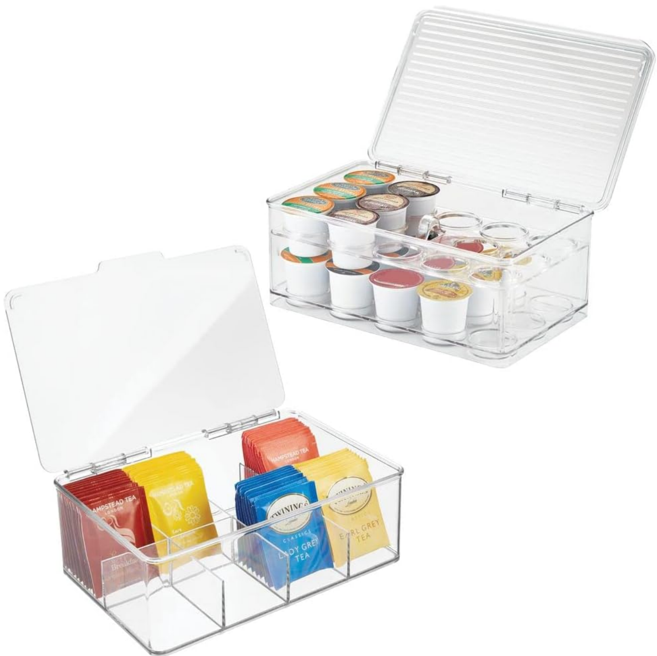
Image: The mDesign Stackable Divided Storage Organizer set, featuring both the coffee pod and tea bag organizers. The coffee pod organizer is shown with various coffee pods, and the tea bag organizer is filled with different tea bags, demonstrating their clear design and organizational capabilities.