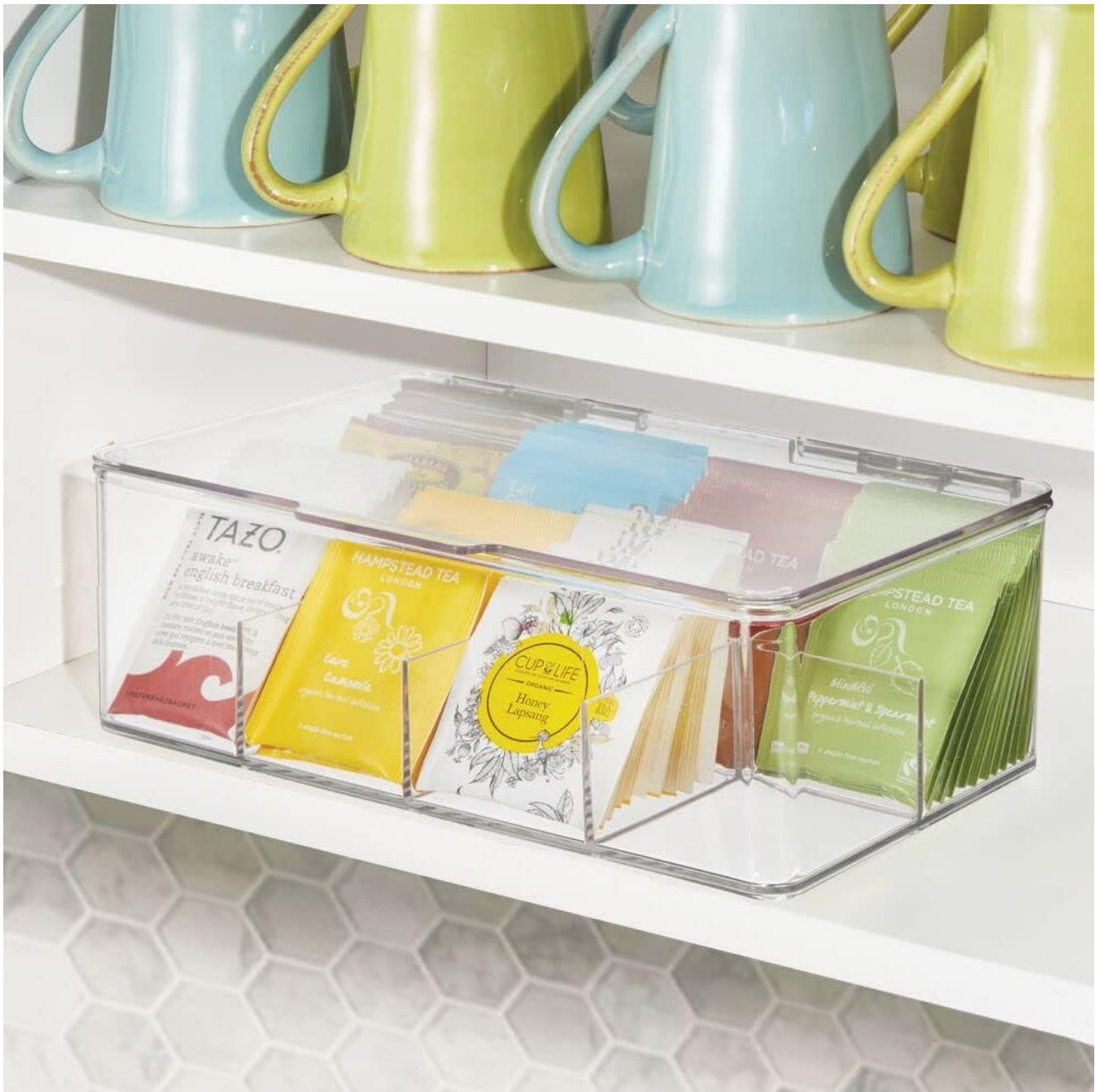
Image: The tea bag organizer, neatly arranged with various brands of tea bags, is shown on a kitchen shelf, demonstrating its effectiveness in organizing tea collections.