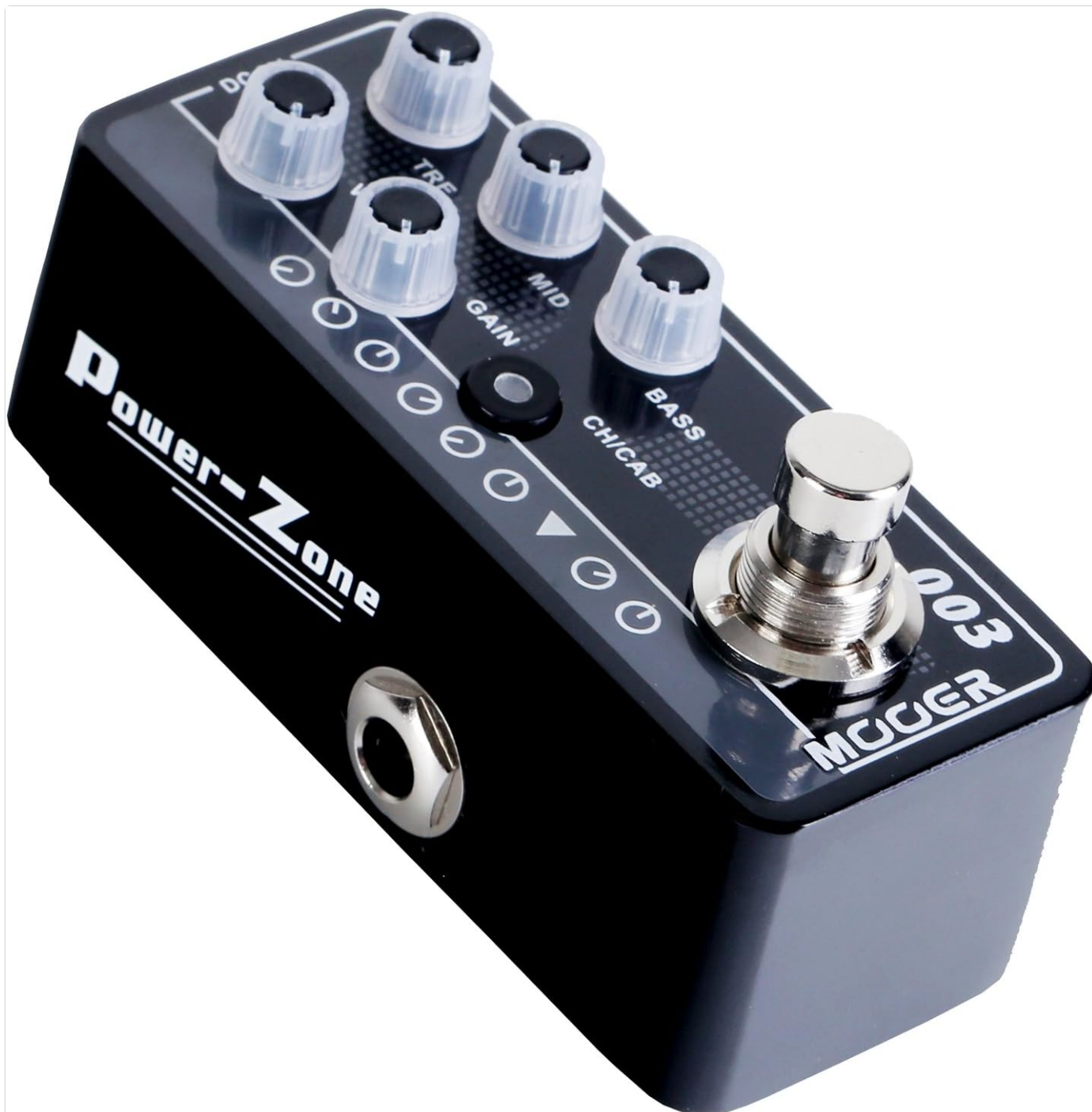
Figure 2: Angled view of the MOOER Power-Zone Micro Preamp (M003). This perspective highlights the 'Power-Zone' branding on the side and the 6.35mm input jack.