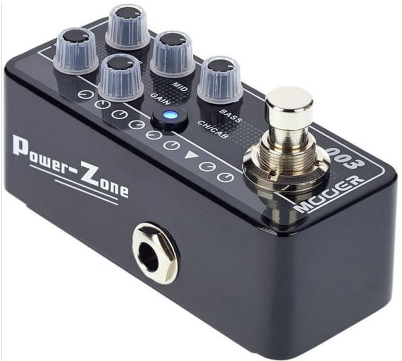
Figure 4: Angled view of the MOOER Power-Zone Micro Preamp (M003) with the blue LED illuminated, indicating the pedal is active or a specific channel is selected.