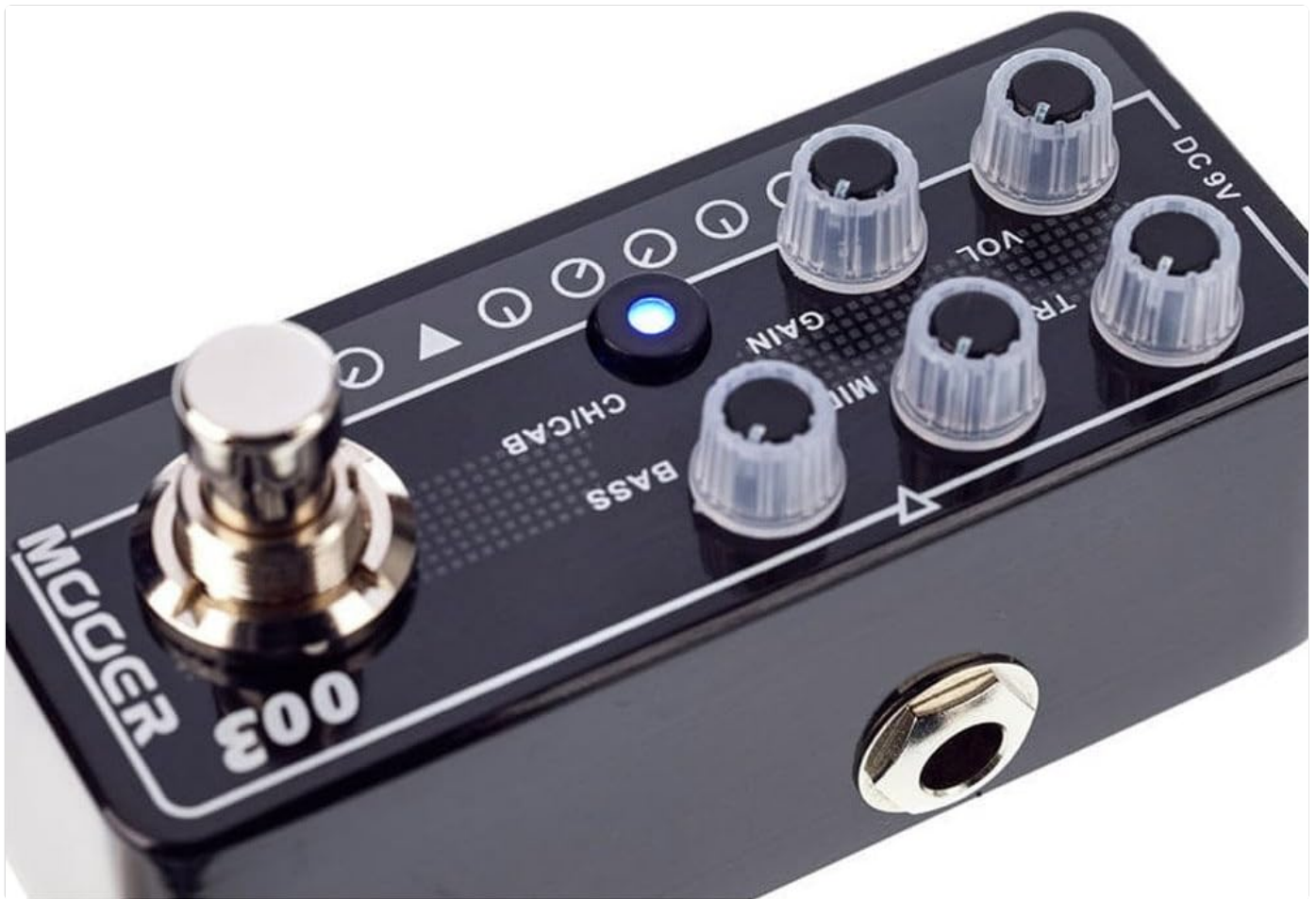
Figure 5: Close-up view of the MOOER Power-Zone Micro Preamp (M003) controls. This image provides a clear view of the VOL, TRE, MID, GAIN, and BASS knobs, the CH/CAB button, and the illuminated blue LED.