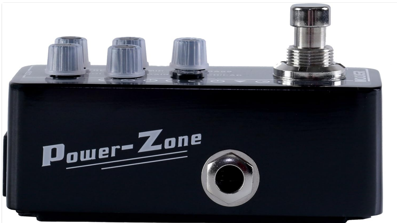
Figure 3: Side view of the MOOER Power-Zone Micro Preamp (M003). This image shows the 6.35mm input and output jacks on the sides of the pedal, essential for connecting the instrument and amplifier.