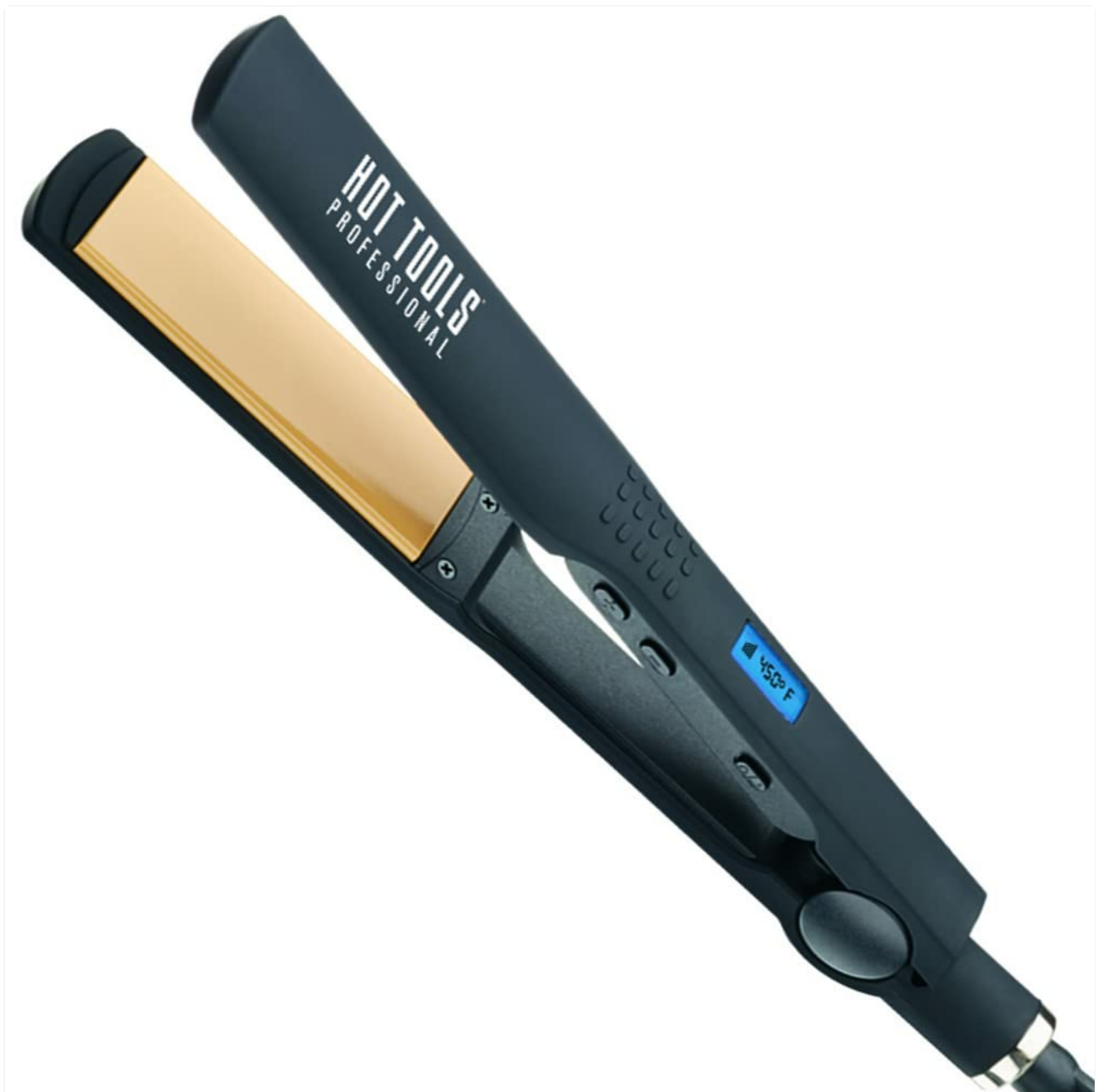
Figure 2.1: The Hot Tools Pro Artist Nano Ceramic Flat Iron with its digital display.