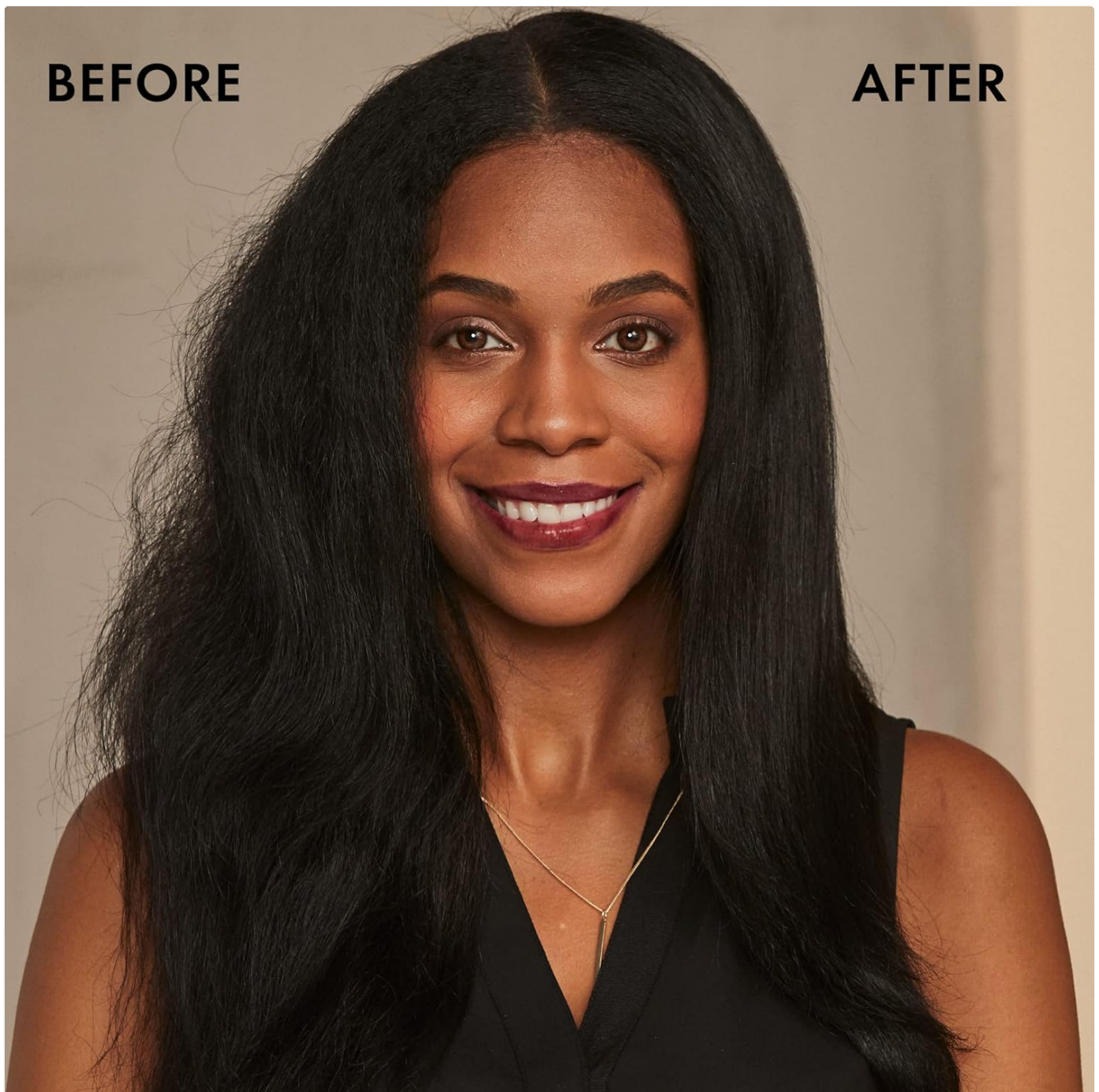
Figure 4.1: Example of hair before and after straightening with the flat iron.