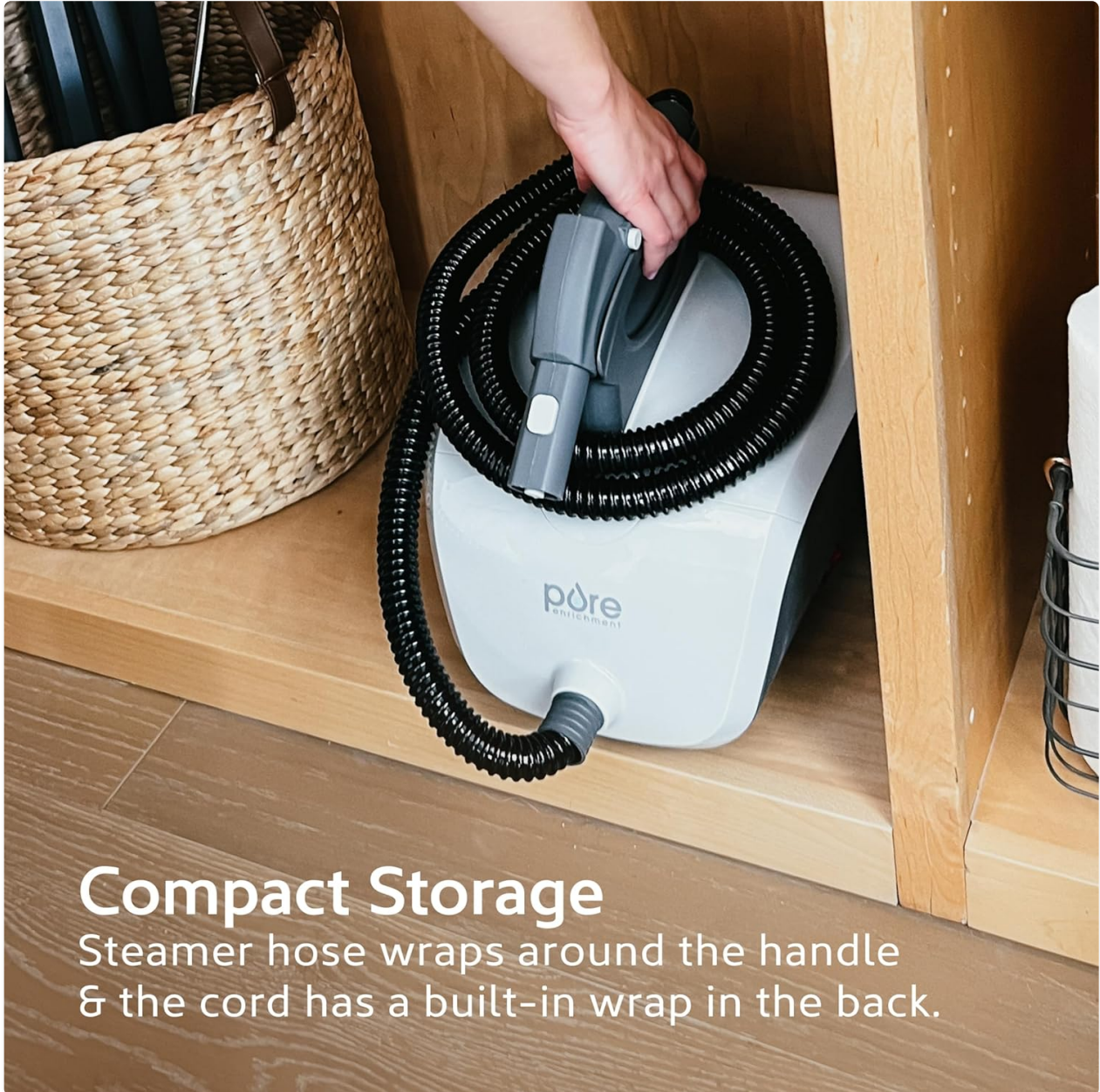
Image: The PureClean XL Rolling Steam Cleaner stored with its hose wrapped around the handle, demonstrating its compact design.