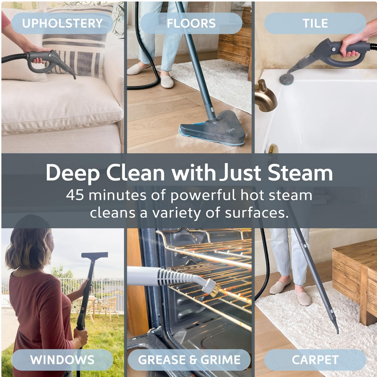
Image: A collage showing the steam cleaner effectively cleaning upholstery, floors, tile, windows, grease on a stovetop, and carpet.

Video: Official product video demonstrating the PureClean XL Rolling Steam Cleaner in use for various cleaning tasks around the home.