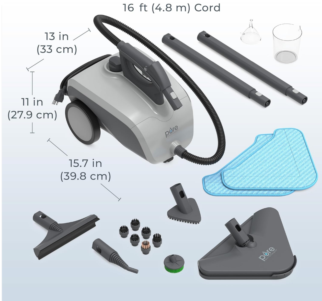
Image: A visual representation of the PureClean XL Rolling Steam Cleaner and all its included accessories, laid out on a wooden floor.