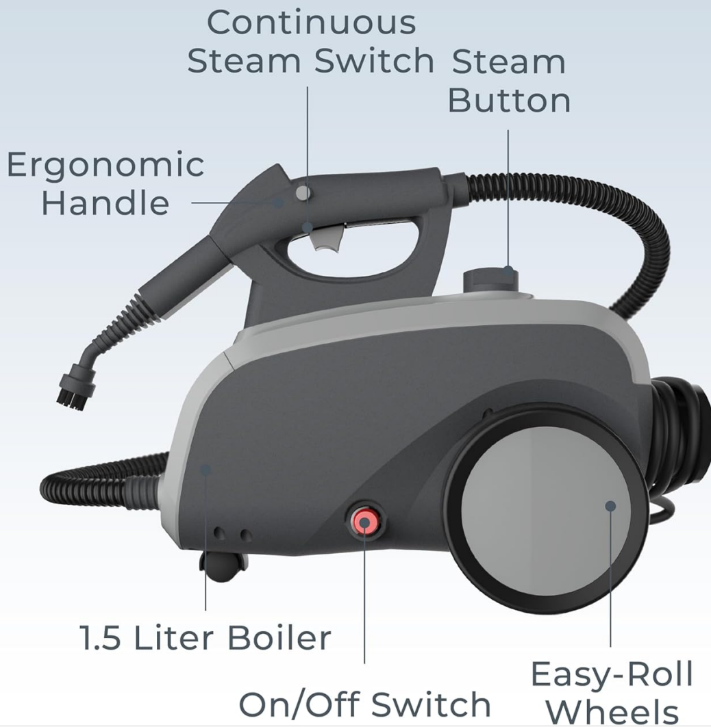
Image: A diagram highlighting key components and controls of the steam cleaner, including the ergonomic handle, continuous steam switch, steam button, 1.5-liter boiler, on/off switch, and easy-roll wheels.