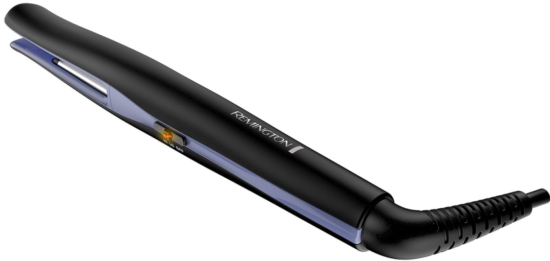
Image: The Remington CI41T1 Professional 2-in-1 Plate Guided Hair Curler & Touch Up Straightener, showcasing its sleek black and purple design.