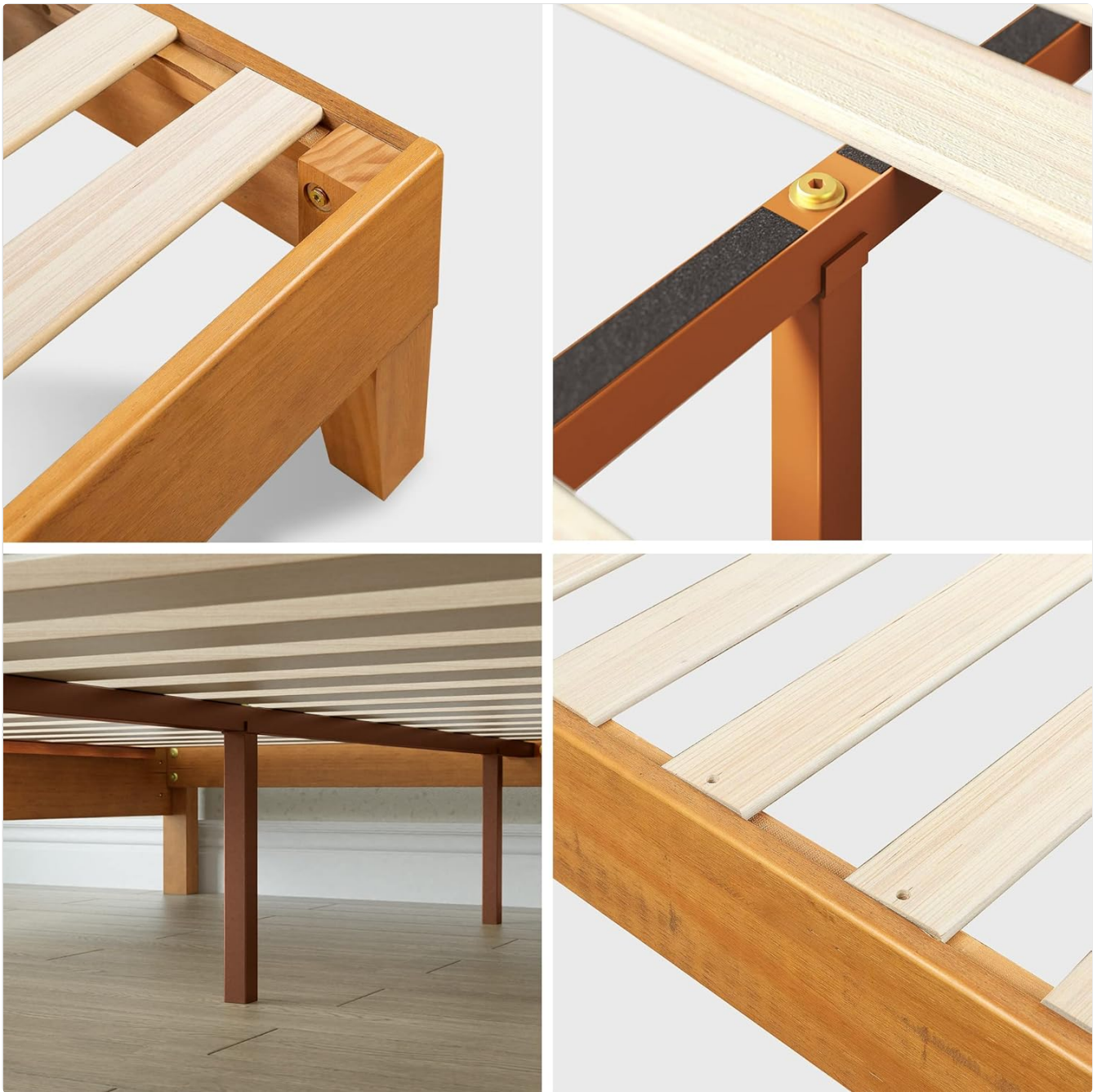
A view of the underside construction, showing the sturdy corner joints, steel reinforcement, and wooden slats.