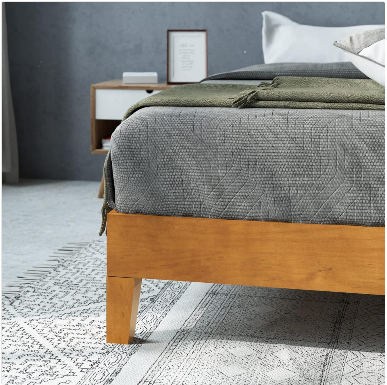
The Zinus Alexis Deluxe Wood Platform Bed Frame shown with a mattress in place, highlighting its low-profile design and sturdy appearance.