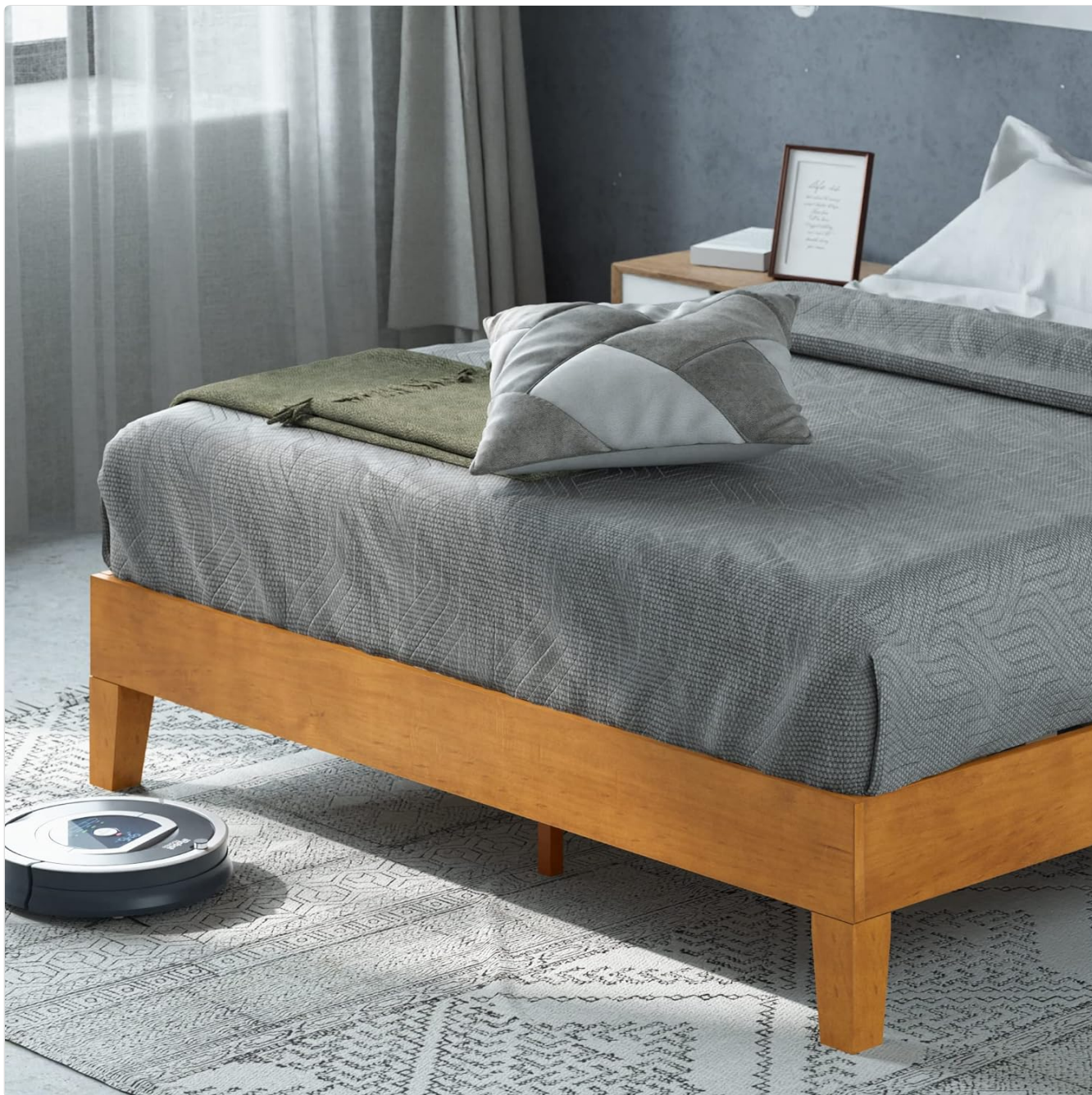
A side view of the bed frame with a mattress, illustrating the height and under-bed clearance.