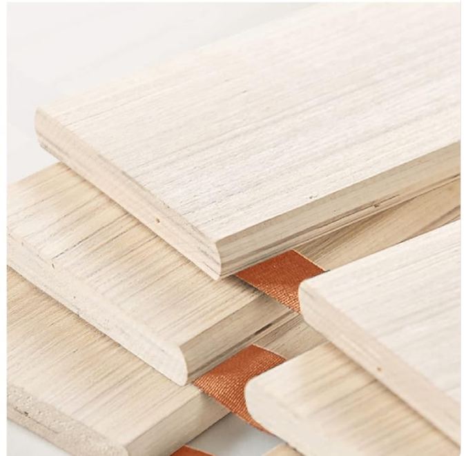
Detailed view of the bed frame's features, including the non-slip tape on slats, foam padding on the steel frame, and the rustic wood texture.