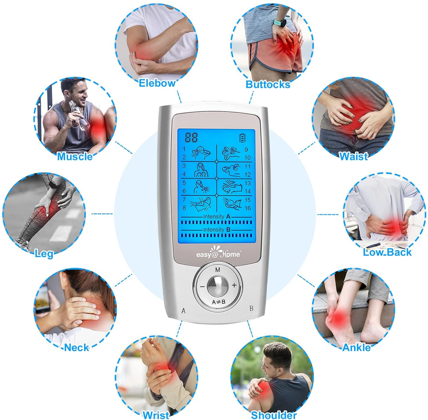
Image: Visual guide illustrating recommended placement areas for electrode pads on different body parts, including elbow, buttocks, waist, low back, ankle, shoulder, wrist, neck, and muscle areas.