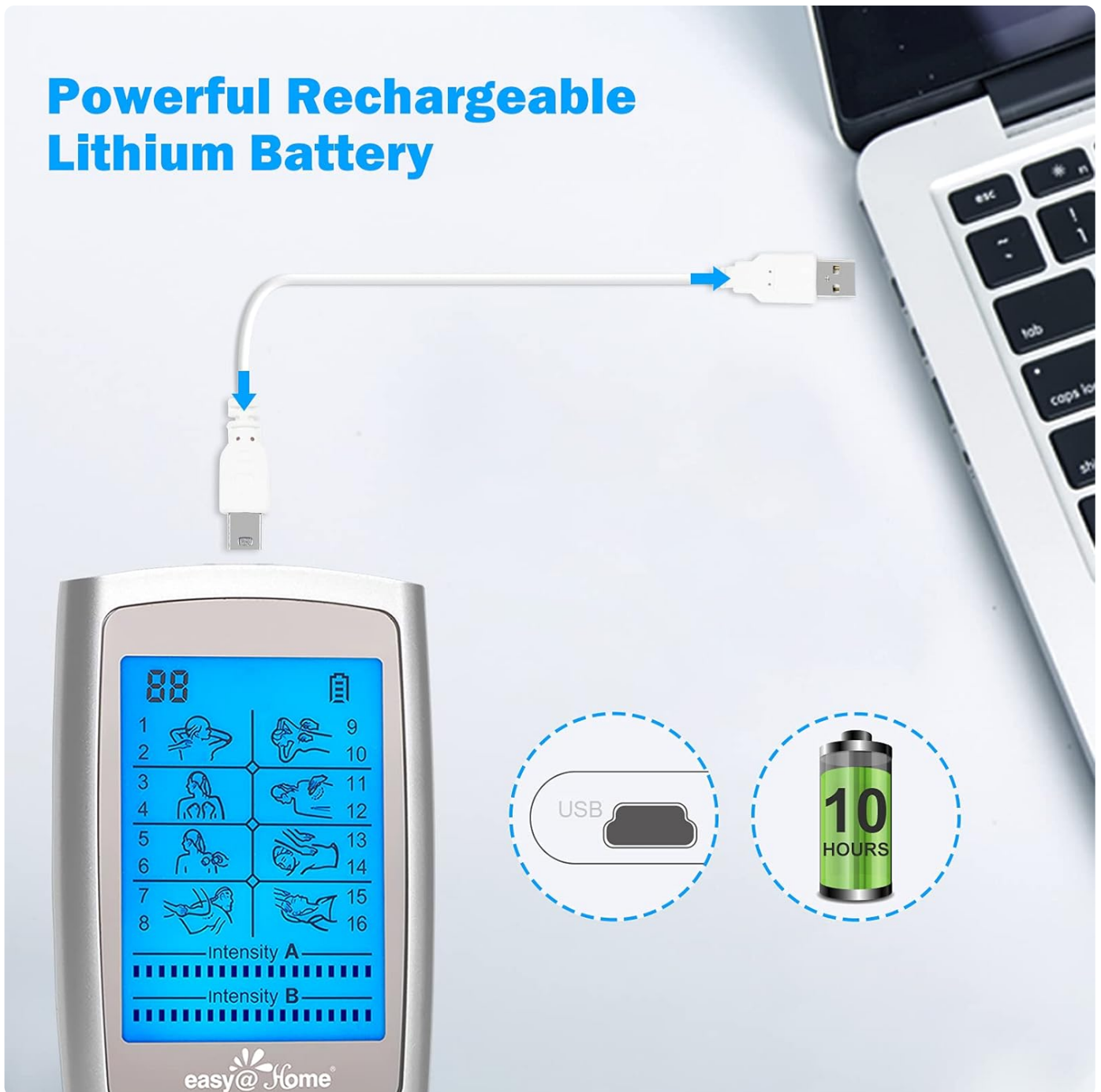
Image: The Easy@Home TENS Unit being charged via a USB cable connected to a laptop, illustrating the charging process.