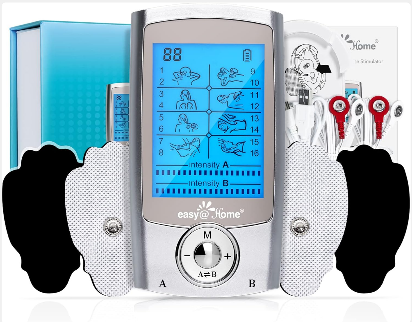
Image: Easy@Home TENS Unit and EMS Muscle Stimulator, showing the device, electrode pads, and accessories.

Your comprehensive guide to effective pain relief and muscle stimulation.