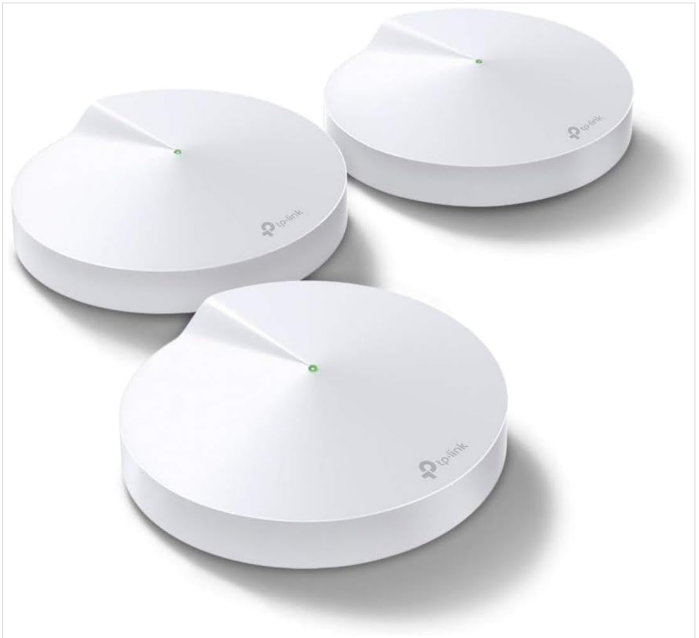
Image: Three white, circular TP-Link Deco M5 units with a green LED light on top, arranged on a wooden surface.