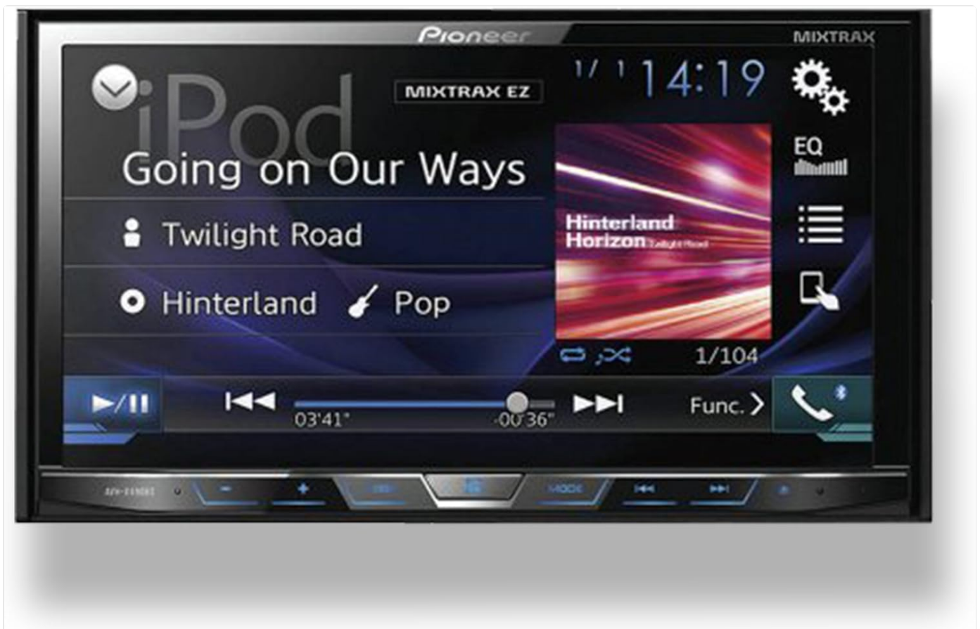
Figure 4.7.1: Mixtrax Interface. This image illustrates the Mixtrax feature on the AVH-X490BS display, showing song information, album art, and playback controls within the Mixtrax EZ mode. This mode blends songs together with DJ-style transitions.

Mixtrax technology creates a non-stop mix of your music library with DJ-style effects and transitions. Activate Mixtrax from the audio settings menu.