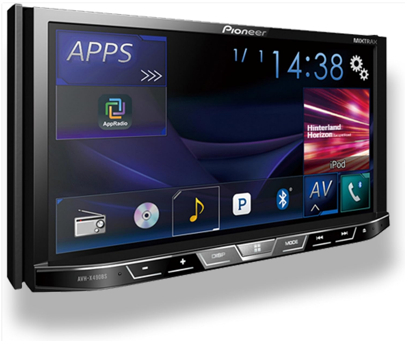
Figure 4.0.1: Main Display Interface. This image shows the front display of the Pioneer AVH-X490BS, illustrating the main menu with icons for various functions like Apps, Audio/Video, and Phone, along with the current time and Mixtrax logo. This is the primary interface for user interaction.