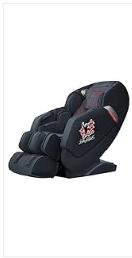
Figure 7.2: Illustration of the airbag system providing simulated finger massage.