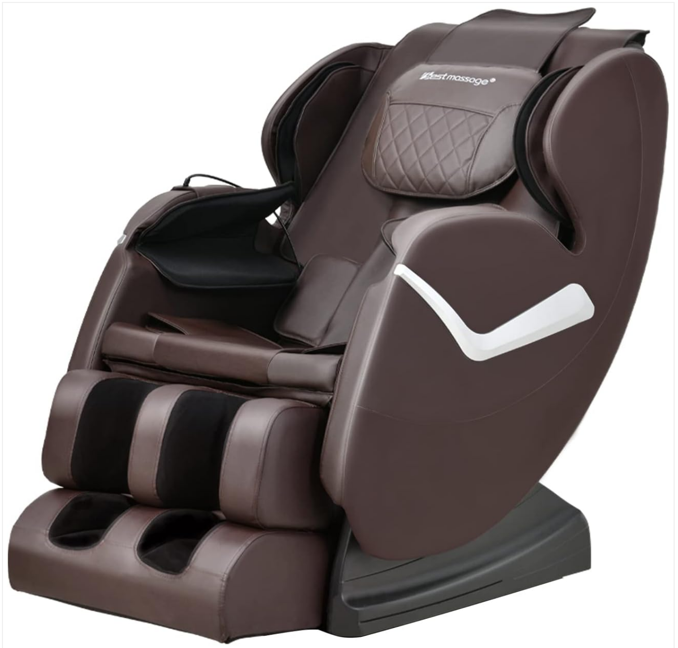
Figure 4.1: Assembled BestMassage Zero Gravity Full Body Electric Shiatsu Massage Chair.

Assembly is required for this massage chair. It is recommended to have two people for assembly due to the size and weight of the components. Follow the detailed instructions provided in the separate assembly guide included with your purchase. Ensure all connections are secure before powering on the chair.