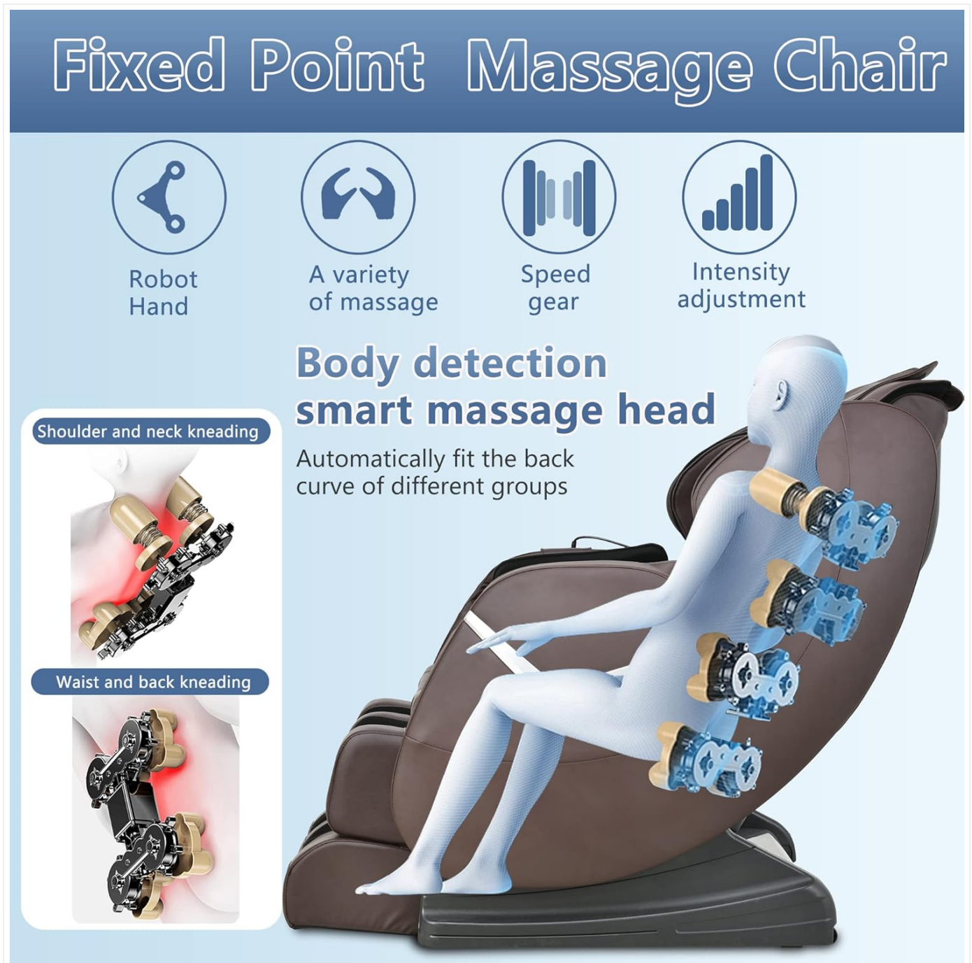
Figure 6.2: The Zero Gravity position, designed for optimal relaxation and spinal decompression.

Press the "Zero-G" button on the remote. The chair will recline, elevating your feet above your heart, which helps to minimize the stress of gravity on your vertebrae and promote relaxation.