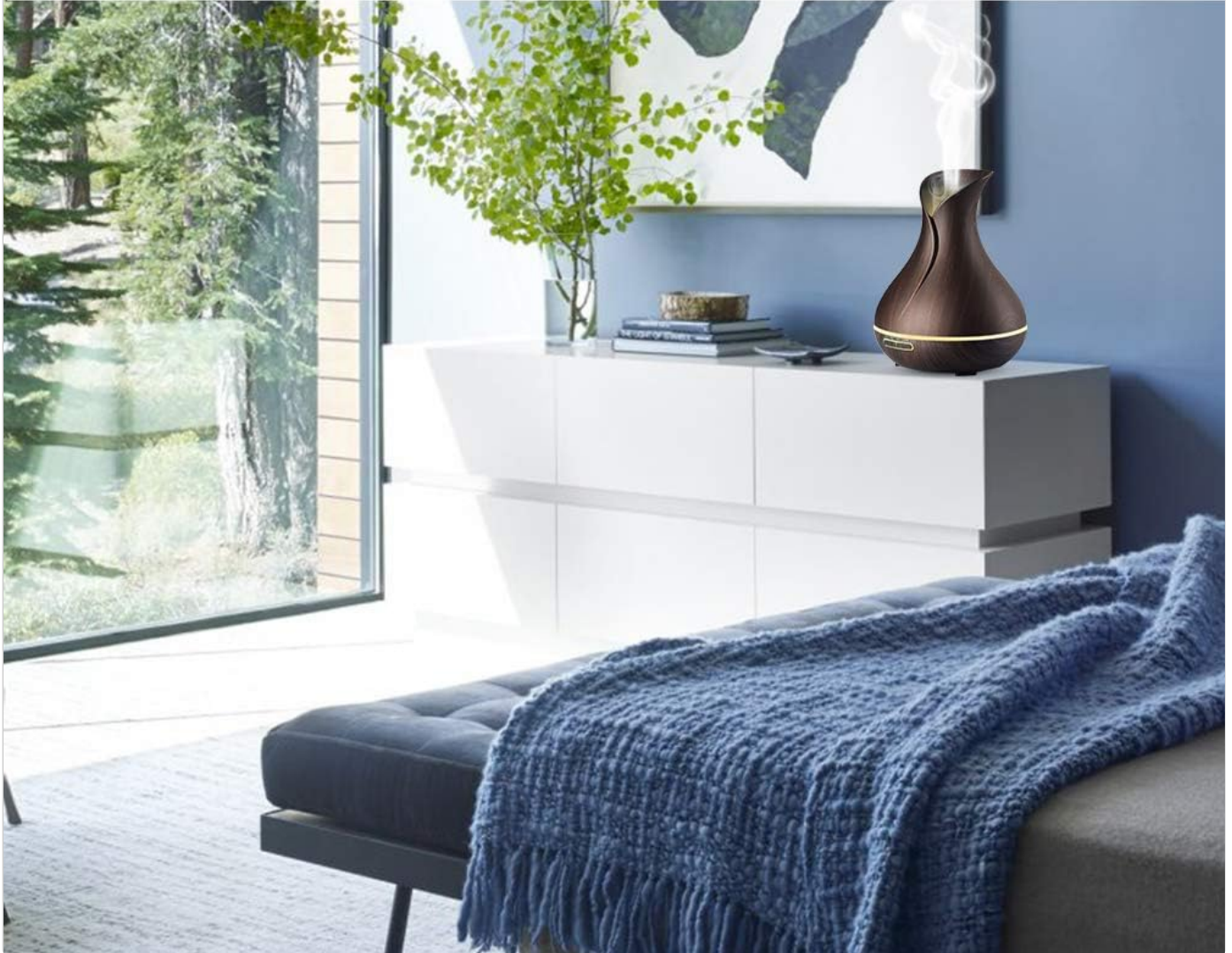
Figure 3: Warm Night Light Feature. The diffuser is shown in a bedroom, emitting a gentle mist and glowing with a warm night light, demonstrating its ambient lighting capability.

Press "Light" button to turn on the light. The light is adjustable between bright and dim.