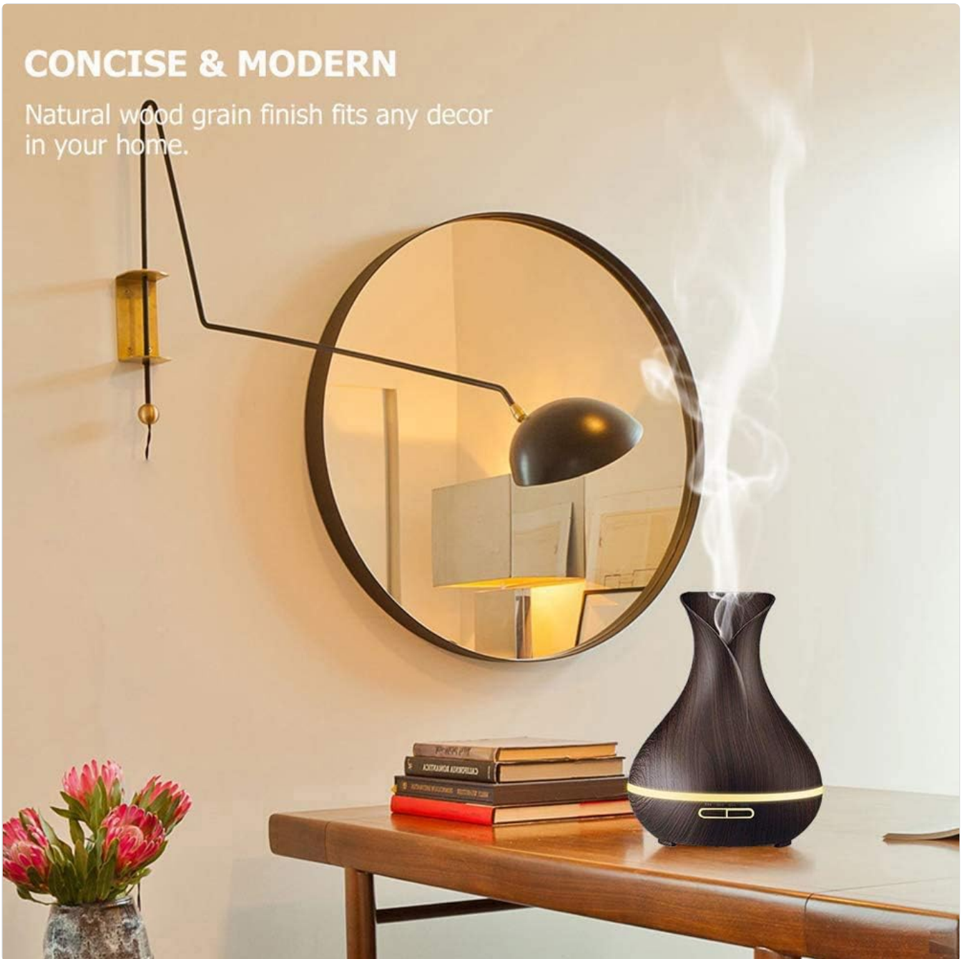
Figure 5: Modern Design. The diffuser is displayed in a home setting, showcasing its concise and modern wood grain finish that complements various decor styles.

Natural wood grain finish fits any decor in your home.