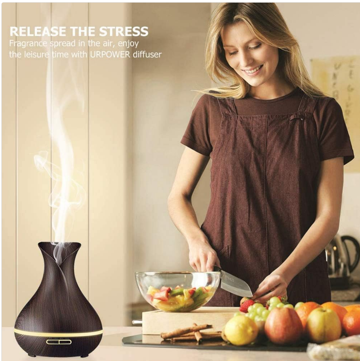
Figure 4: Fragrance Dispersion. This image shows the diffuser in a kitchen, effectively spreading fragrance, illustrating its function in enhancing the atmosphere during daily activities.

Fragrance spread in the air, enjoy the leisure time with URPOWER diffuser