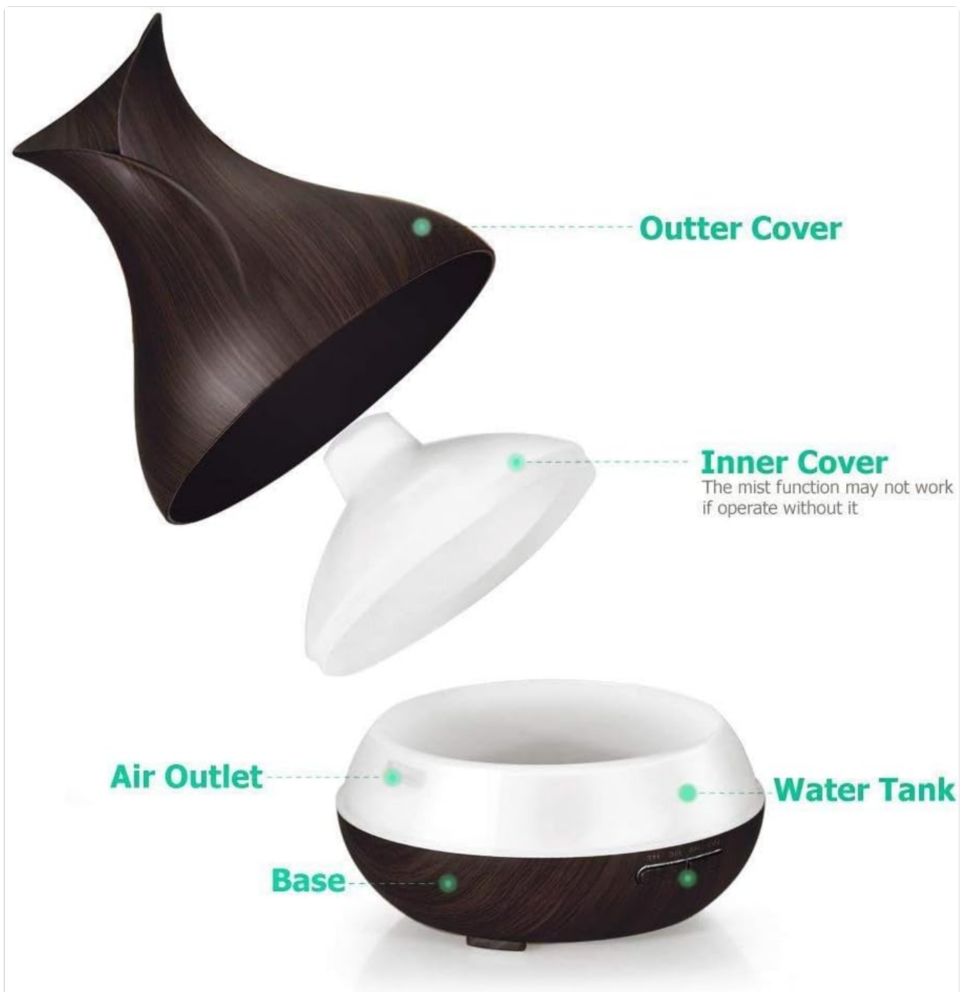
Figure 1: Diffuser Components. This image illustrates the main components of the URPOWER Essential Oil Diffuser, including the outer cover, inner cover, air outlet, water tank, and base, providing a clear visual guide for assembly and disassembly.