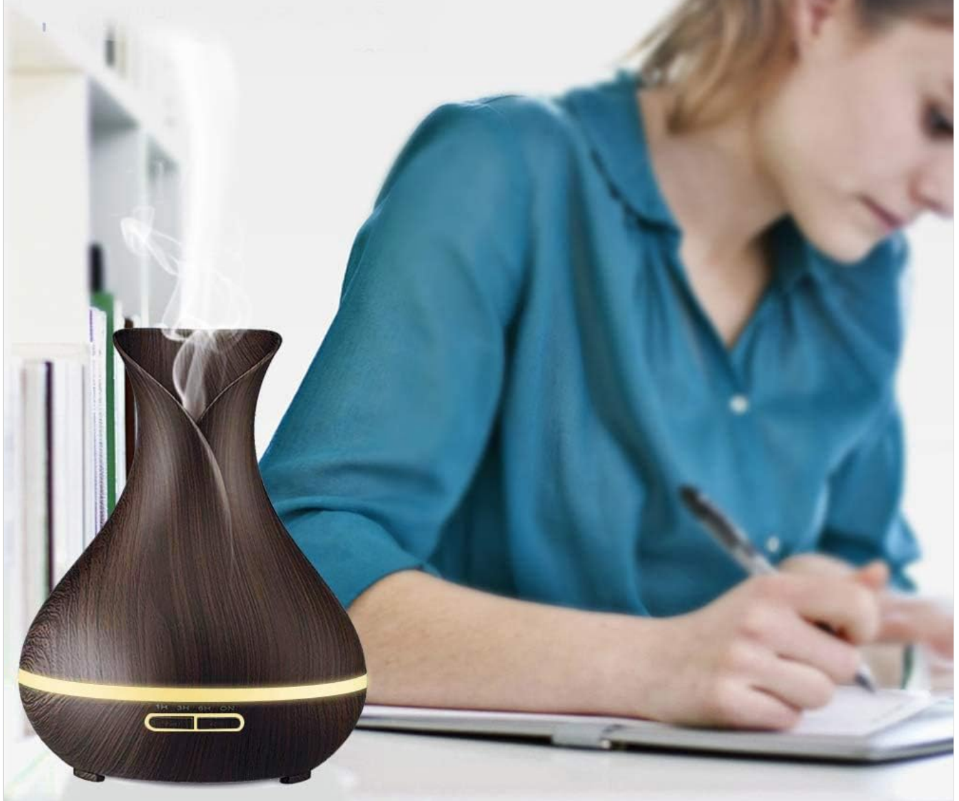
Figure 6: Whisper-Quiet Operation. The diffuser is shown in a study environment, emphasizing its quiet ultrasonic technology, suitable for use while working, studying, or sleeping.

Adopted ultrasonic technology, this diffuser is extremely quiet when working, studying, sleeping.