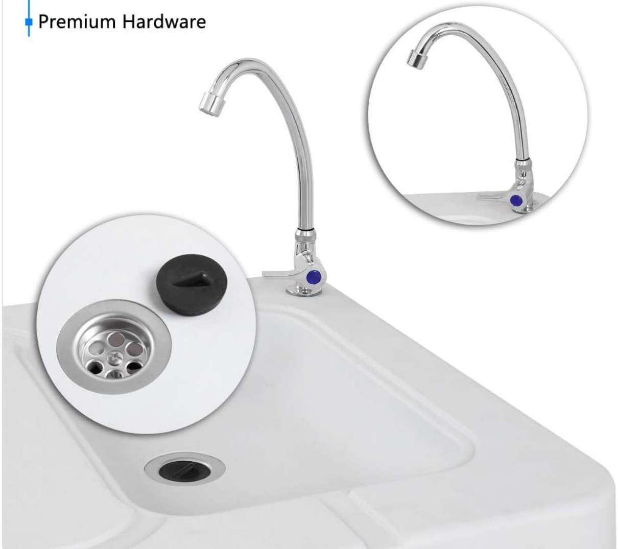
Image: The integrated sink with the faucet and drain assembly, including the stopper, ready for water connection.