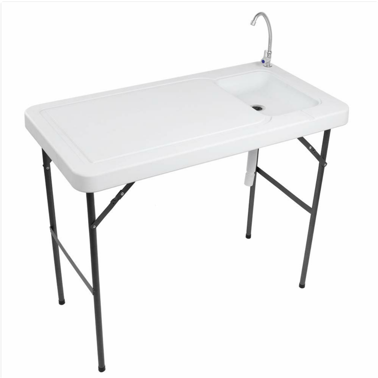
Image: The VINGLI cleaning table fully assembled, displaying its dimensions and the integrated sink with faucet.