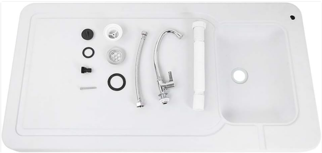
Image: All components of the VINGLI cleaning table laid out, including the tabletop with integrated sink, faucet, drain assembly, and various connectors and seals.