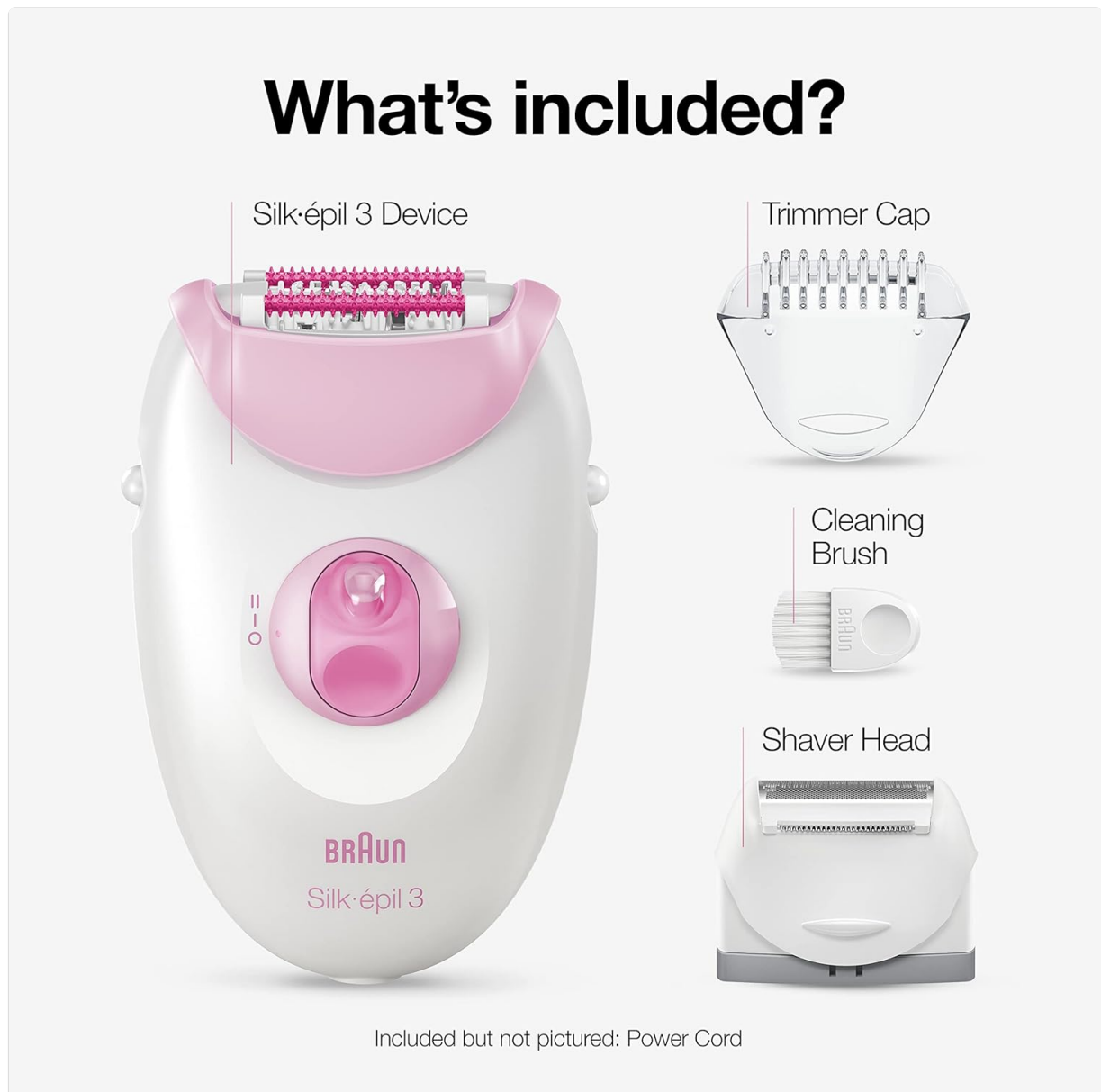
Image: A visual representation of the Braun Silk-épil 3 device and its included accessories: the epilator unit, trimmer cap, cleaning brush, and shaver head. The power cord is also included but not shown in this diagram.