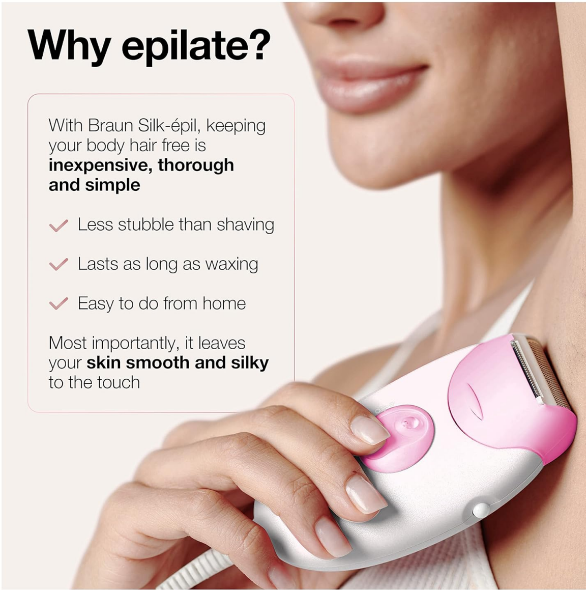
Image: A woman demonstrating the use of the Braun Silk-épil epilator on her leg, highlighting the ease of use for at-home hair removal.

Most importantly, it leaves your skin smooth and silky to the touch