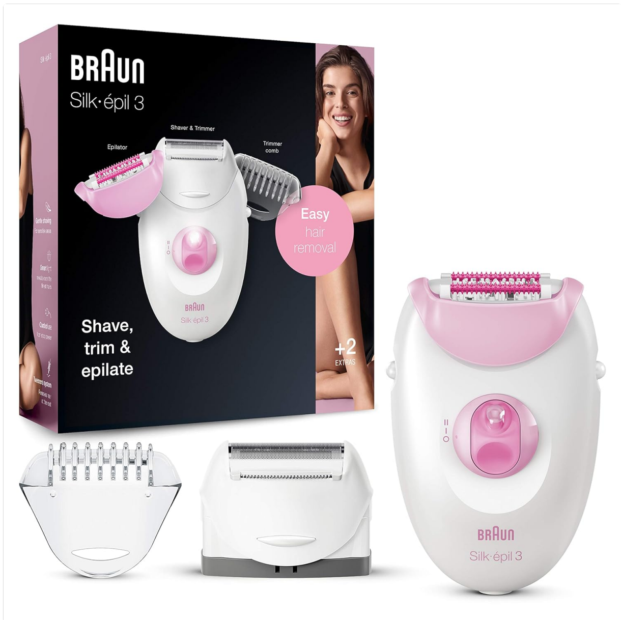
Image: The Braun Silk-épil 3-270 epilator, its packaging, and included accessories: epilator head, shaver head, and trimmer comb.