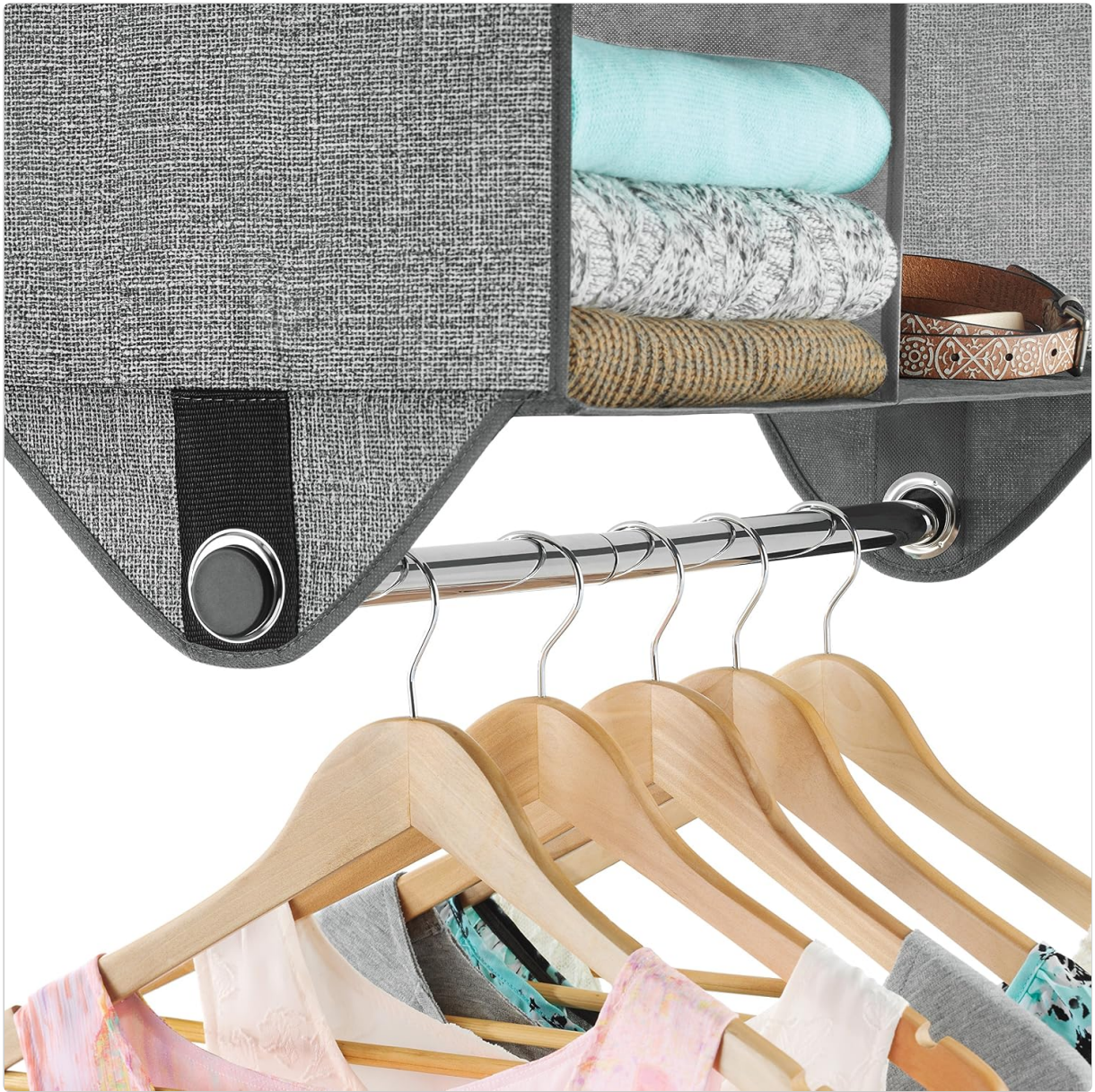
Figure 2: Detail of the organizer's hooks securely placed on a closet rod.

This image shows a close-up of the metal hooks at the top of the fabric organizer, demonstrating how they attach to a standard closet rod for secure hanging.