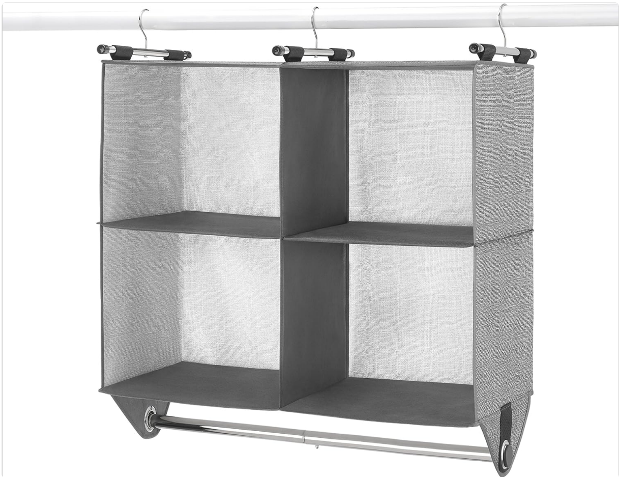
Figure 1: Overview of the Whitmor 4-Section Fabric Closet Organizer.

This image displays the complete 4-section fabric closet organizer, showcasing its four cubbies and the chrome garment rod at the bottom. It is designed to hang from a standard closet rod.