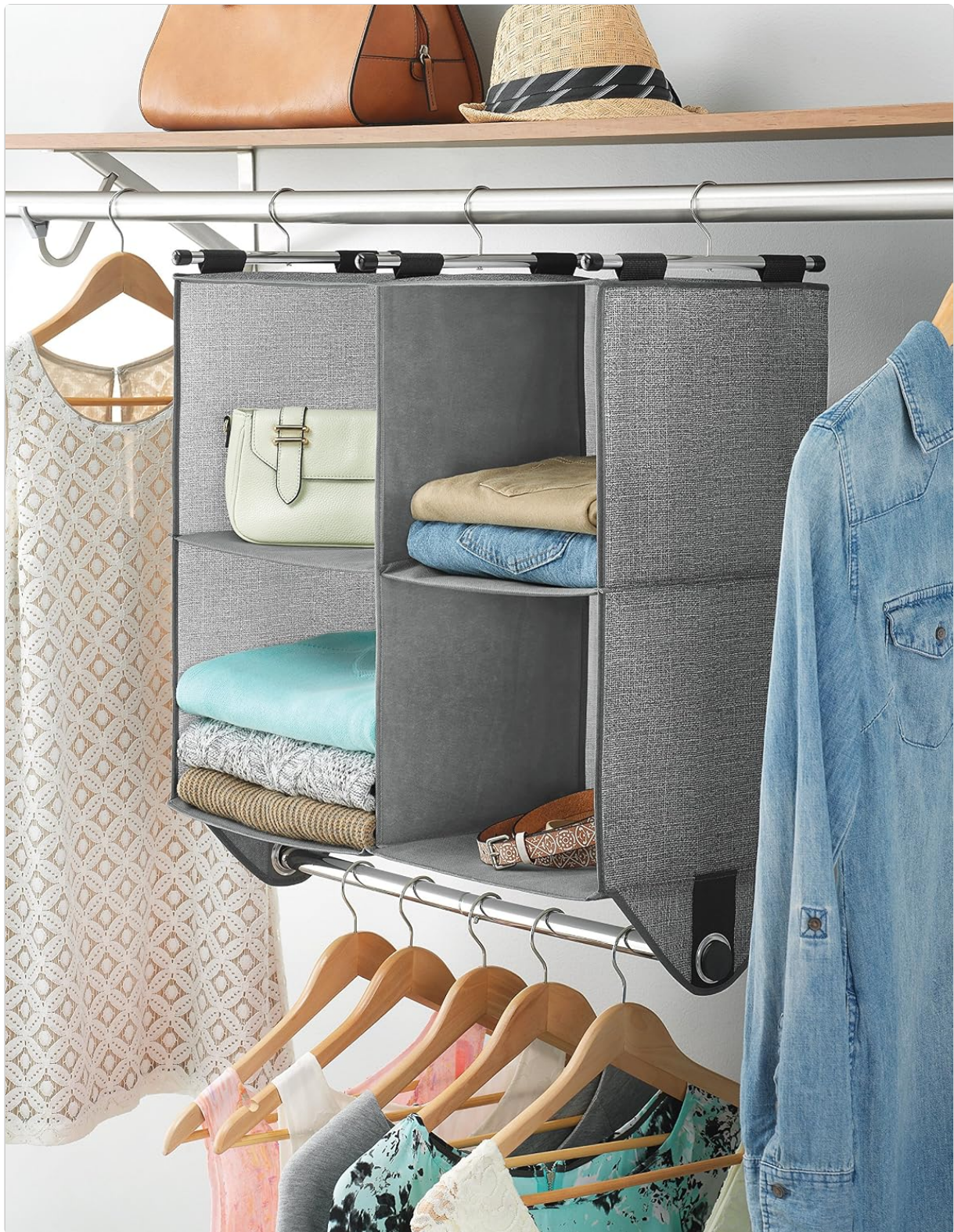
Figure 4: The organizer filled with folded clothes and accessories, demonstrating its storage capacity.

This image illustrates the fabric closet organizer in an active closet setting, holding folded garments, a handbag, and other accessories within its cubbies, while the bottom rod holds hanging clothes.