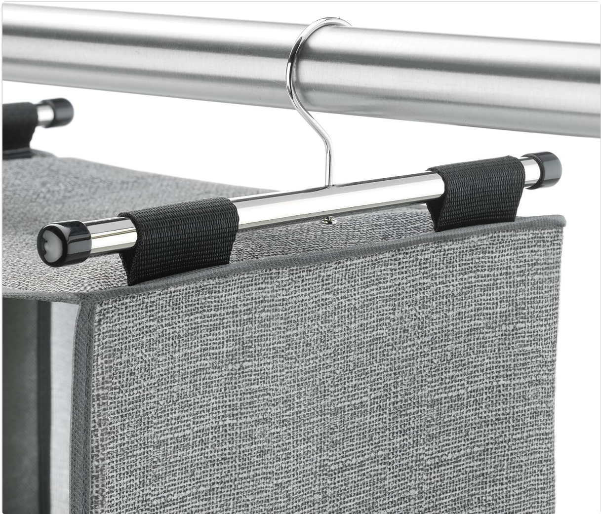
Figure 3: Detail of the chrome garment rod integrated into the bottom of the organizer.

This image provides a detailed view of the chrome garment rod, showing its attachment points at the bottom of the fabric organizer, ready for hanging clothes.