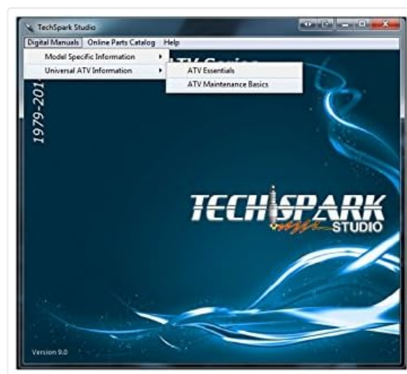
Image: A screenshot of the TechSpark Studio software's main menu, showing navigation options for model-specific and universal ATV information.