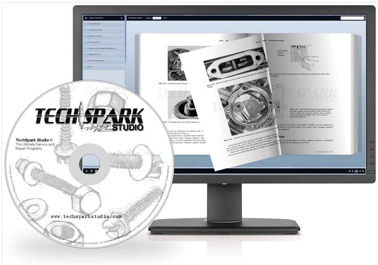
Image: The TechSpark Studio CD-ROM alongside a monitor displaying the digital manual's interface, illustrating the software's primary components.