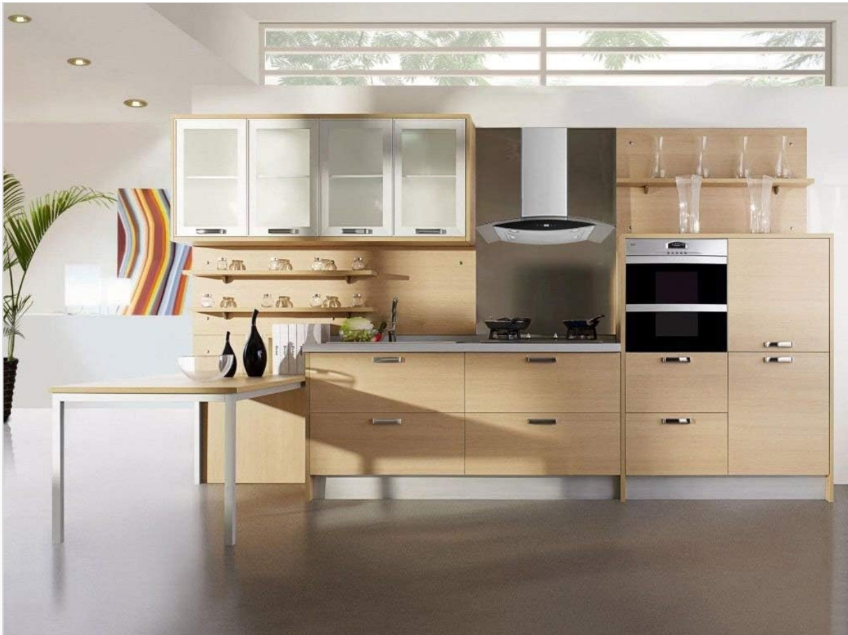
Figure 2: An example of the Winflo range hood installed in a kitchen, demonstrating its appearance and placement above a cooking area.