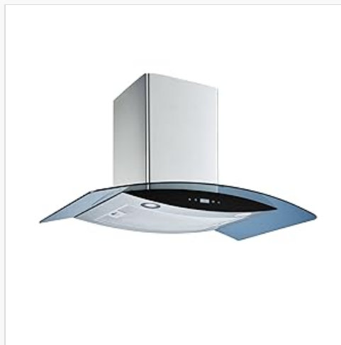
Figure 4: The aluminum mesh filter, designed for easy removal and cleaning.