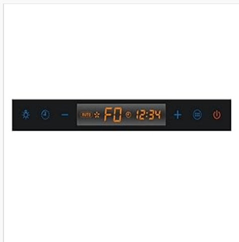
Figure 3: The touch sensor control panel, featuring buttons for fan speed, light, and a time display.