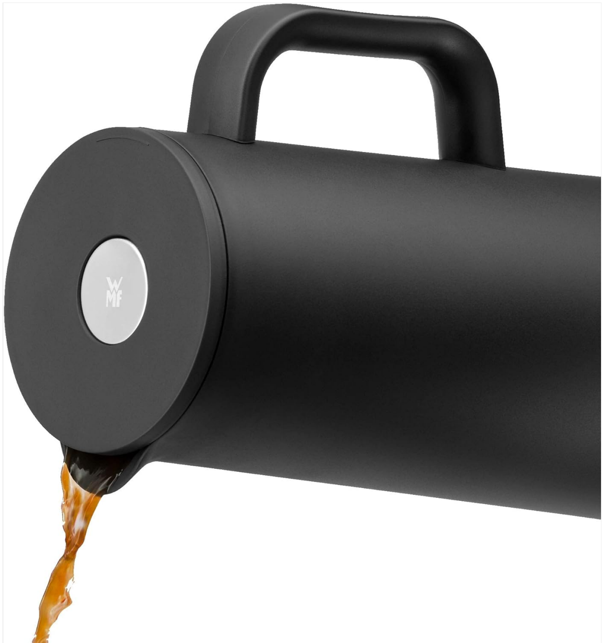
Figure 5: Pouring a beverage from the flask.