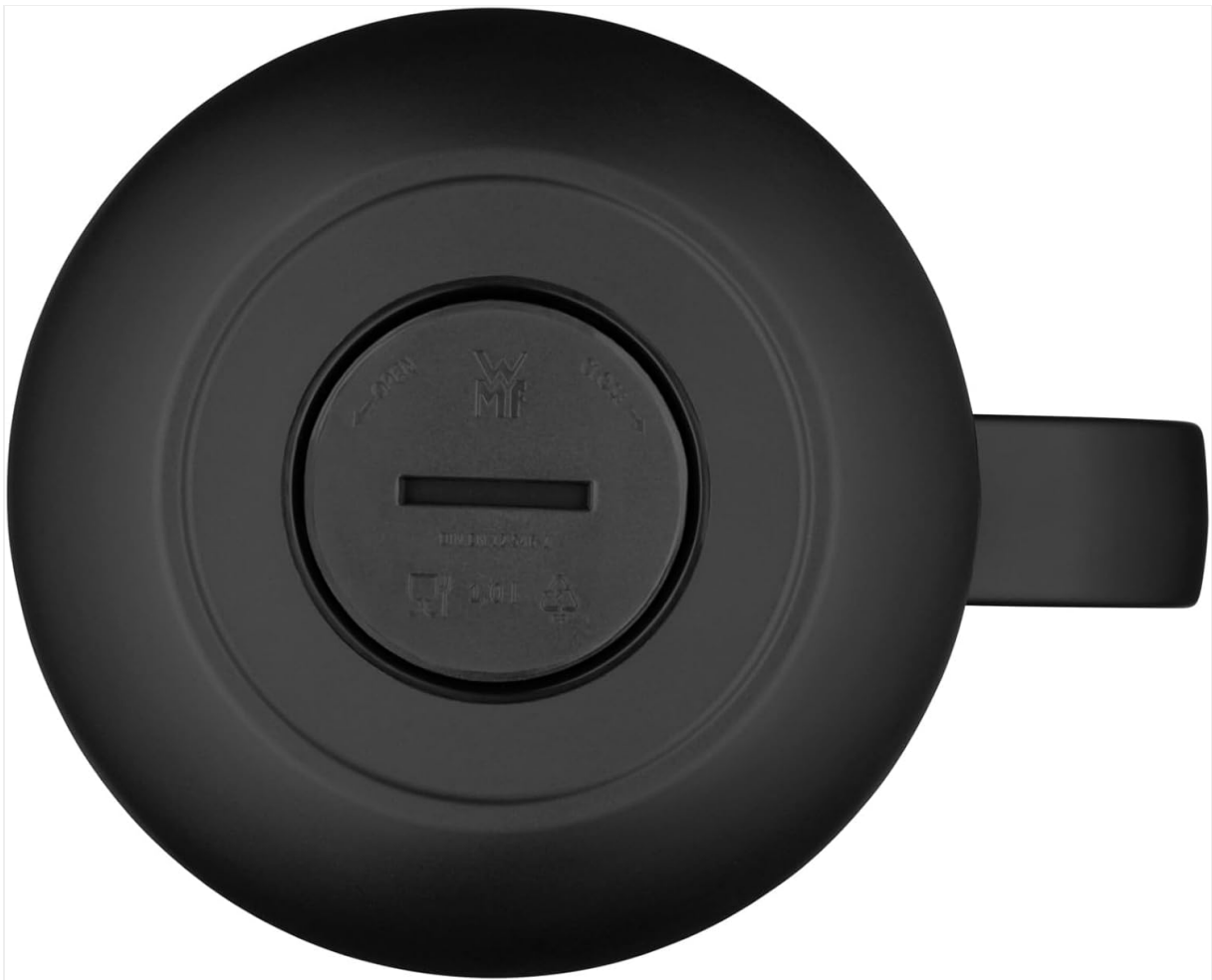
Figure 9: Bottom view of the flask with the screw mechanism.