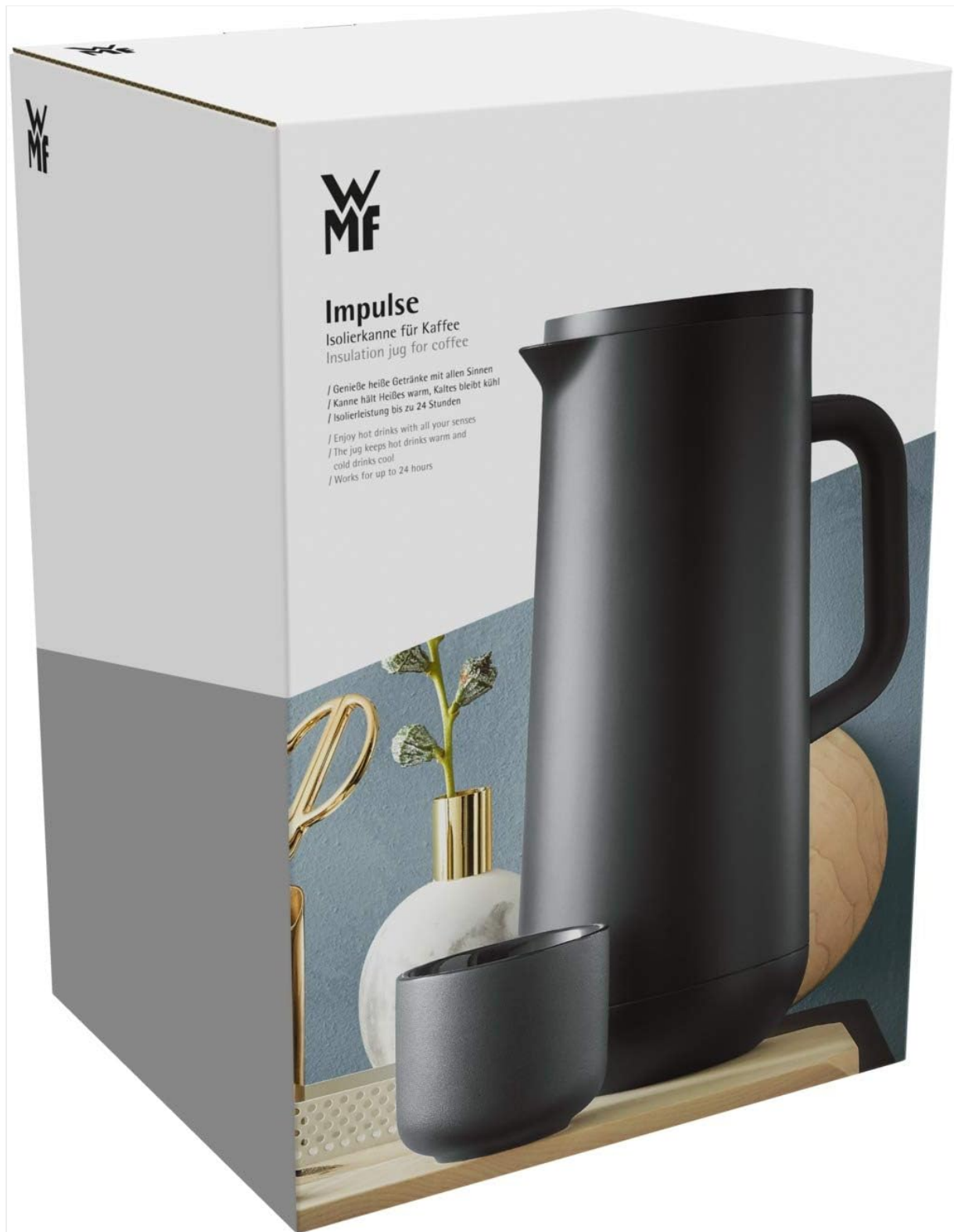
Figure 2: Product packaging.