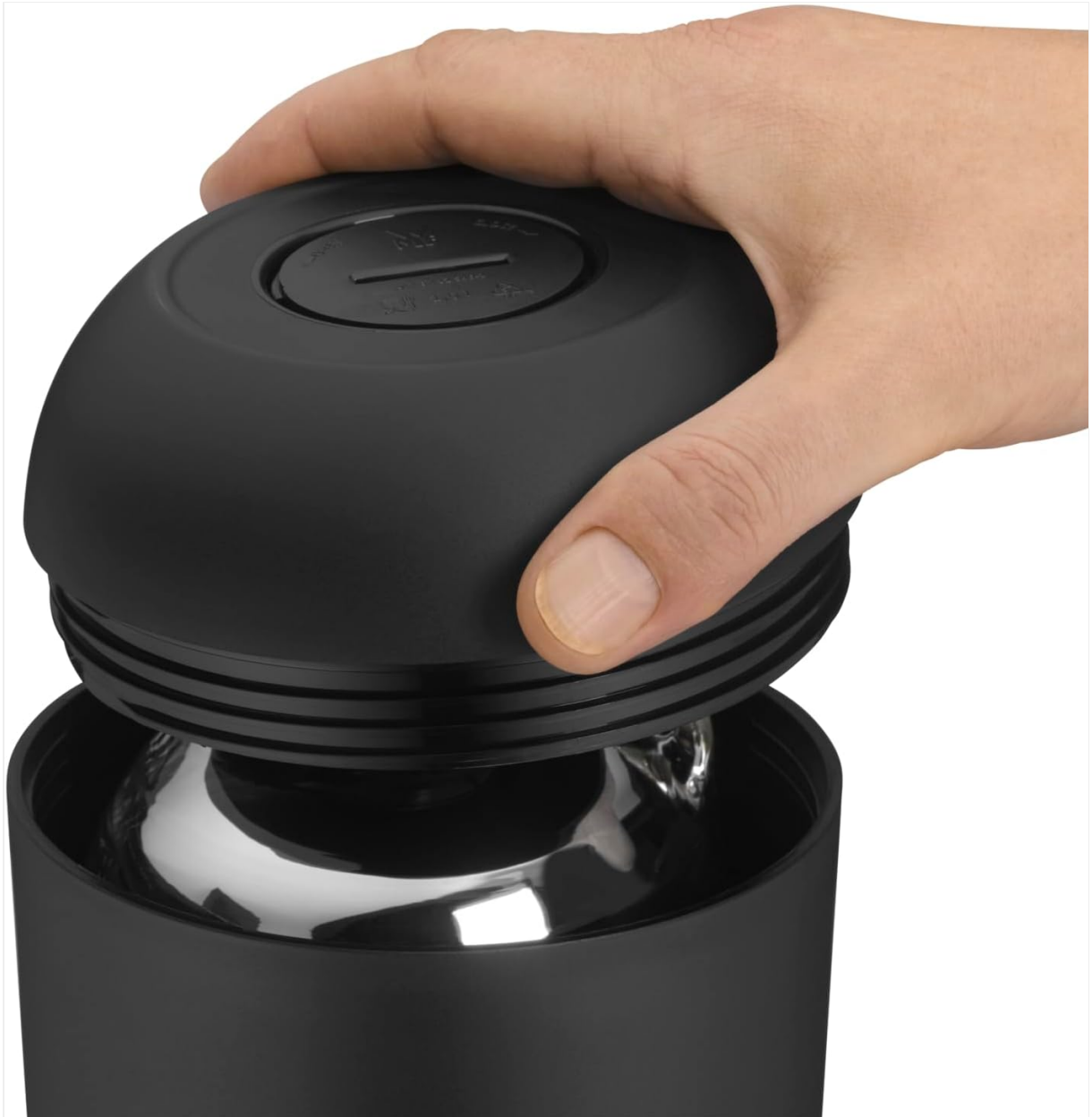
Figure 8: Accessing the glass insert by unscrewing the base.