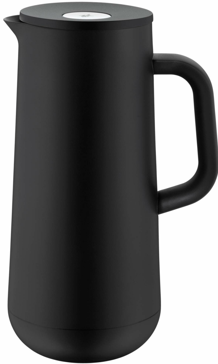
Figure 1: WMF Impulse Insulated Thermos Flask, black, 1.0 L capacity.