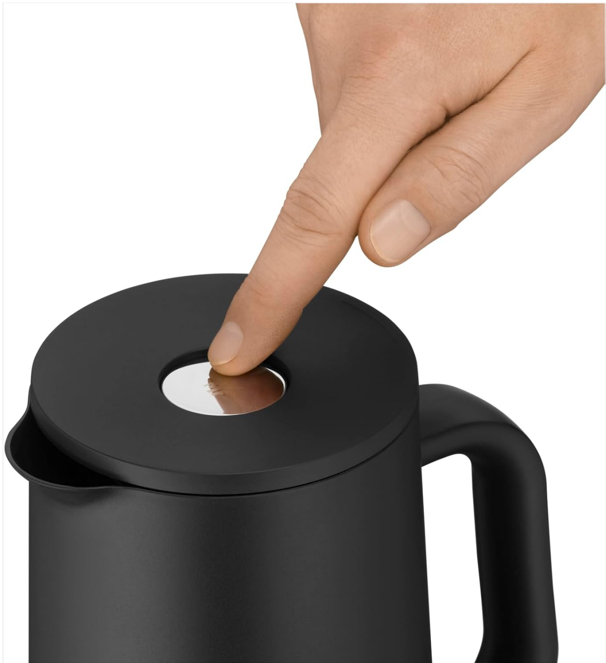
Figure 4: Activating the pressure closure by pressing the central button.