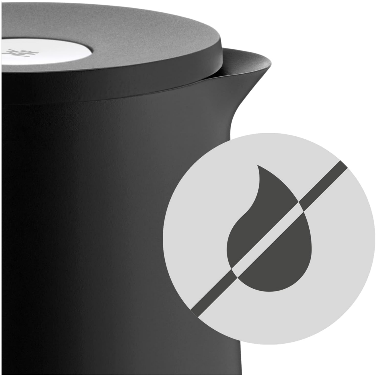
Figure 6: The flask is designed for drip-free pouring.