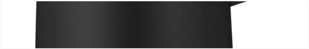
Figure 3: Removing the lid for cleaning or filling.