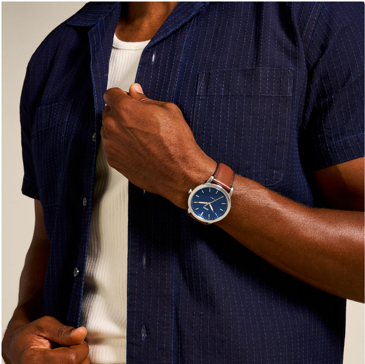
The Fossil watch worn on a wrist, demonstrating the fit of the leather strap.