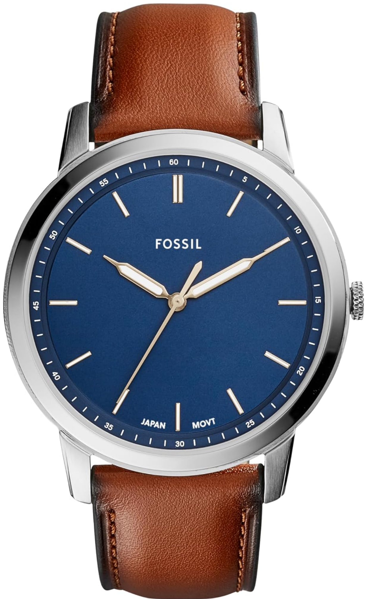
Front view of the Fossil Men's Minimalist Quartz Watch, showcasing the blue dial and brown leather strap.