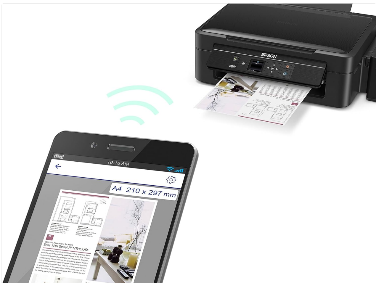
Figure 5: Demonstrating wireless printing from a smartphone to the Epson L485 printer.