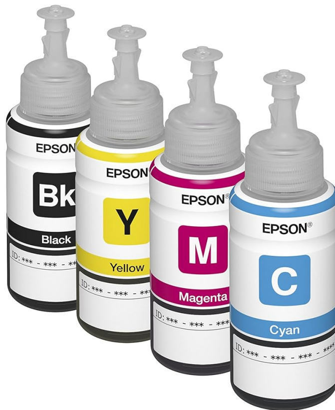
Figure 4: The four color ink bottles used for the Epson L485 printer.