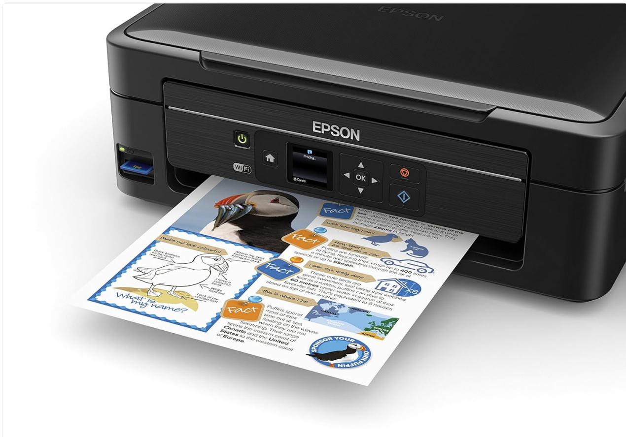
Figure 6: The Epson L485 printer in action, producing a vibrant print.