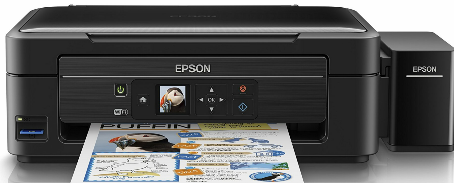
Figure 1: Front view of the Epson L485 Wi-Fi InkTank Printer.