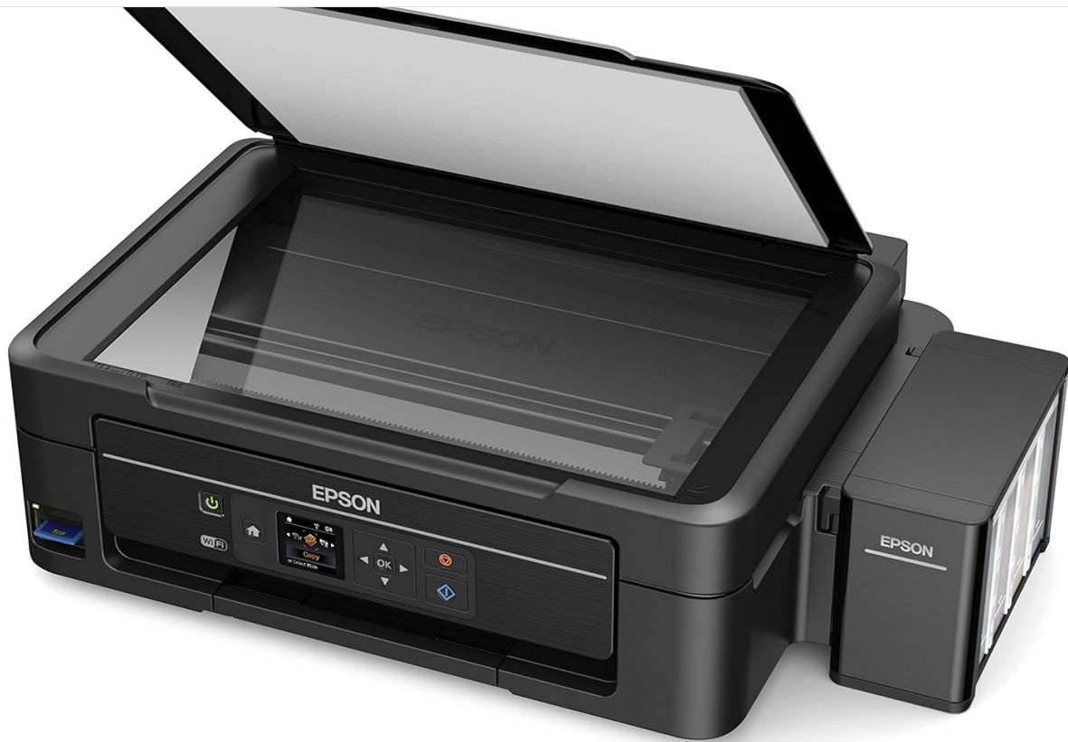
Figure 7: The scanner bed of the Epson L485 printer with the lid open.