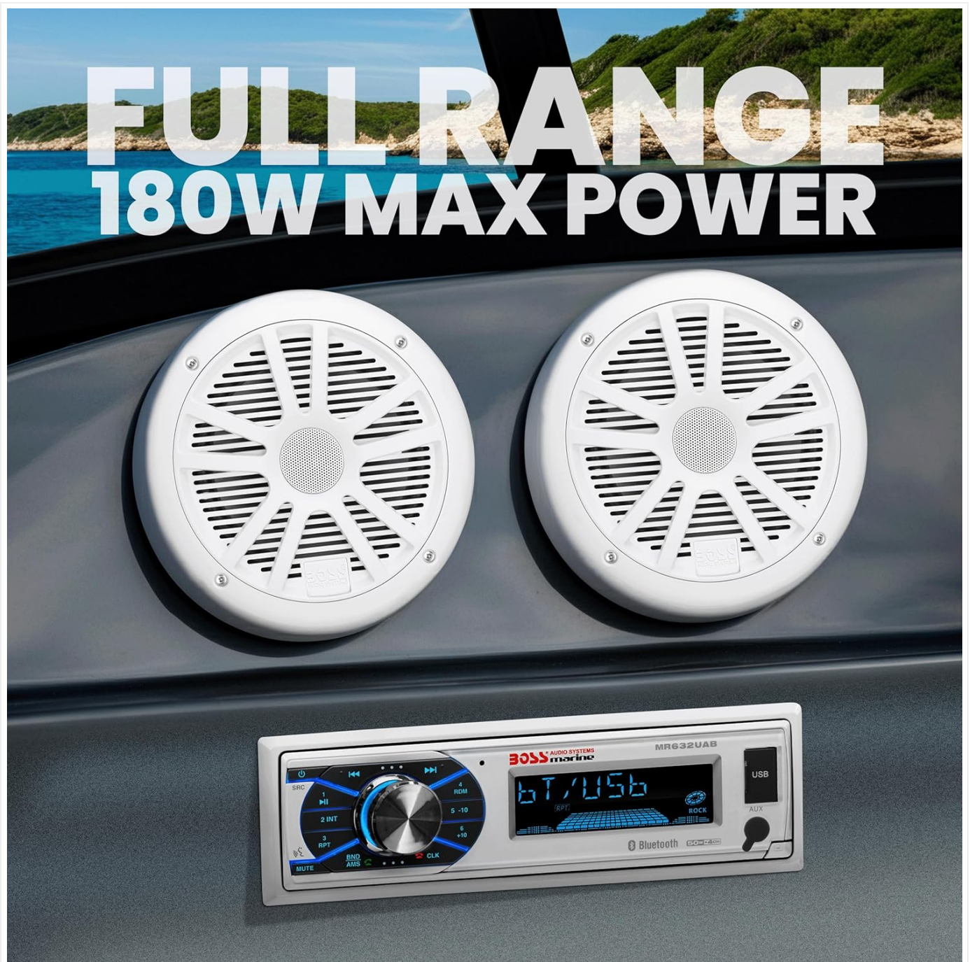
Image: Two white BOSS Audio Systems marine speakers seamlessly integrated into the interior panel of a boat, demonstrating a typical installation scenario.