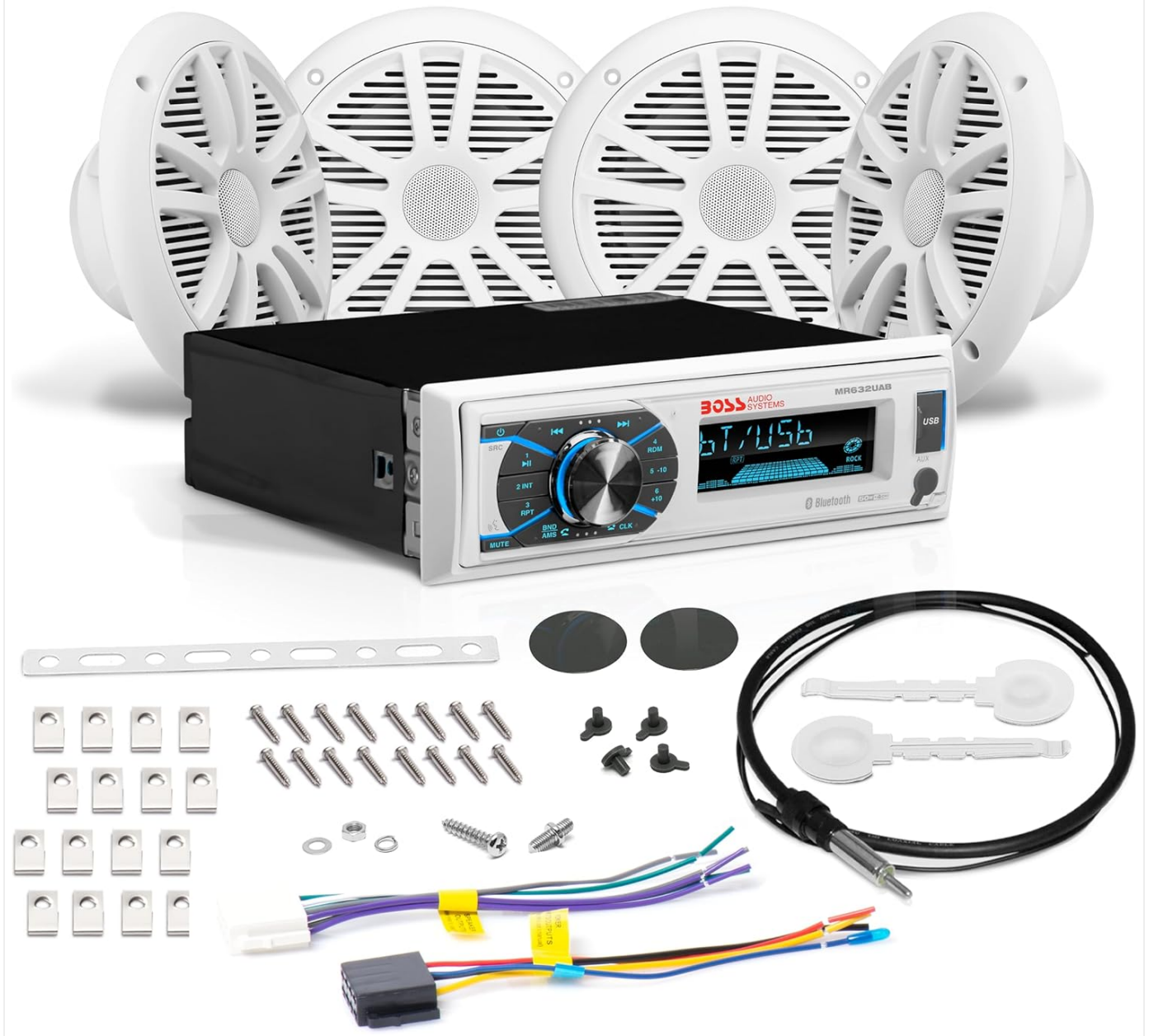
Image: A detailed view of all components included in the BOSS Audio Systems MCK632WB.64 package, such as the marine receiver, four speakers, wiring harness, mounting brackets, screws, and a wireless remote.