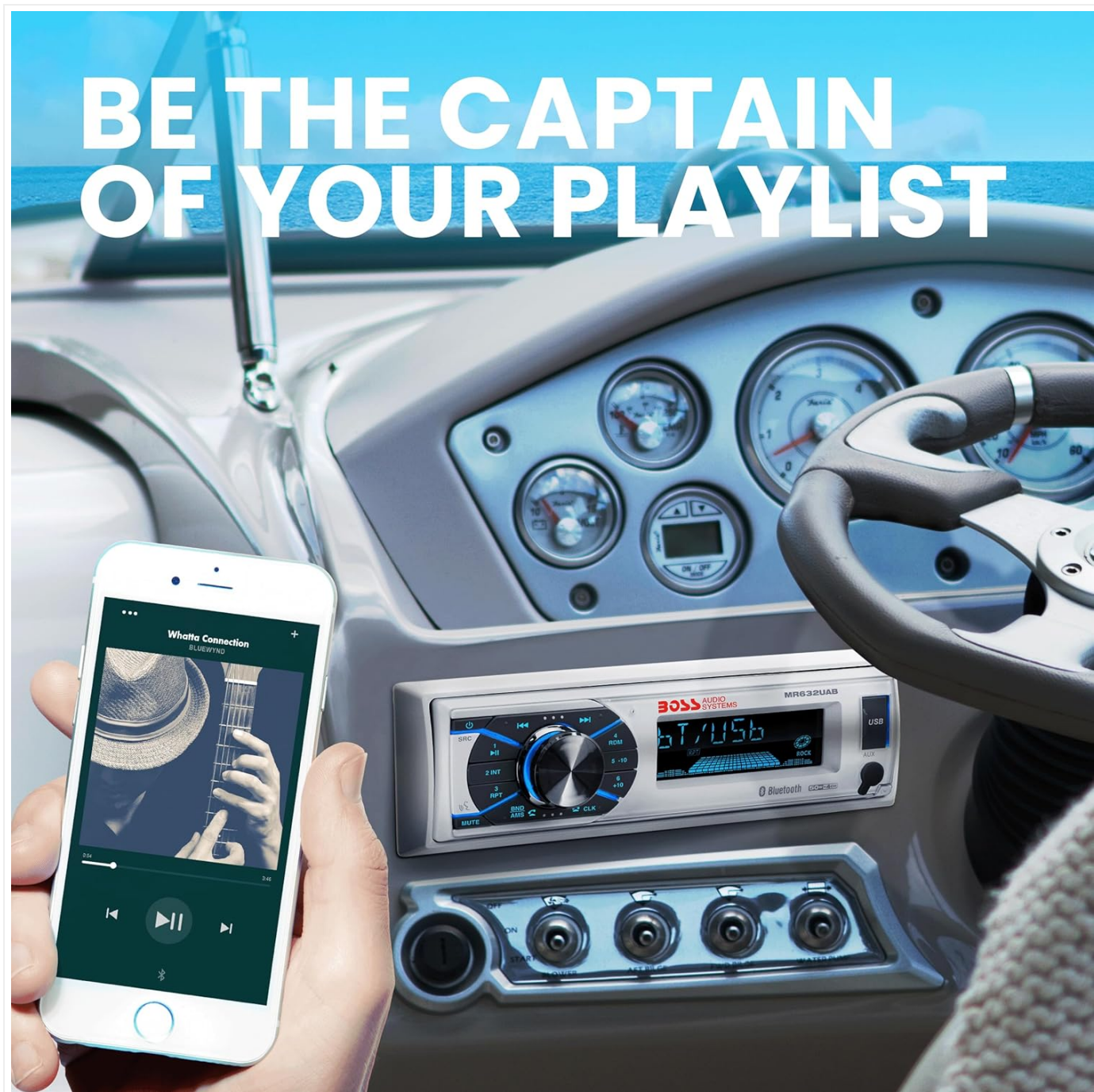
Image: A user's hand holding a smartphone displaying a music player, wirelessly connected to the BOSS marine stereo receiver mounted in a boat's dashboard, illustrating Bluetooth audio streaming.