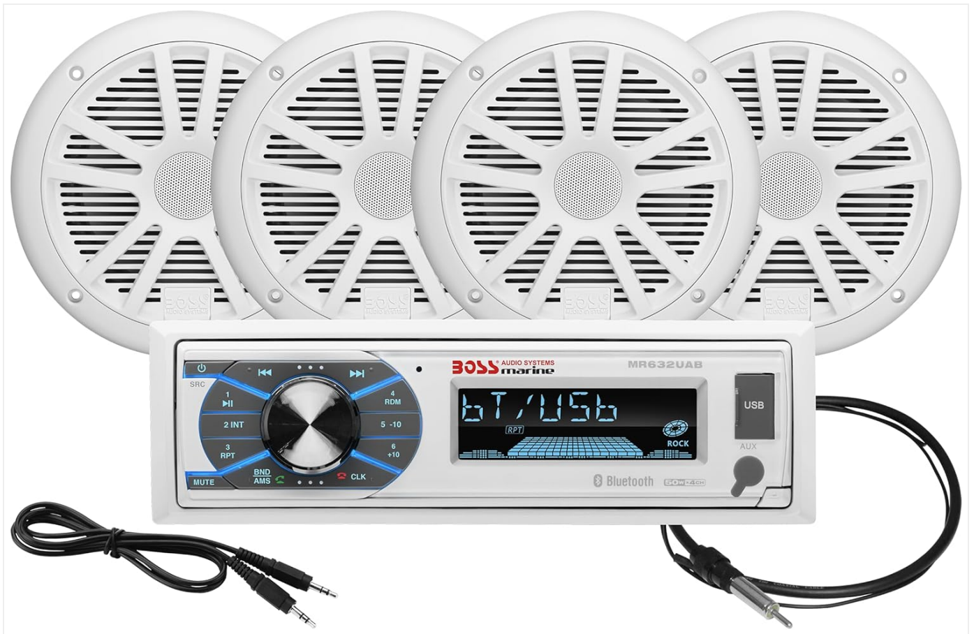
Image: The BOSS Audio Systems MCK632WB.64 Marine Stereo System, featuring the main receiver unit, four 6.5-inch white marine speakers, and associated wiring.