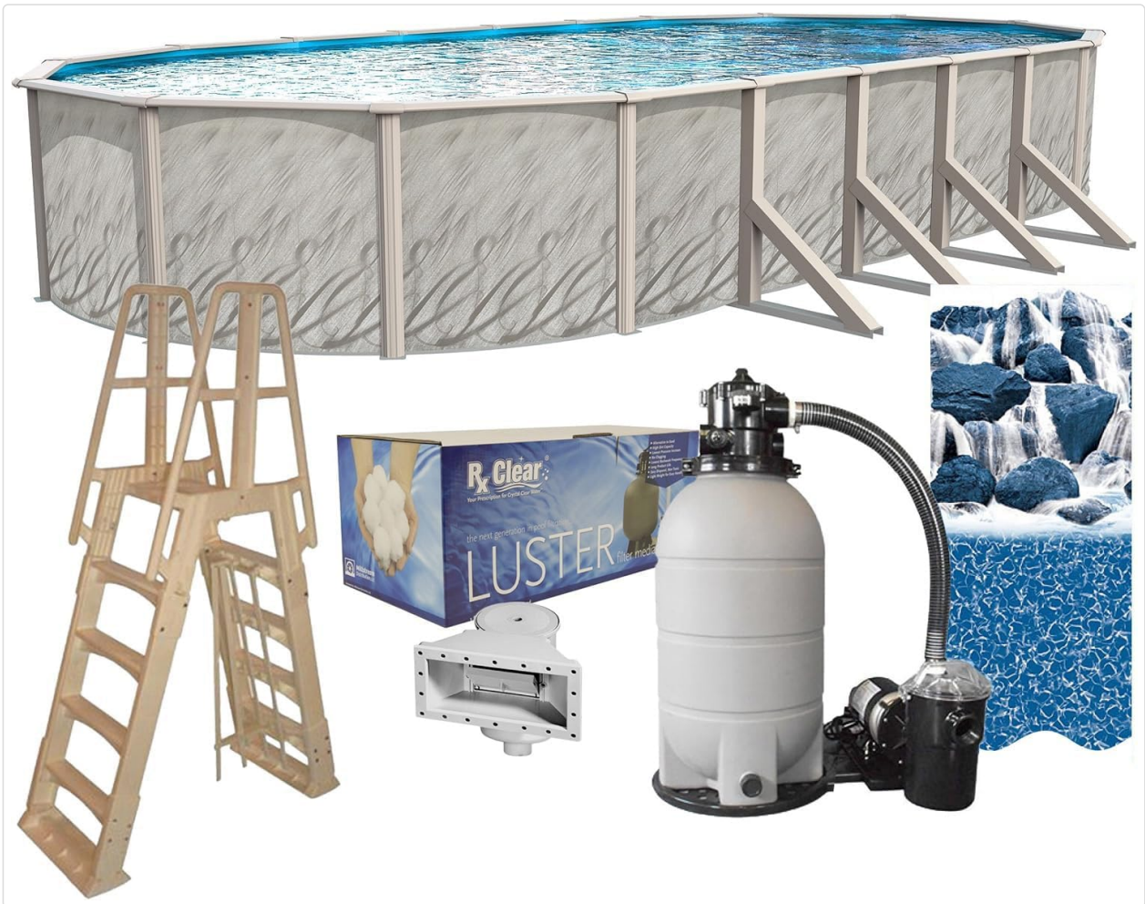
Figure 2.1: Overview of the Wilbar Meadows Reprieve 15x24 Oval Pool Kit components, including the pool structure, ladder, filter system, skimmer, and liner.