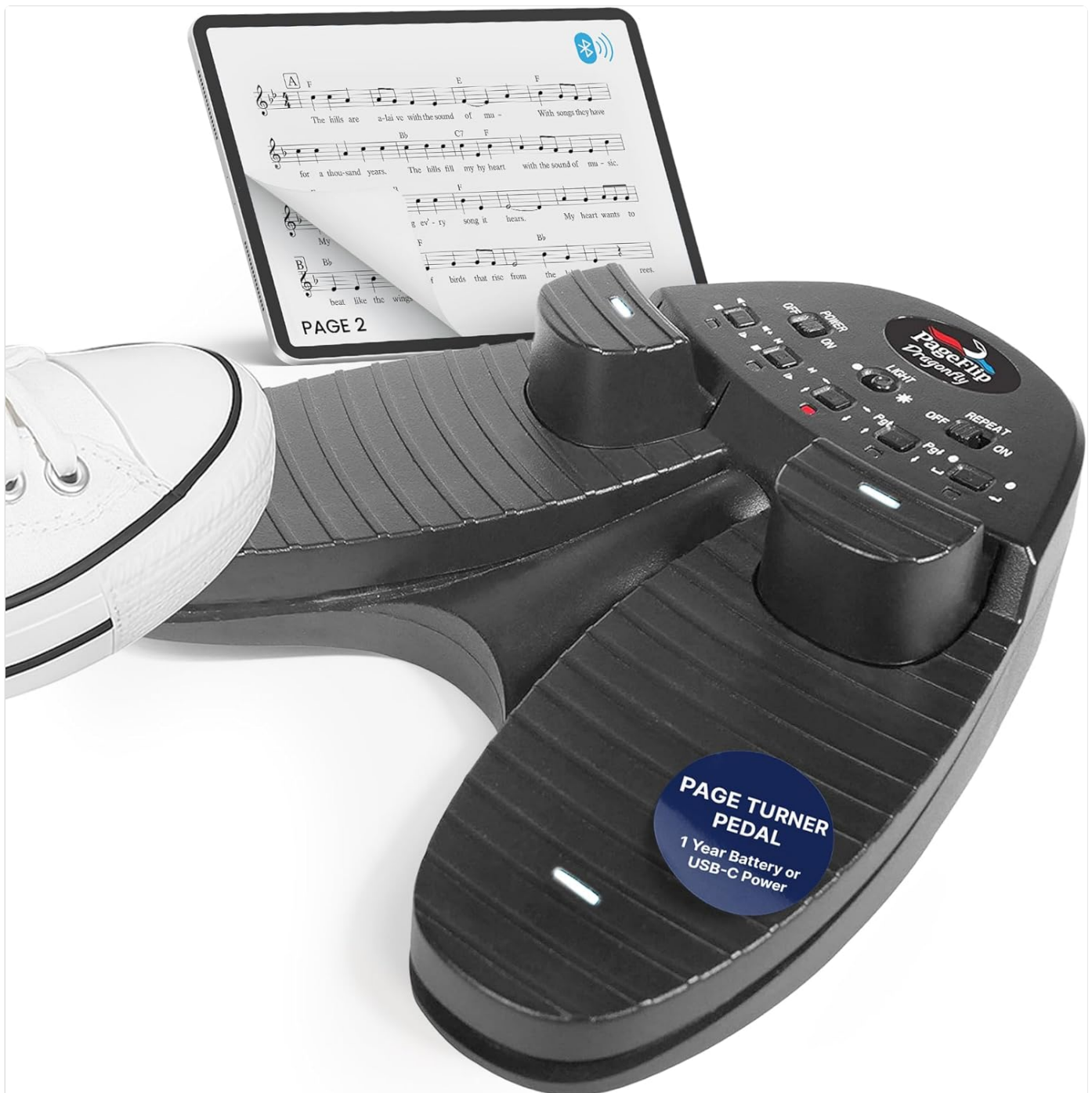
Image: The PageFlip Dragonfly pedal shown next to an iPad displaying digital sheet music, illustrating its primary use case.