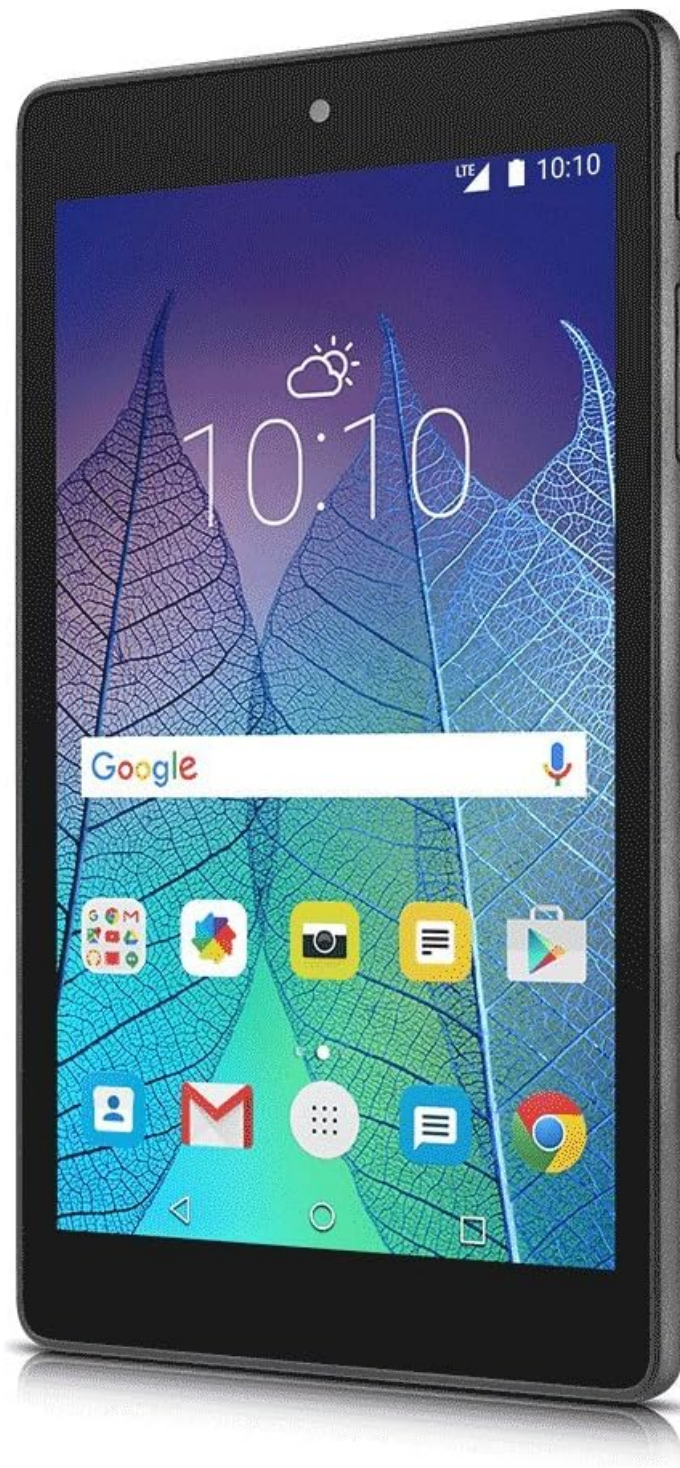
Figure 2.2: Angled front view of the Alcatel POP7 tablet, showcasing its slim profile.

An angled view of the Alcatel POP7 tablet, emphasizing its slim design. The display is active, showing the Android interface. This perspective provides a better look at the device's side bezels and overall form factor.