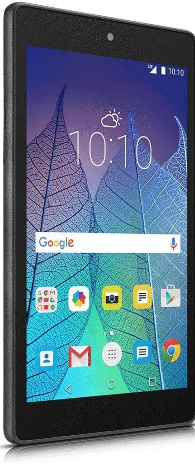
Figure 2.1: Front view of the Alcatel POP7 tablet, showing the display and front camera.

This image displays the front of the Alcatel POP7 tablet, highlighting its 7-inch display. The front-facing camera is visible at the top center of the device. The screen shows a typical Android home screen with app icons and a search bar.