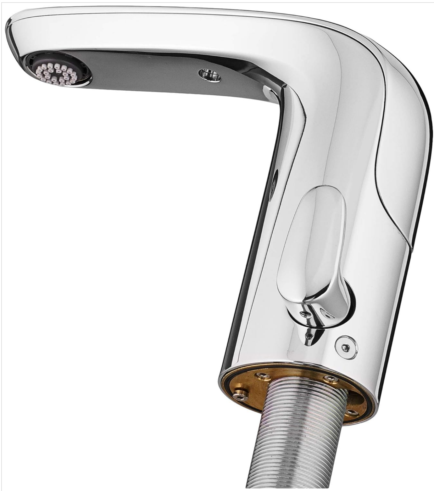
Figure 3: Underside view of the faucet spout, showing the aerator and the threaded connection for mounting.