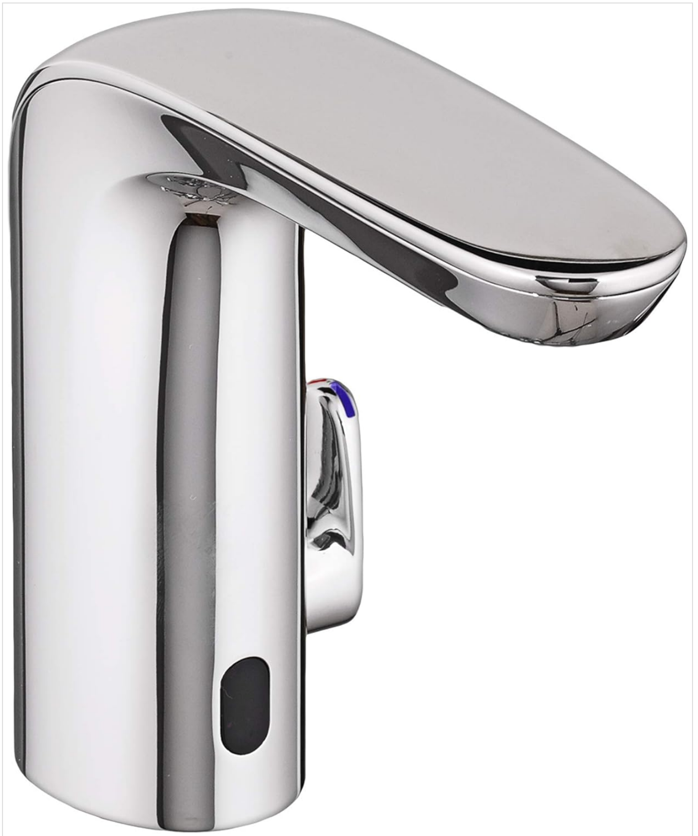
Figure 1: Front view of the American Standard NextGen Selectronic Integrated Faucet in Polished Chrome. This image displays the sleek design and the sensor located at the base of the faucet body.