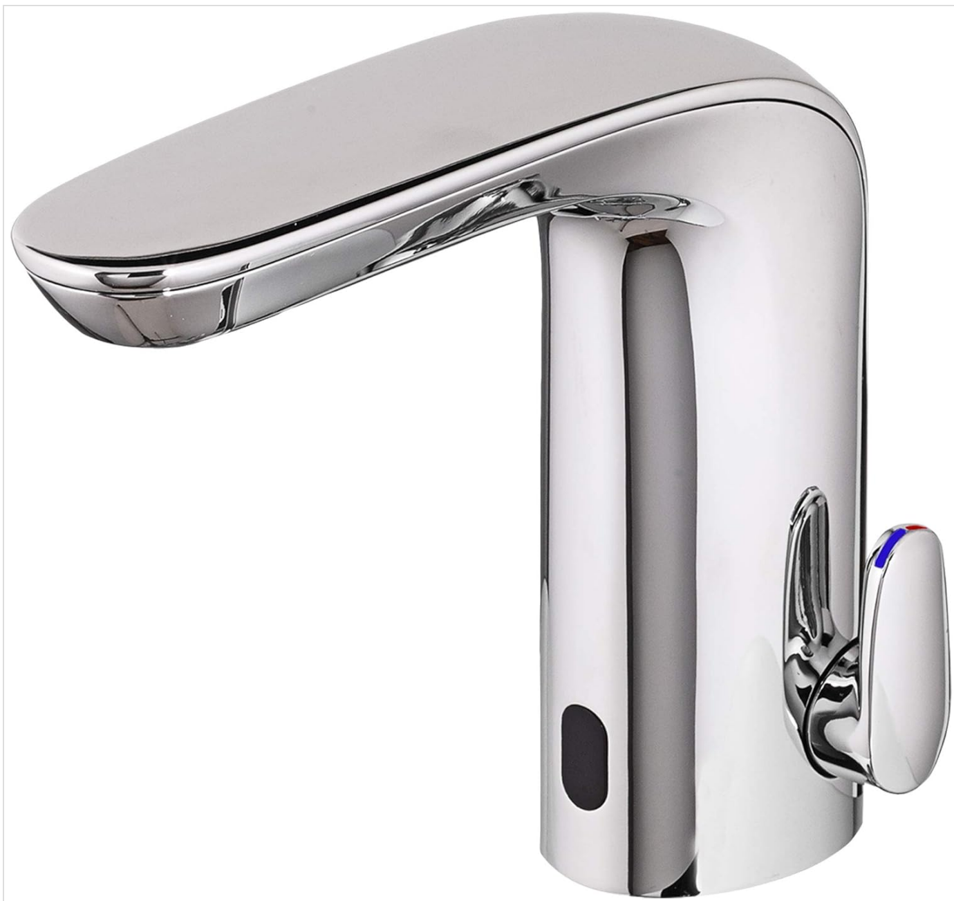
Figure 2: Side view of the faucet, highlighting the above-deck mixing handle. This handle allows users to adjust water temperature.