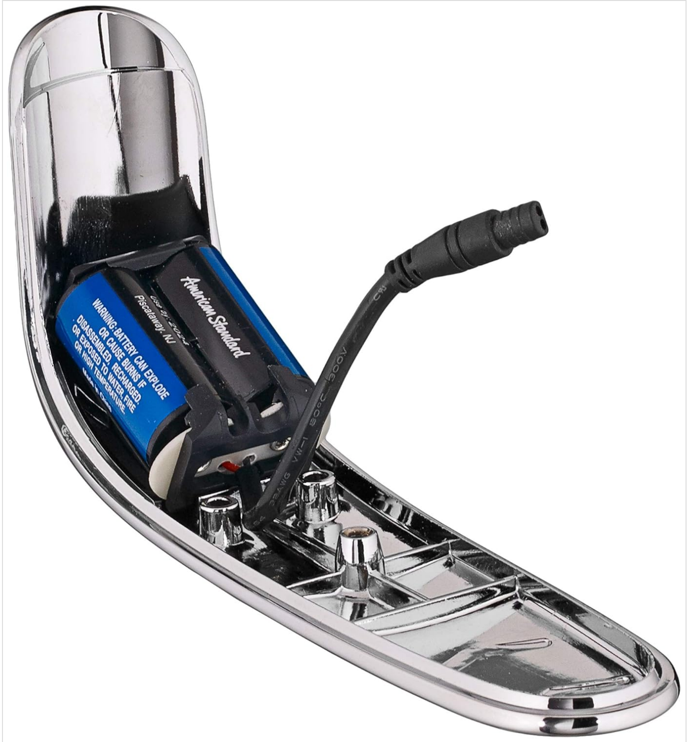
Figure 4: Internal view of the faucet body, illustrating the location of the pre-installed battery. This design integrates electronics directly into the spout.