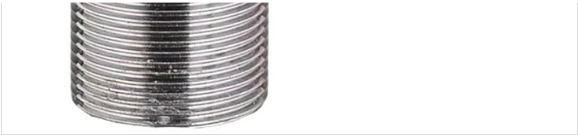
Figure 5: Close-up of the solenoid valve, a key component for controlling water flow in the electronic faucet. This part is integrated within the faucet assembly.