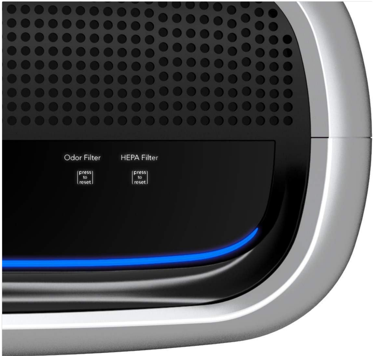
Figure 4: Air Quality Indicator Bar displaying various particle count levels.