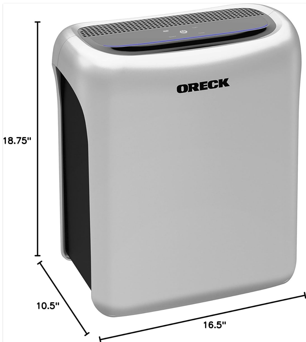
Figure 8: Product dimensions.