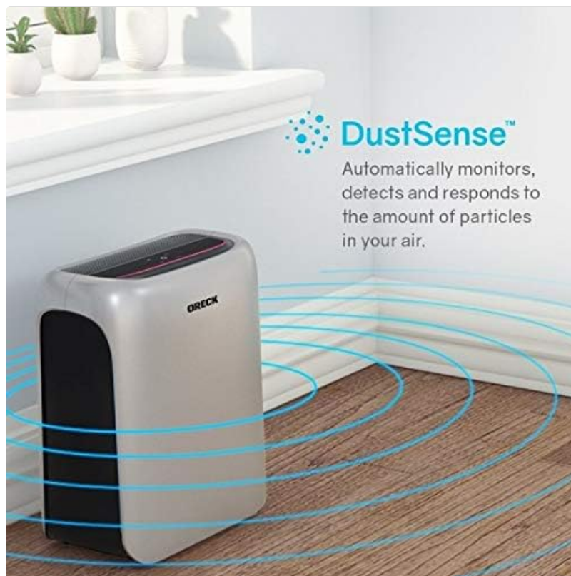
Figure 5: Illustration of DustSense technology monitoring and responding to air particles.