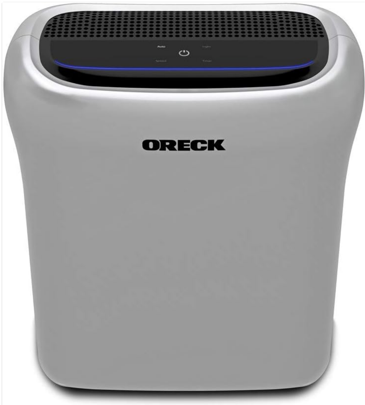
Figure 1: Front view of the Oreck Air Response Air Purifier.