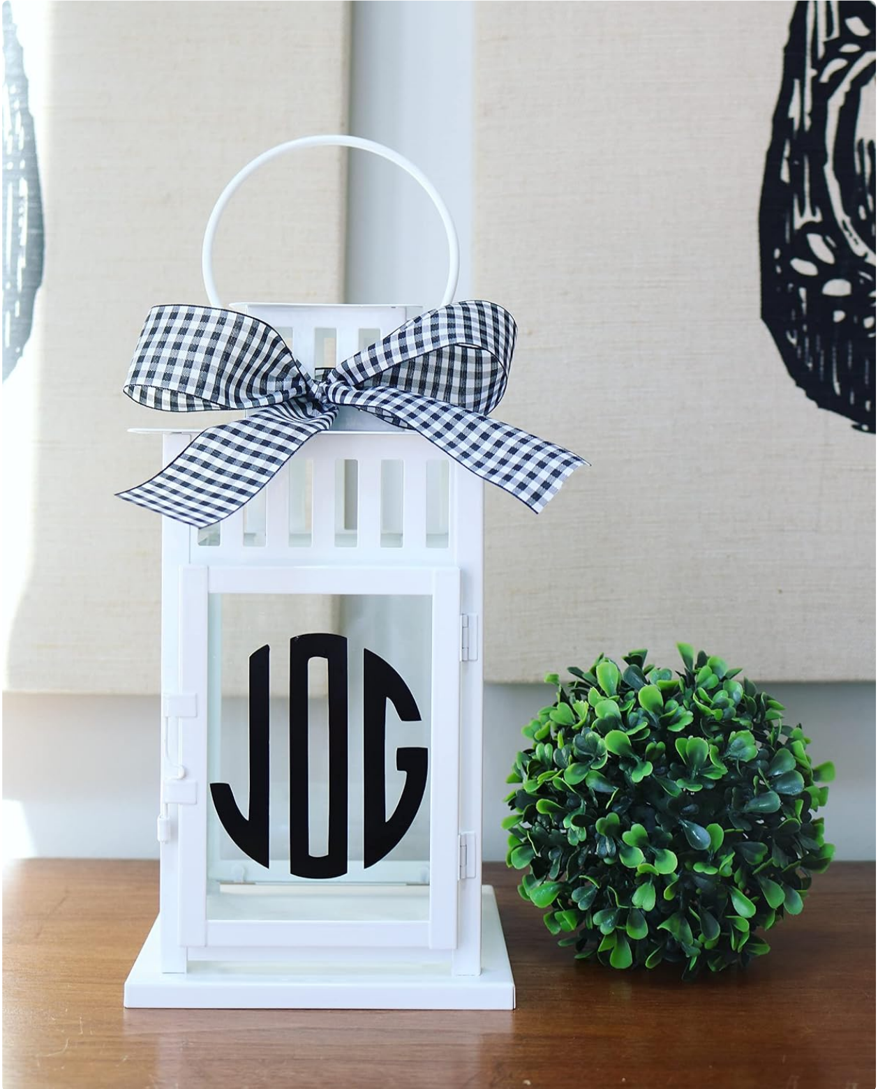
Image 4.1: An example of ORACAL 651 vinyl applied to a white lantern, demonstrating a finished craft project.