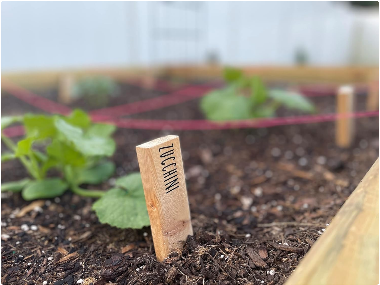
Image 7.1: A wooden garden marker with a vinyl label, demonstrating outdoor application.