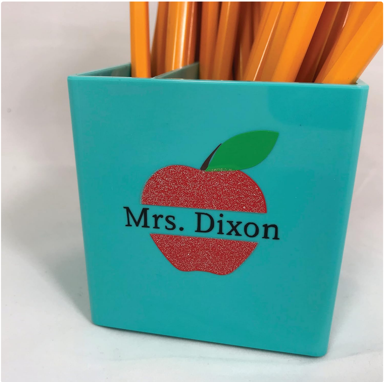
Image 5.2: A teal pencil holder personalized with an apple and name design using ORACAL 651 vinyl.