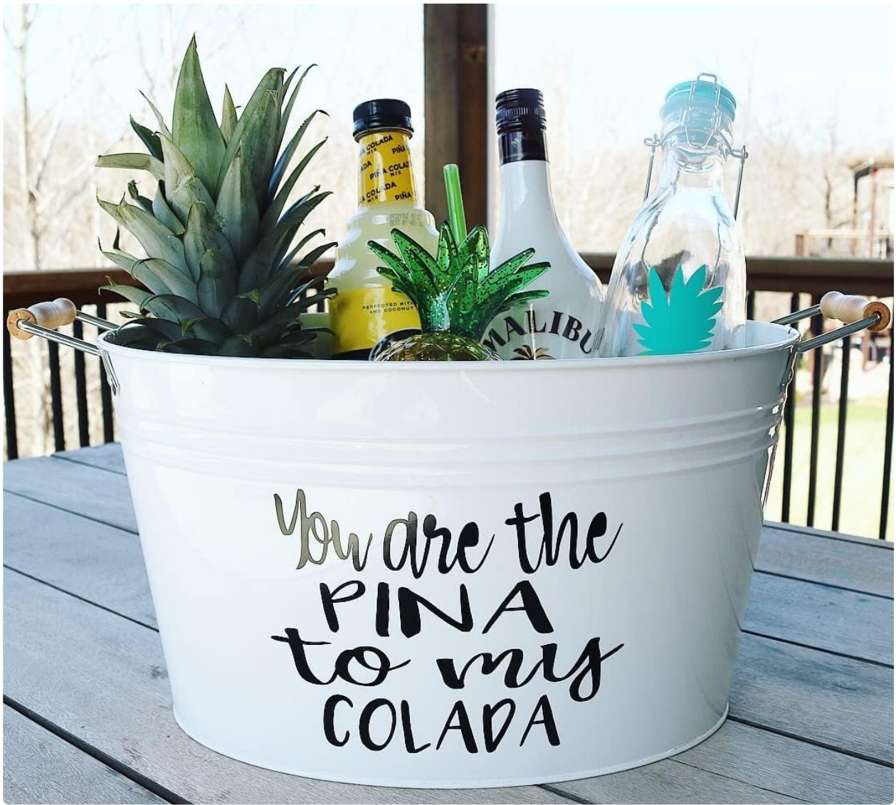
Image 5.1: A white metal bucket decorated with a custom vinyl design, showcasing another application idea.