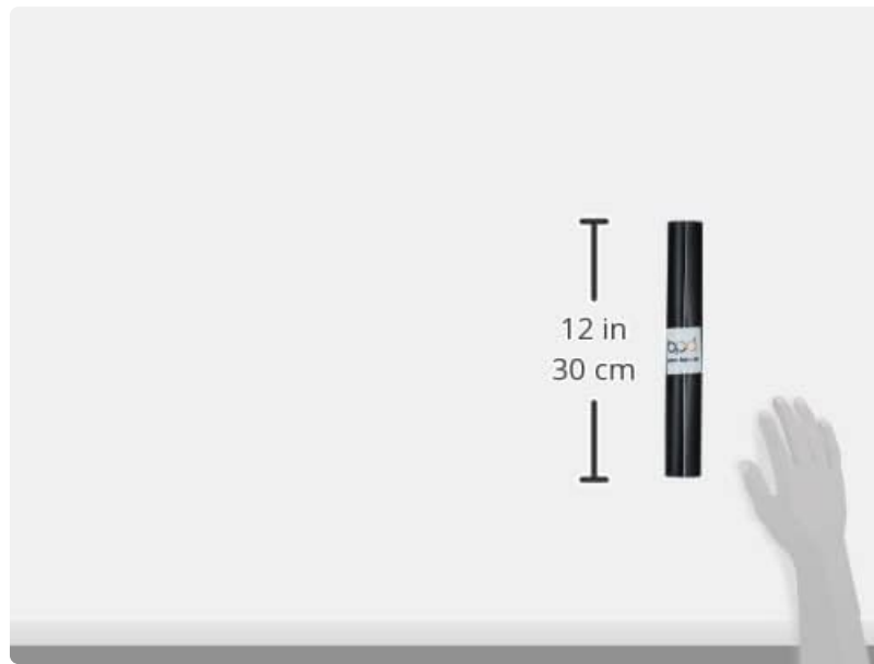
Image 6.1: Visual representation of the 12-inch width of the ORACAL 651 vinyl roll.