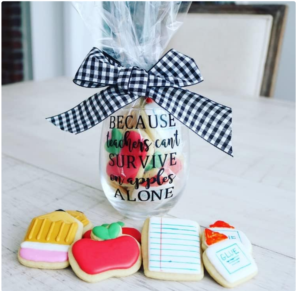
Image 4.2: A wine glass customized with ORACAL 651 vinyl, surrounded by decorative cookies.