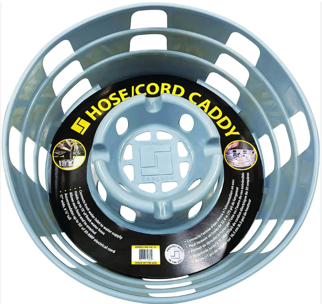
Image 1.1: The Stromberg Carlson HC-75 RV Hose and Cord Caddy, shown with its product label.