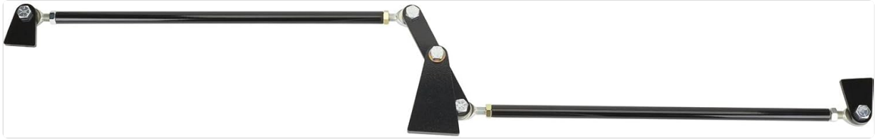
Figure 2.1: The Speedway Motors Universal Watts Link assembly, showcasing its robust design for lateral axle control.