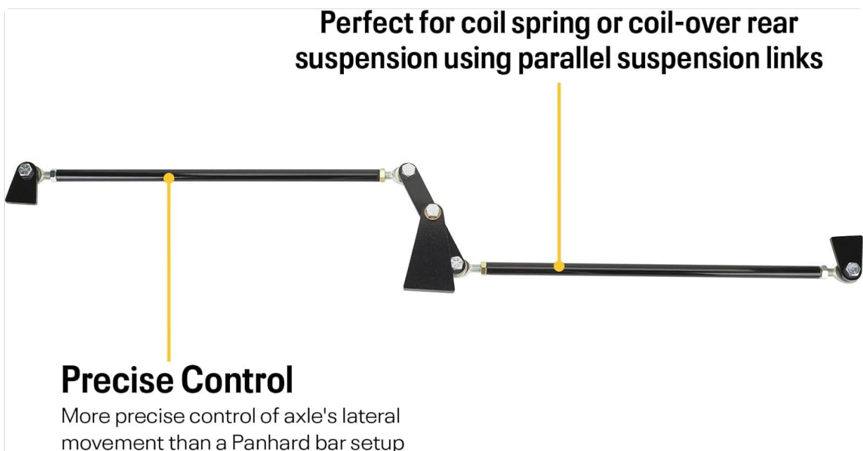
Figure 5.1: Visual representation of the Watts Link providing precise lateral control, ideal for coil spring or coil-over rear suspension systems.

A Watts link system provides superior lateral axle location compared to a Panhard bar. While a Panhard bar moves the axle in an arc, causing slight lateral shift during suspension travel, a Watts link uses a central pivot and two opposing links to keep the axle centered relative to the chassis. This design minimizes lateral movement of the axle, leading to more predictable handling and improved stability, especially during cornering.