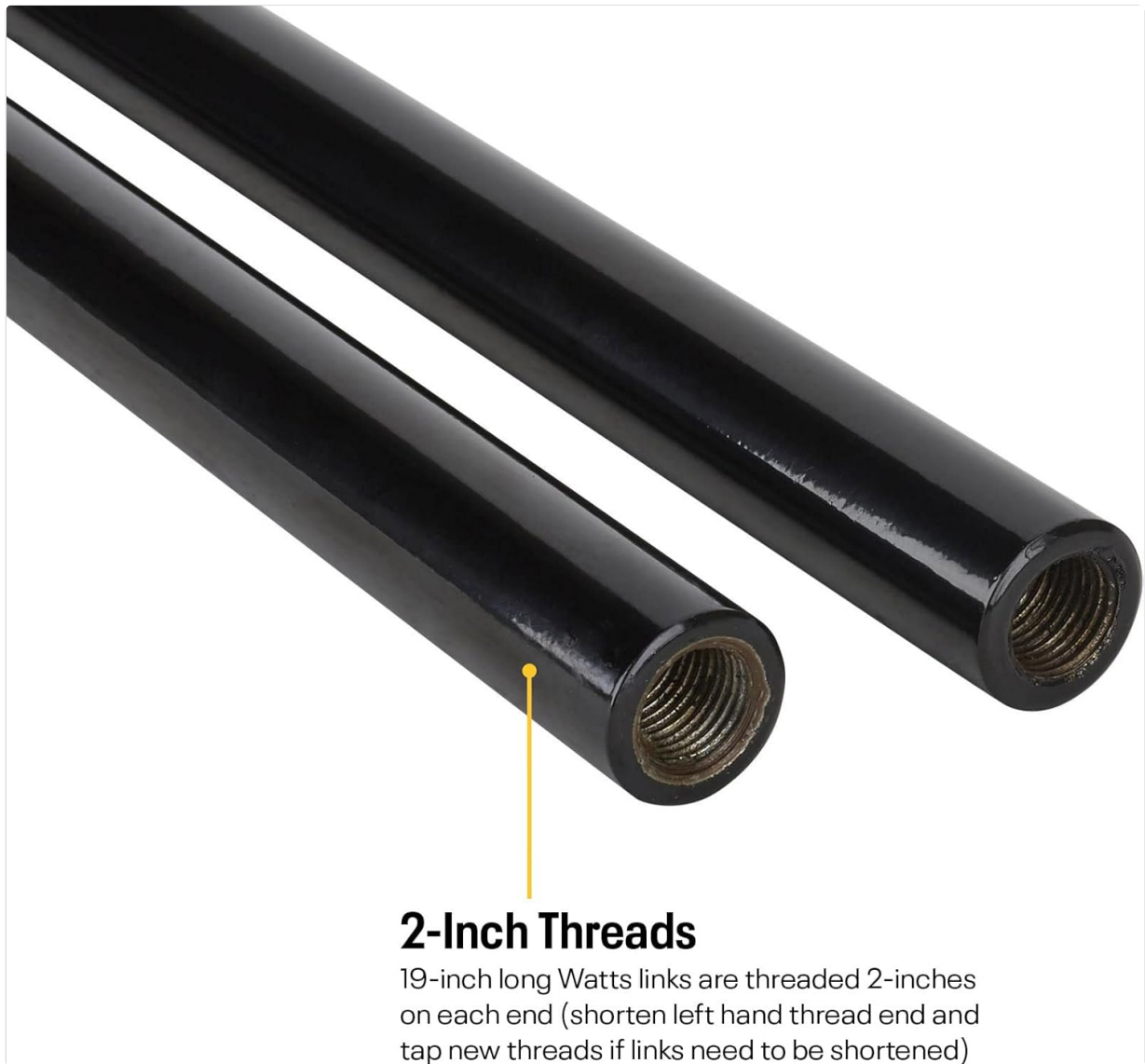
Figure 3.2: Detail of the 2-inch threaded ends on the Watts links, facilitating length adjustments.