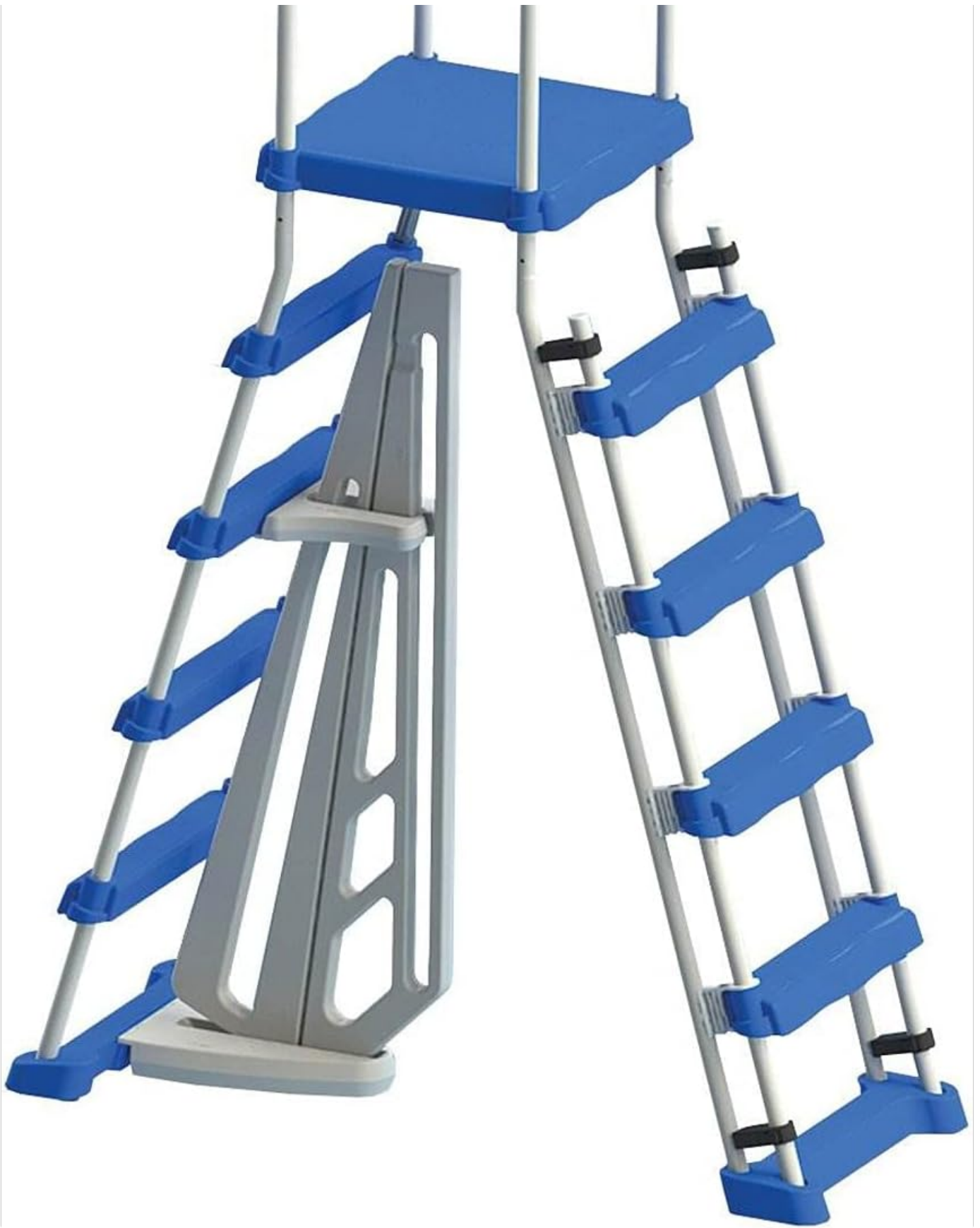
Figure 5: A-frame pool ladder.