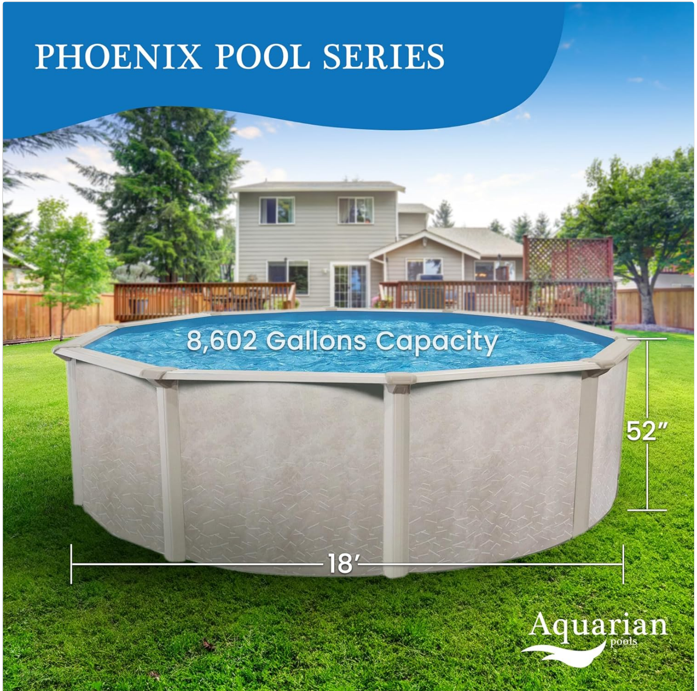
Figure 1: Aquarian Phoenix 18' x 52" Above-Ground Pool.

water distribution. Clear the area of any sharp objects, rocks, or debris. Consider using a ground cloth or padding for added protection under the liner.