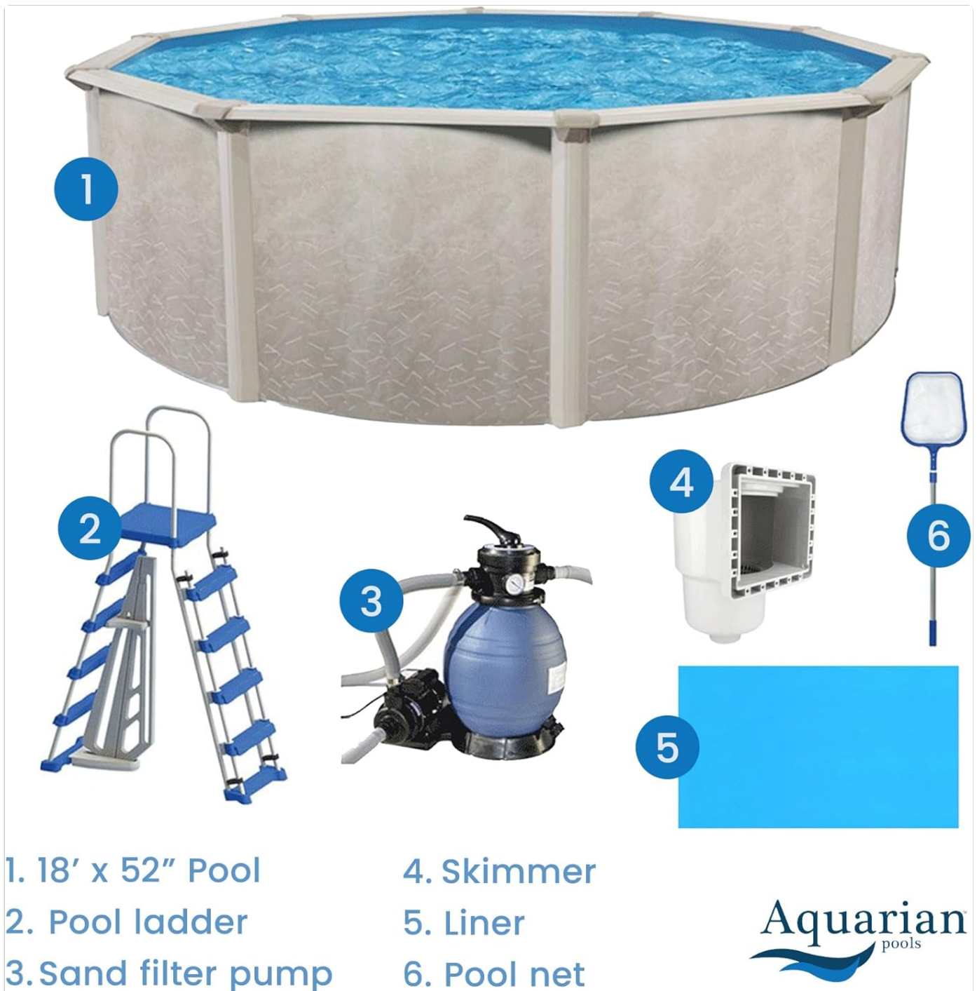
Figure 2: Included components of the pool kit.