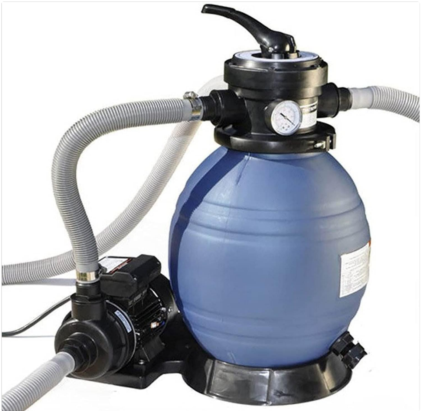
Figure 4: Sand filter pump system.