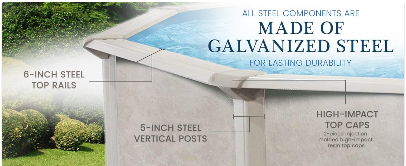
Figure 3: Detail of steel frame construction.