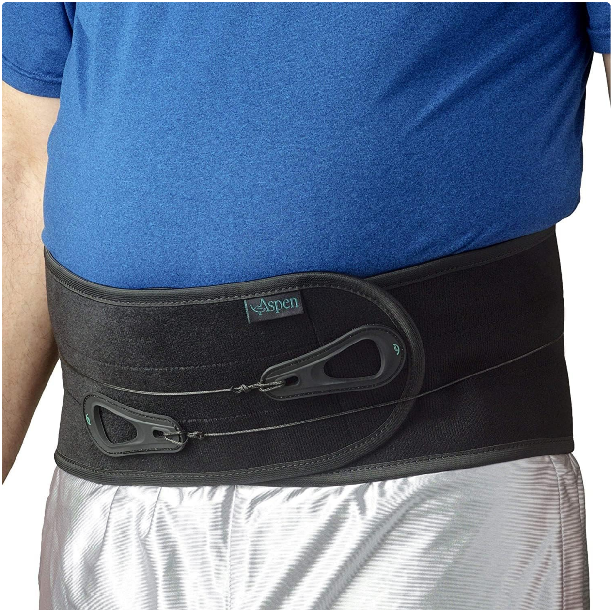
Image: The ASPEN Lumbar Support Back Brace correctly positioned on a user's lower back.