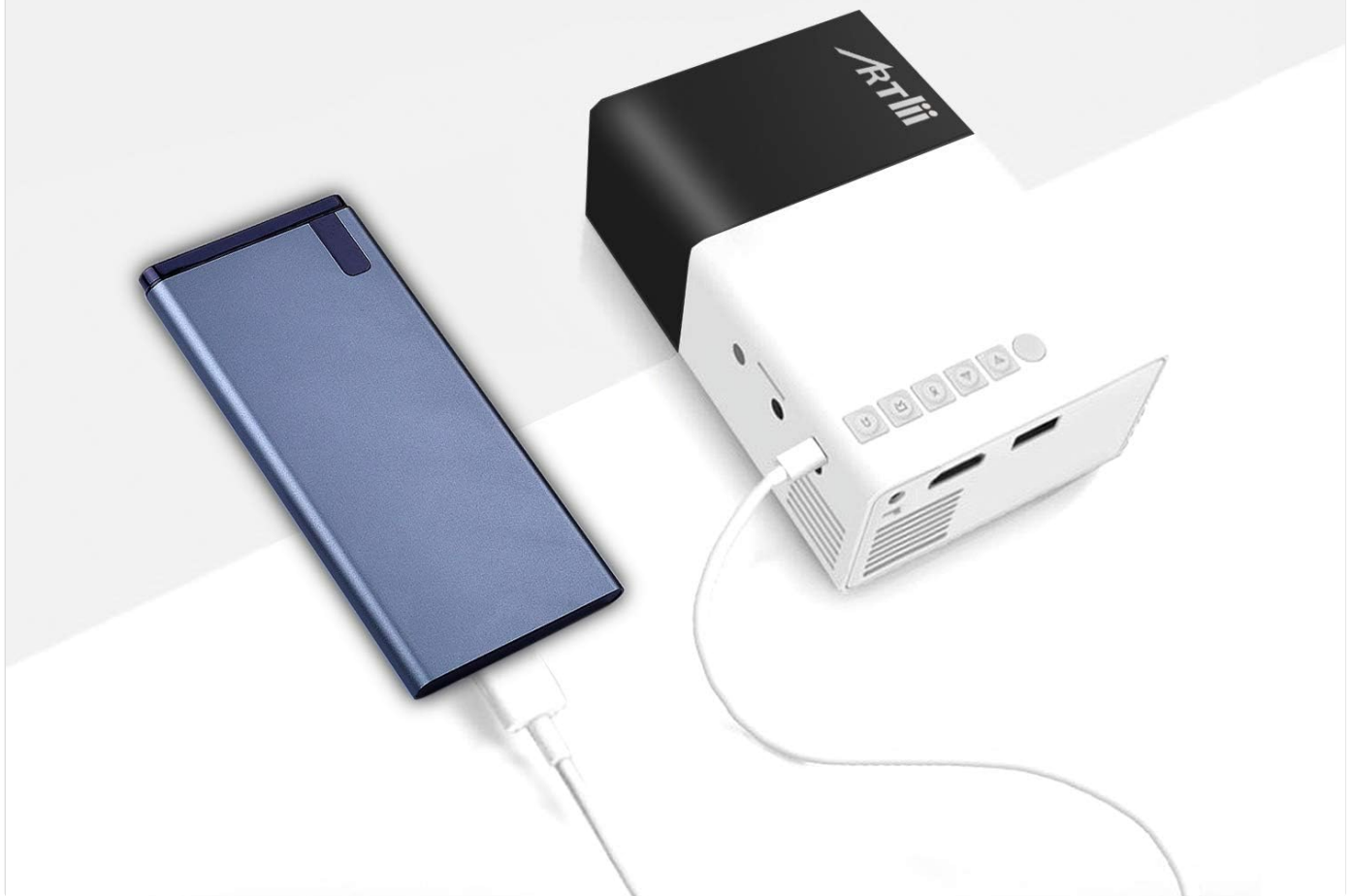
Image: The Artlii YG300 projector being powered by a portable power bank via its Micro USB input, demonstrating its portability.