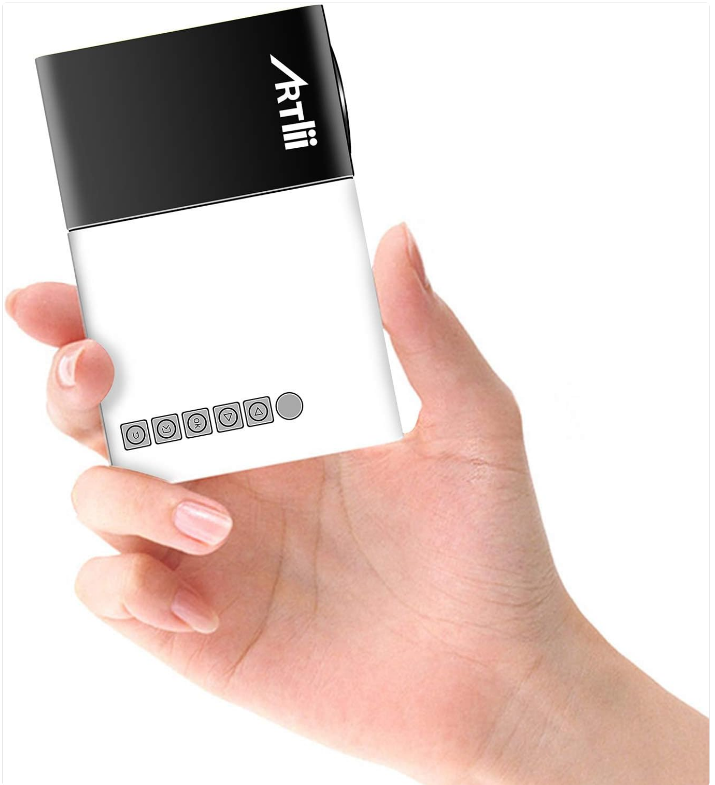
Image: The Artlii YG300 Mini Portable Projector, showing its compact size and top-mounted control buttons.

The front of the projector features the lens and a focus adjustment dial. The top panel includes control buttons for navigation and selection.