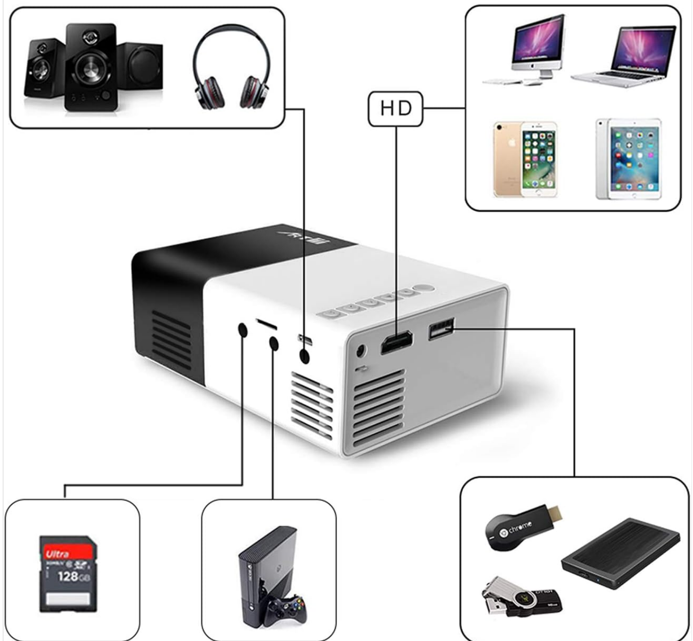
Image: Diagram illustrating the various input and output ports on the Artlii YG300 projector, including HDMI, USB, Micro SD, AV, and audio out.