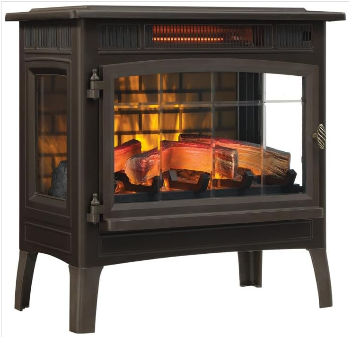
Image 1.1: Front view of the Duraflame Freestanding Electric Fireplace Stove Heater in bronze.