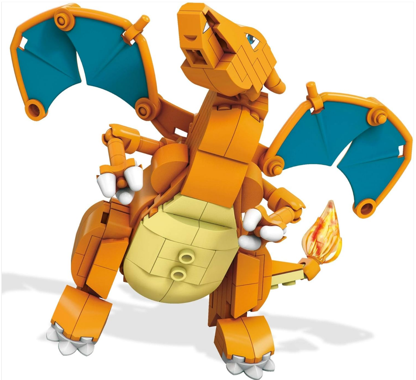
Image: The Mega Construx Charizard figure displayed on its buildable stand, posed as if in flight, with wings outstretched.