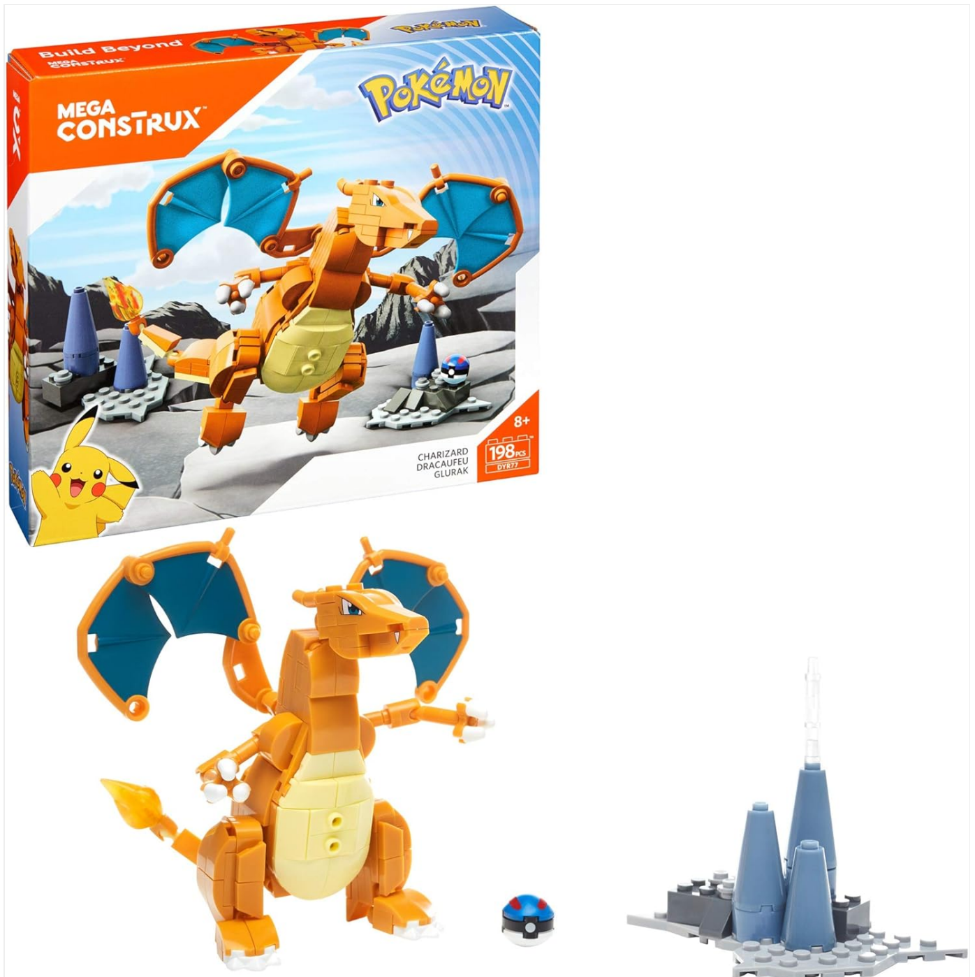
Image: The Mega Construx Pokémon Charizard building set, showing the product box, the fully assembled Charizard figure, its display stand, and a small Great Ball accessory.

Once assembled, the Charizard figure stands approximately 4.5 inches tall and features poseable parts for dynamic display.