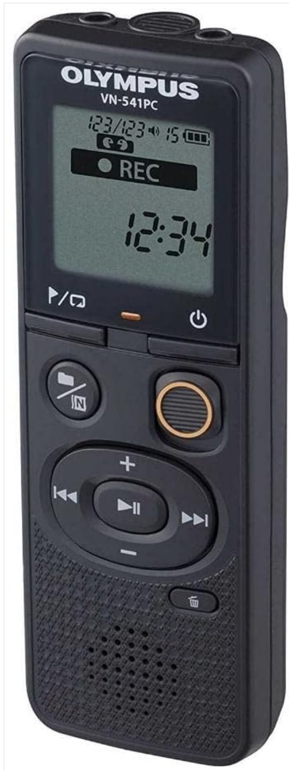
Image: The Olympus VN-541PC voice recorder, a compact black device with a clear LCD screen and control buttons.