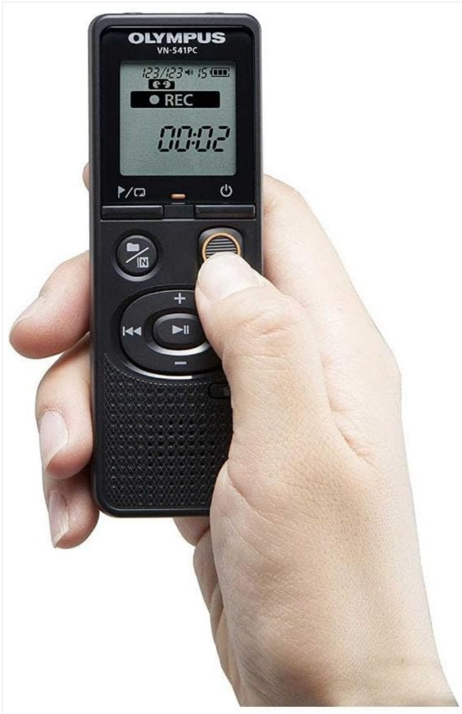
Image: A hand holding the Olympus VN-541PC, demonstrating the position of the REC switch for easy one-handed operation.